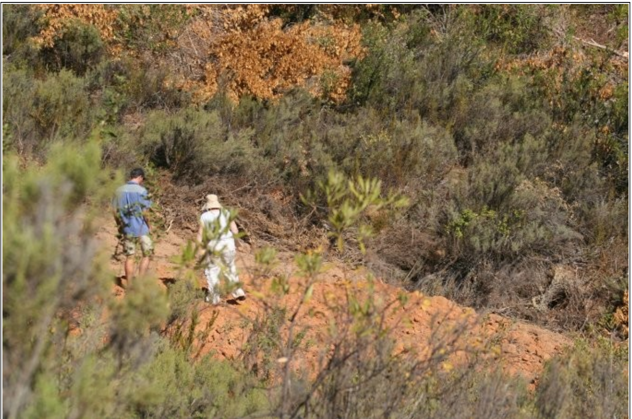
Figure 5: Open area from vegetation clearing.