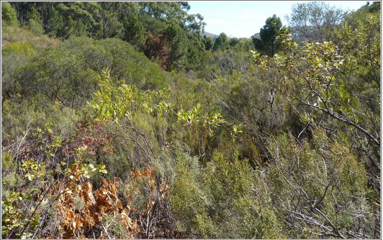
Figure 4: Dense Fynbos limited visibility.