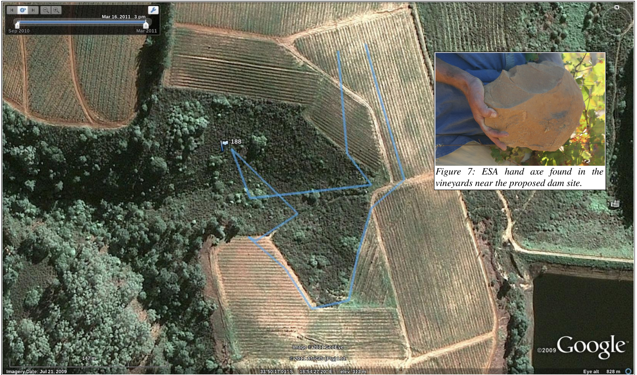
Figure 7: ESA hand axe found in the vineyards near the proposed dam site.