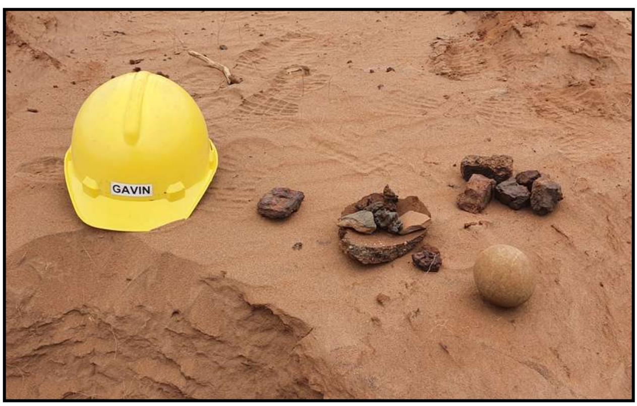
FIG. 1: IRON WORKING ARTEFACTS AT TRON)%