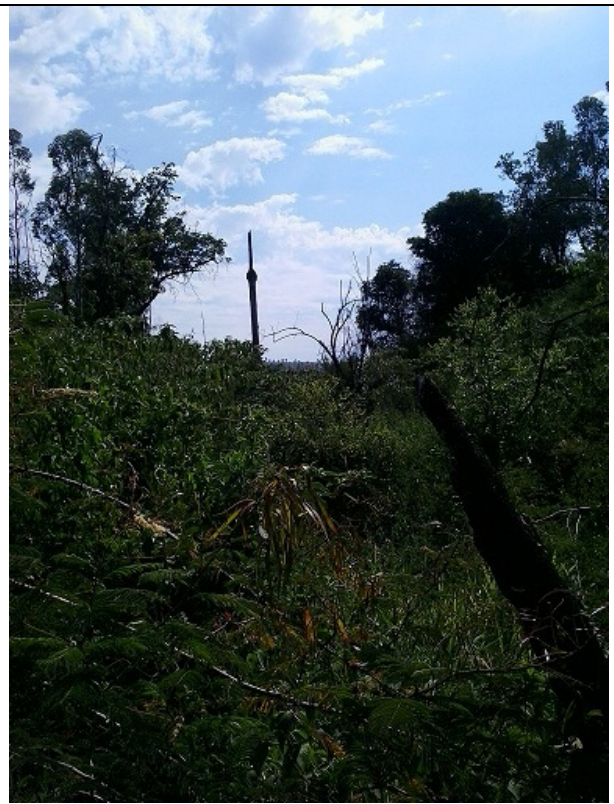
Fig 2: View of project area