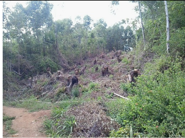
Fig 5: View of project area