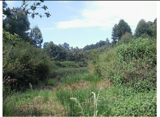
Fig 6: View of project area