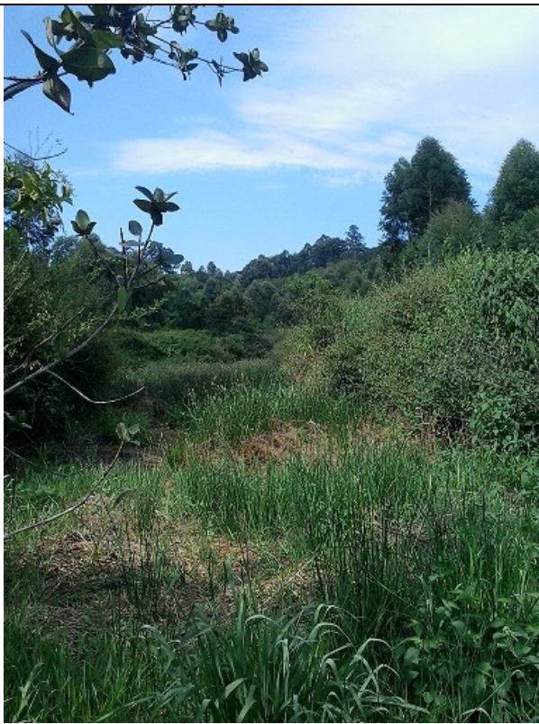
Fig 1: View of project area

The proposed areas for the 2 dams, pipelines and pumphouses are to be located on agricultural land that has been used in the past and present. The area can be considered disturbed due to existing plantations and orchards and existing pipelines.