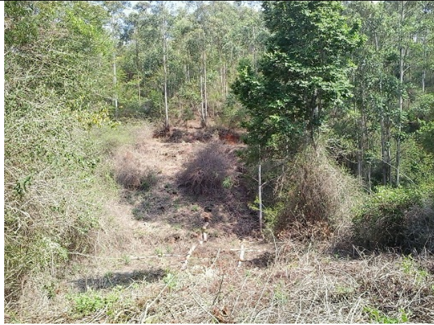
Fig 3: View of project area