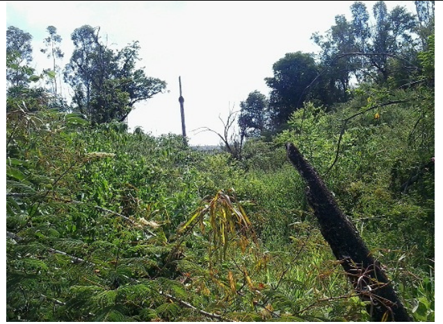
Fig 4: View of project area