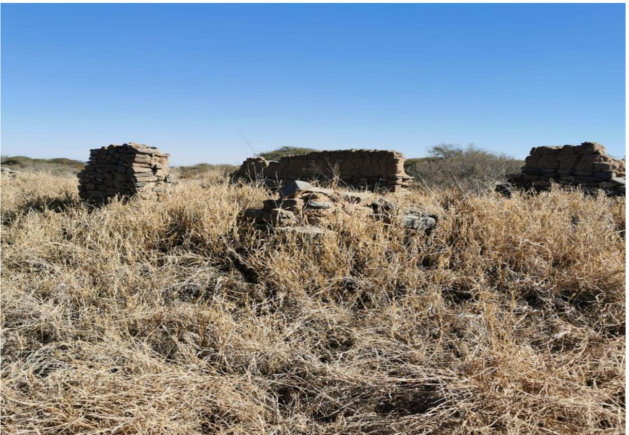
Plate 6: view of historical building that require mapping before demolition. A demolition permit will be required before this structure is destroyed.