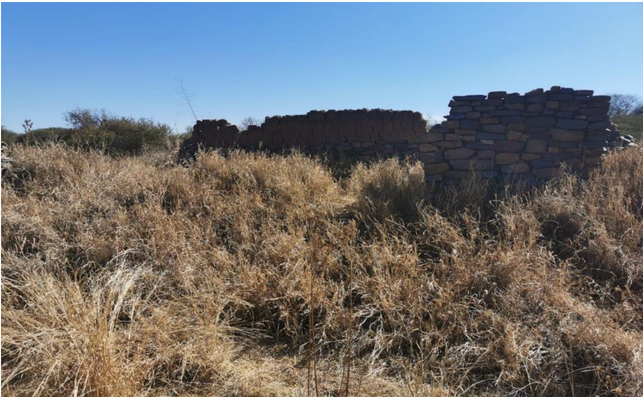
Plate 7. View of same structure which will require permit to be demolished.