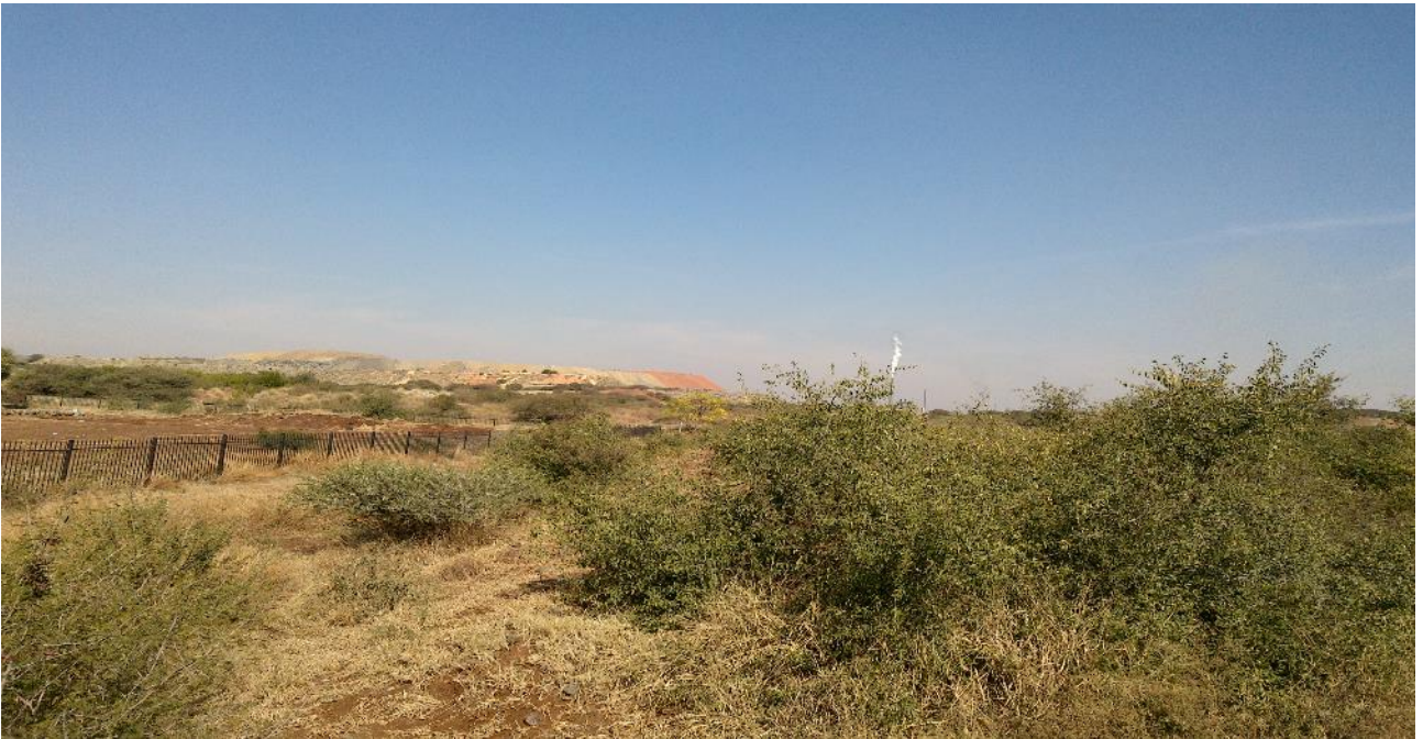
Plate 4: shows the existing production within the mine area (Author 2019).