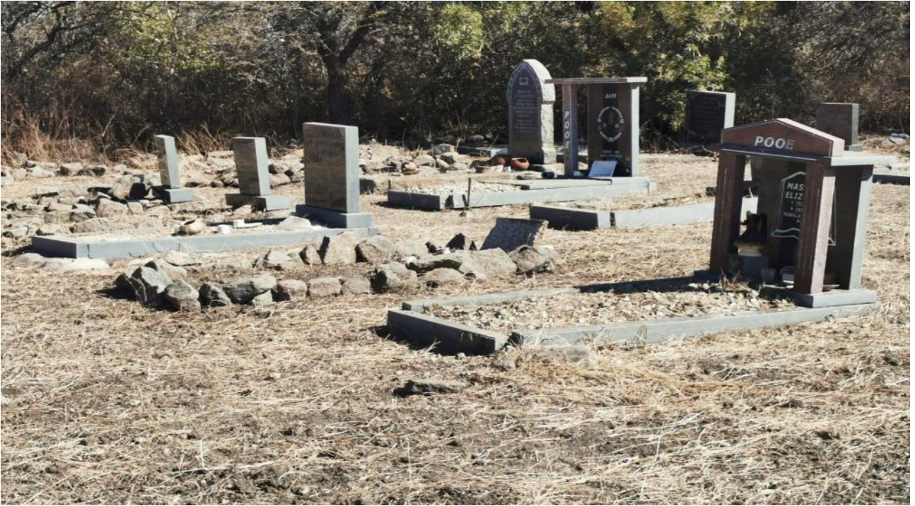
Plate 5. Set of historical graves that must be relocated to safer place in order to make way for the proposed development.