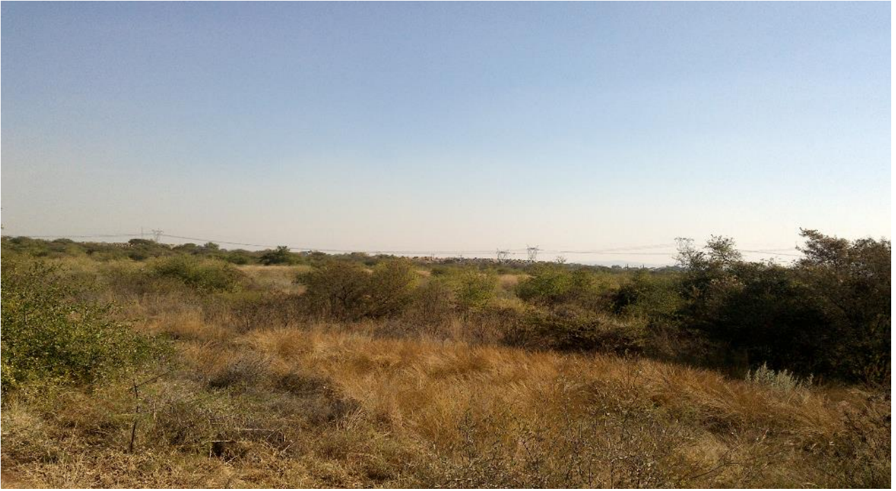
Plate 3: shows an existing landscape for the site earmarked for production expansion (Author 2019).