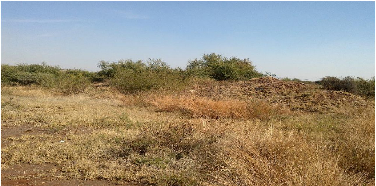
Plate 2: shows the general landscape of the area earmarked for processing (Author 2019).