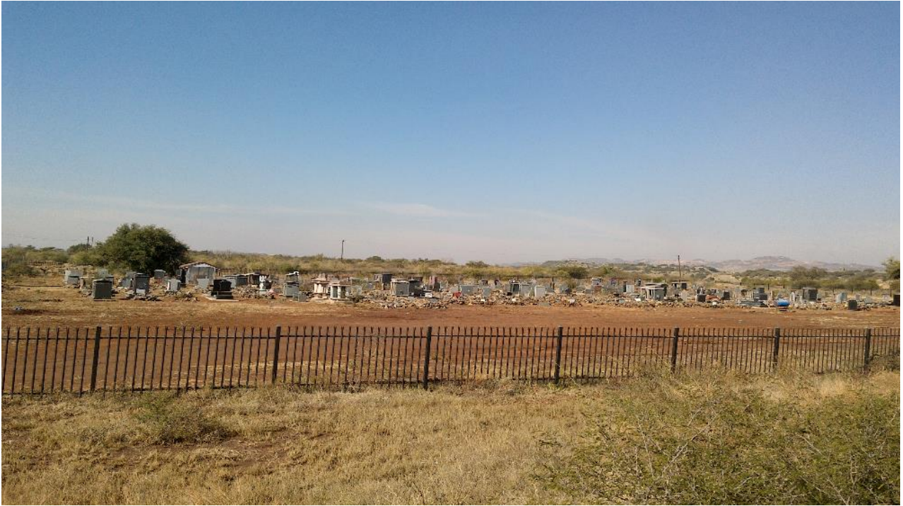
Plate 1. Contemporary graves identified adjacent to the proposed area for processing. These graves should not be disturbed nor tampered with at all and are not the subject of relocation. This graveyard is still used by Rankotea community.