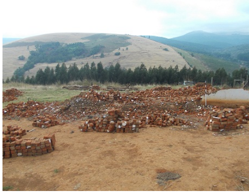
Fig 2. Remains of the old NG church.