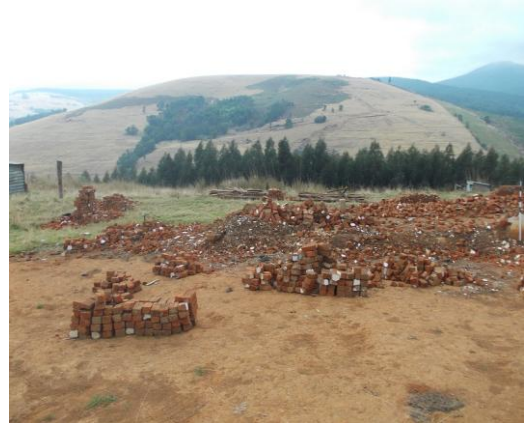
Fig 3. Piles of cleaned bricks packed by community