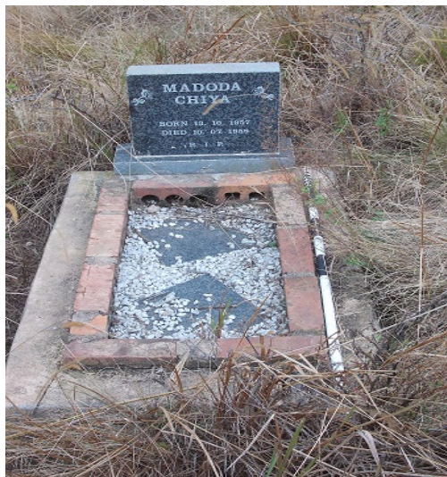
Fig 3. View of a grave at the cemetery

Mrs Sibayi mentioned that she knew of 2 other graves on the farm, a thorough survey of the area could not locate these graves. Care must be taken when developing the farm.