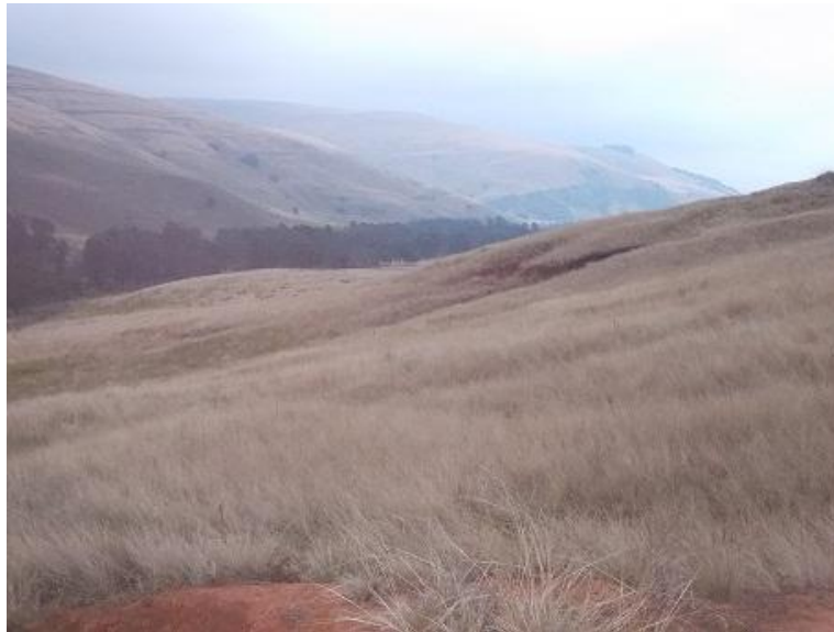
Fig 1. General view of proposed development area

The area can be described as mountainous and covers 40 ha. Vegetation in the area consists of predominantly sour grassland of the Midlands Mistbelt Grassland (Mucina & Rutherford 2006). The geology underlying the study area comprises the Ecca Group of the Karoo Supergroup and comprises mainly shale and minor sandstone. No outcrops were noted on site. General GPS co-ordinate: S30^{\circ} 29' 14.6'' E29^{\circ} 45' 17.7''