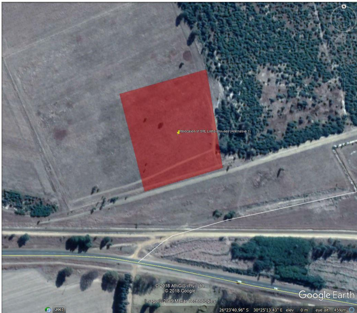
Figure 1: Google Earth photo of the study site (red rectangle)

The study area (indicated by the red rectangle in Fig. 1) is situated west of Lothair in Mpumalanga.