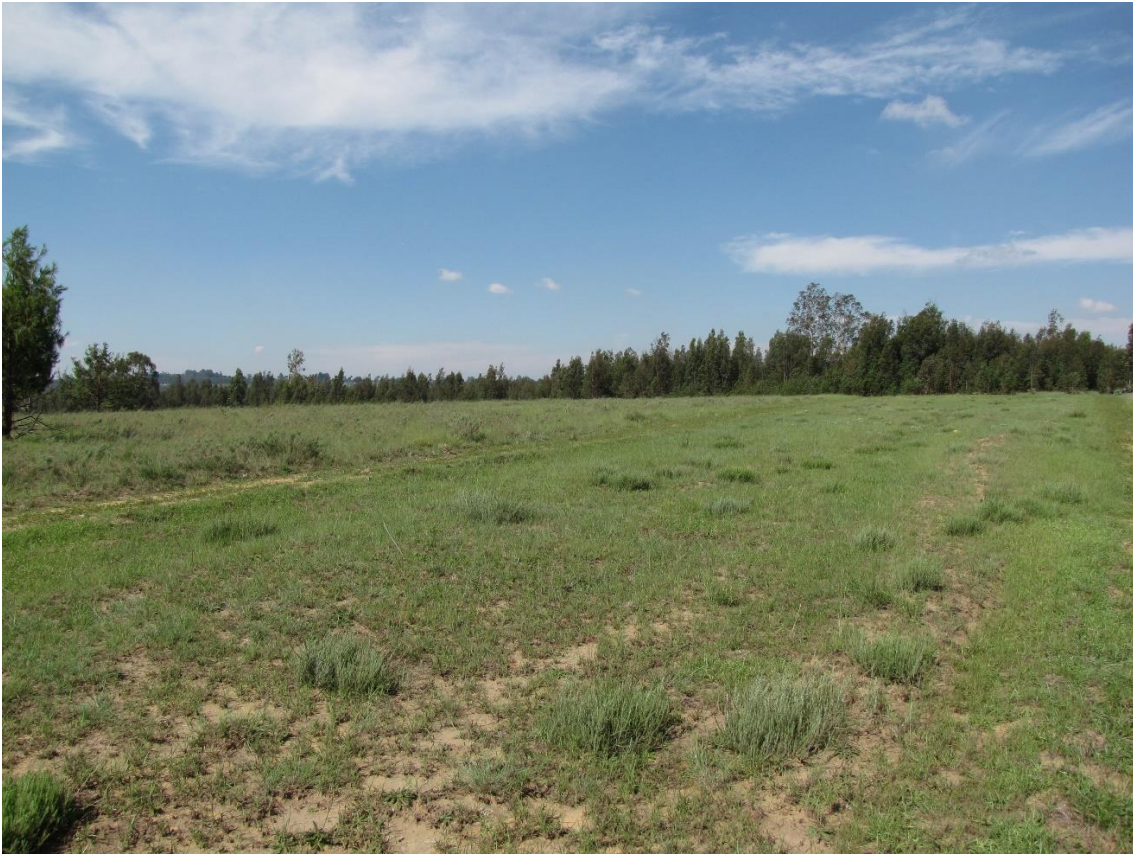
Figure 3: View of the study site (SW corner, facing NE): 26°23'49.3"S 30°25'10.1"E

The topography of the study area is essentially flat and covered in grassland (see Figs.3-6). The underlying rock formation is covered in sandy soil. No fossils were found during the field survey. There is however a high probability that fossiliferous sandstone could be uncovered in the study area when the soil and weathered rock are cleared, and unweathered bedrock is exposed.