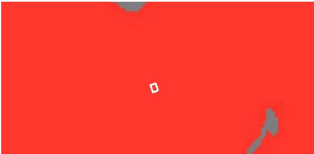
Figure 7: Palaeosensitivity map showing the position of the study site (white polygon) (SAHRA, 2019)

The Ecca Group of the Karoo Supergroup contain vast amounts of Permian leaf imprints of plants such as Glossopteris in places (Kovács-Endrödy, 1991) (see Fig. 8). Millions of tons of fossiliferous material yielding mostly Glossopteris leaf imprints have been exposed at well studied sites in the northern rim of the main Karoo Basin such as Hammanskraal (Kovács-Endrödy, 1976), Witbank (Bamford, 2004) and Vereeniging (Rayner, 1986) and the ferromanganese mine at Ryedale (Pack et al. , 2000).