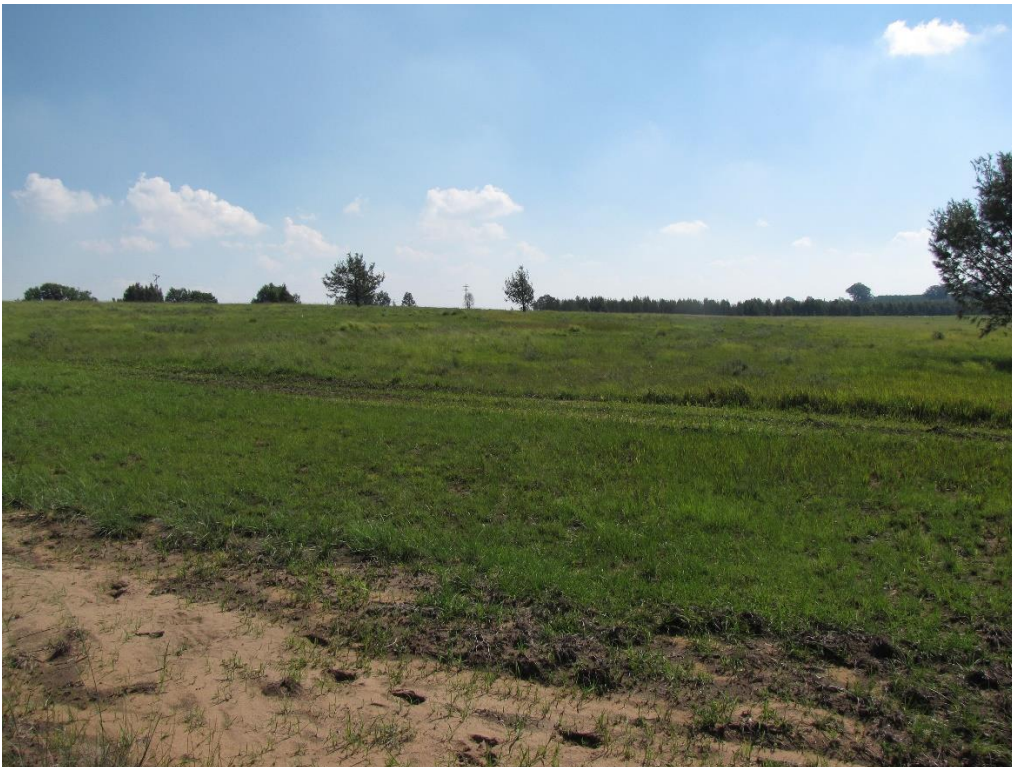
Figure 5: View of the study site (NE corner, facing SW): 26°23'43.5"S 30°25'12.8"E