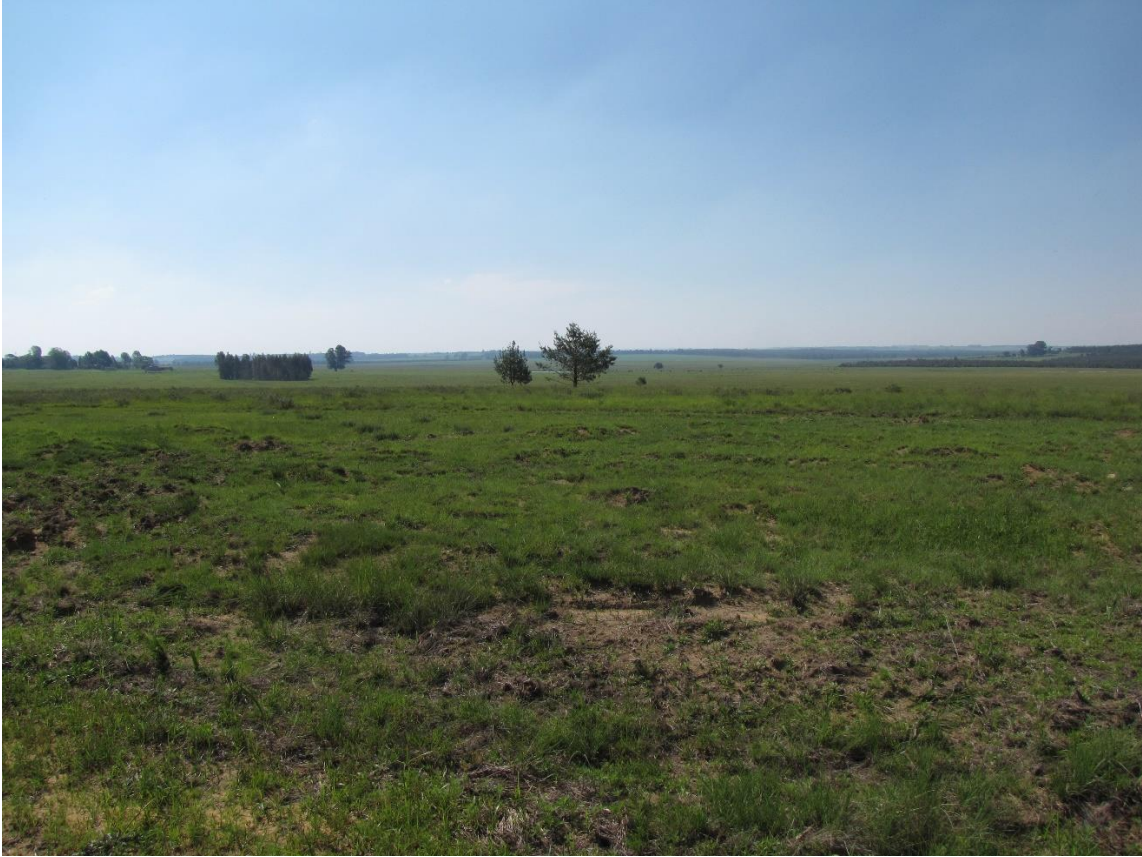
Figure 6: View of the study site (SE corner, facing NW): 26°23'48.1"S 30°25'14.3"E