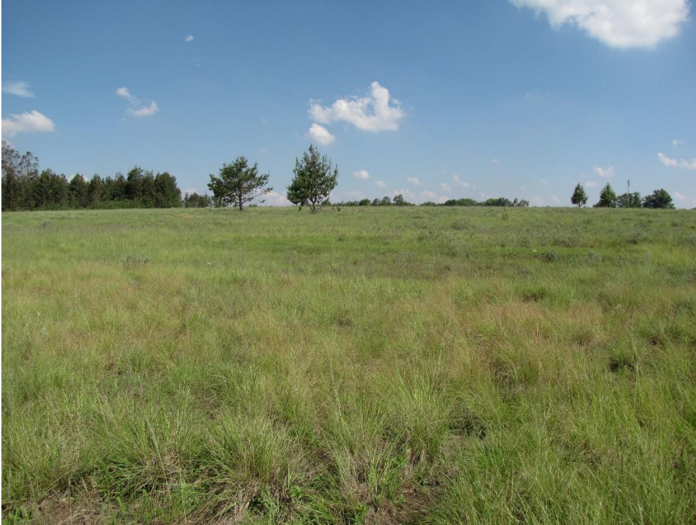
Figure 4: View of the study site (NW corner, facing SE): 26°23'44.7"S 30°25'08.6"E