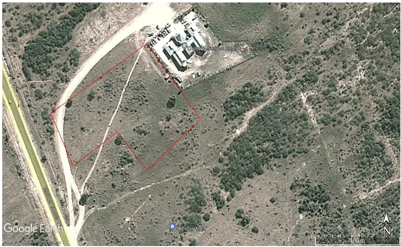
Figure 3: An aerial view of the area in 2012. By then the Thusong Service Centre already existed, but the natural vegetation had not been disturbed to a large degree as yet.

Aerial images (Google Earth) between 2012 and 2023 show the impacts of recent activities, as well as the existing Thusong Service Centre developments, on the study & development footprint area. This includes the clearance of vegetation and levelling of ground, as well as entrance roads to the Thusong Service Road from the main road passing by the area. From these it is clear that should any archaeological and/or historical sites, features or material have occurred here in the past, it would have been extensively disturbed or destroyed as a result of these activities. The chances of finding any intact or significant cultural heritage resources here is therefore highly unlikely.