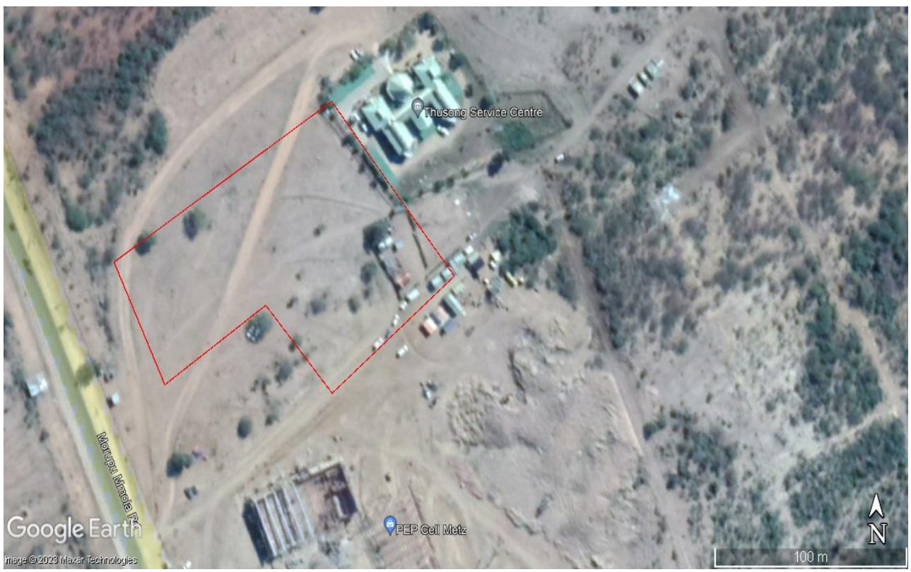
Figure 4: By 2018 the area's vegetation had largely been cleared, some ground levelling had occurred and the existing access roads to the Service Centre had increased in size as well. If any cultural heritage sites and features did exist here prior it would have been disturbed or destroyed to a large degree as a result (Google Earth 2023).

To conclude, based on the aerial images of the area, and the heritage desktop study, it is therefore deemed unlikely that any significant sites, features or material of cultural heritage (archaeological and/or historical) origin and/or significance will exist in the study & proposed Ga-Sekororo Police Station development area footprint. Recent development and other activities (mainly vegetation clearance and ground levelling) would have impacted on any if they did exist here in the past and would have disturbed or destroyed these to a large degree. Known archaeological and historical sites, features and material have been identified in the larger geographical area and this needs to be taken into consideration during actions related to the proposed development.