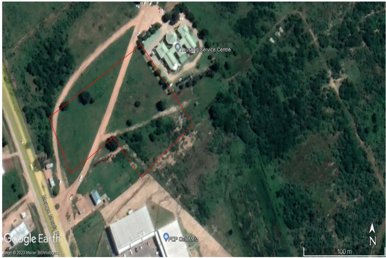
Figure 2: Closer view of the study & proposed development area footprint (Google Earth 2023).

The Stone Age is the period in human history when lithic (stone) material was mainly used to produce tools. In South Africa the Stone Age can be divided in basically into three periods. It is however important to note that dates are relative and only provide a broad framework for interpretation. A basic sequence for the South African Stone Age (Lombard et.al 2012) is as follows: