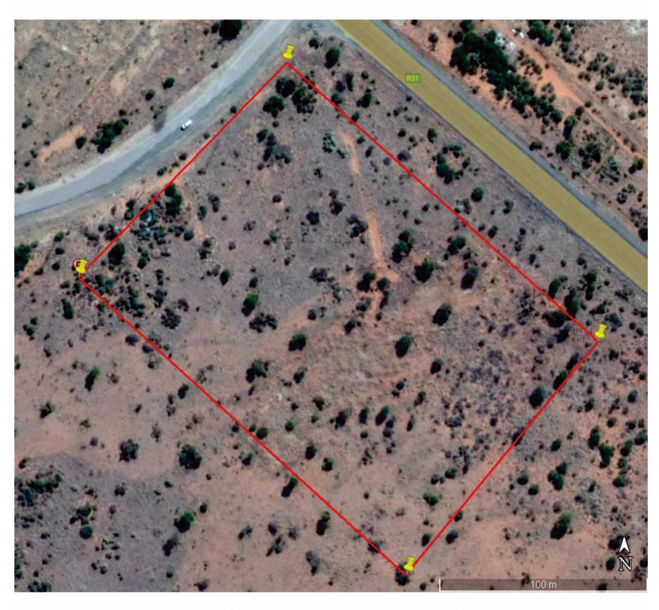
Figure 2. Aerial view and layout of the proposed study area.