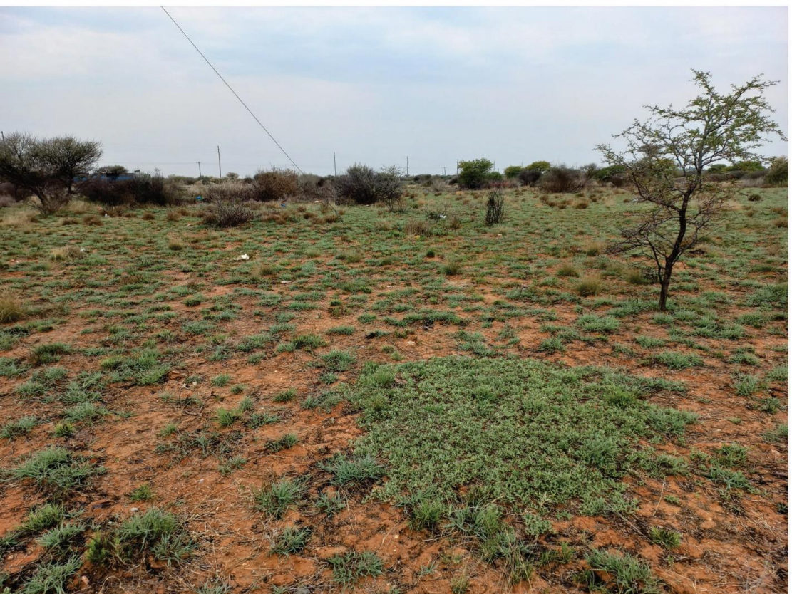
Figure 3. General view of the terrain, looking south (east) and northeast (below).