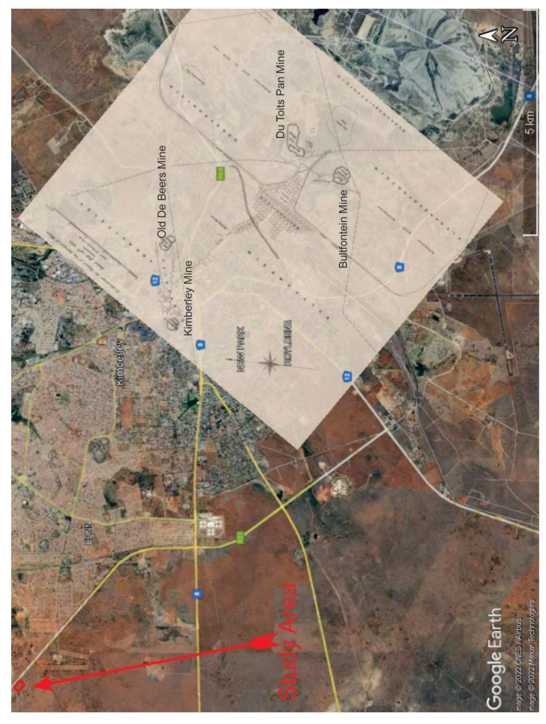
Figure 6. Overlay of Kimberley's historically significant mining areas as related to the Kimberley Diamond Rush of the 1870's (modified from General planof the diamond fieldsin Report of the Surveyor of Mines dated February 28th 1883.