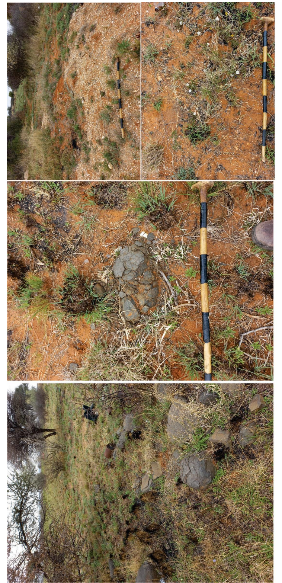
Figure 7. Dolerite outcrop (left & center) capped by geologically recent surface calcretes (top right) and aeolian sand (below right). Scale 1 = 10 cm.