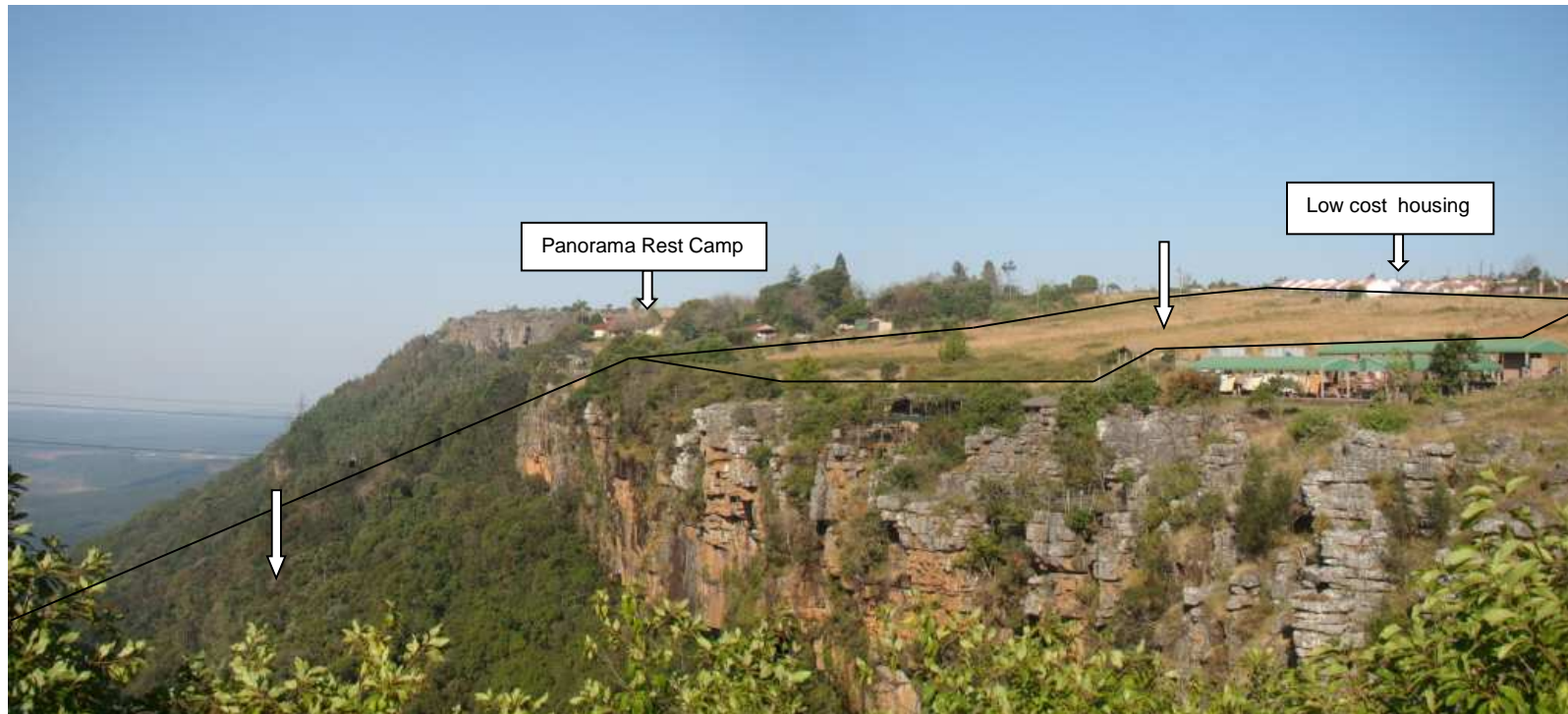
Fig. 1: Graskop Gorge Tourism Project study area – southern section. The arrows indicate the study area, which include the indigenous forest below the escarpment. This is the view towards the south, with the Panorama Rest Camp to the left, a low cost residential development (opposite the R533) to the right and the informal traders (green roofs) and Edge Bar in the foreground.