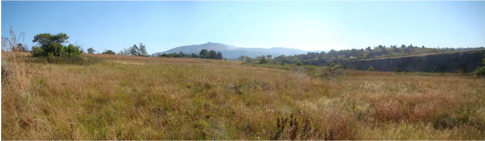
Fig. 4: View from south towards the west and north of the study area.