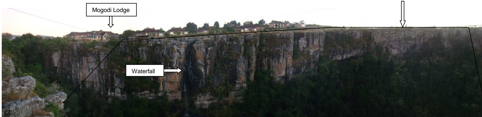
Fig. 3: The opposite side (northern side) of the Graskop Gorge Tourism Project (view towards the north). Mogodi Lodge as well as the Panorama or Graskop waterfall is visible. The Big Swing is situated at the top of the waterfall. The study area is to the right of Mogodi Lodge and indicated by the arrow and black line. It includes the indigenous forest below.