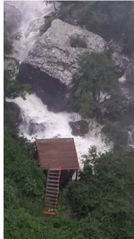
Fig. 7: The Big Swing Landing Pad in the gorge below.

Both these photos show that the valley floor is flooded by the amount of water, at certain times of the year.