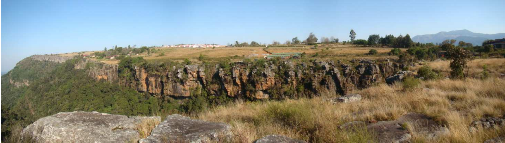
Fig. 2: A wider view of the southern section (Fig. 1), with the extent of the gorge clearly visible.