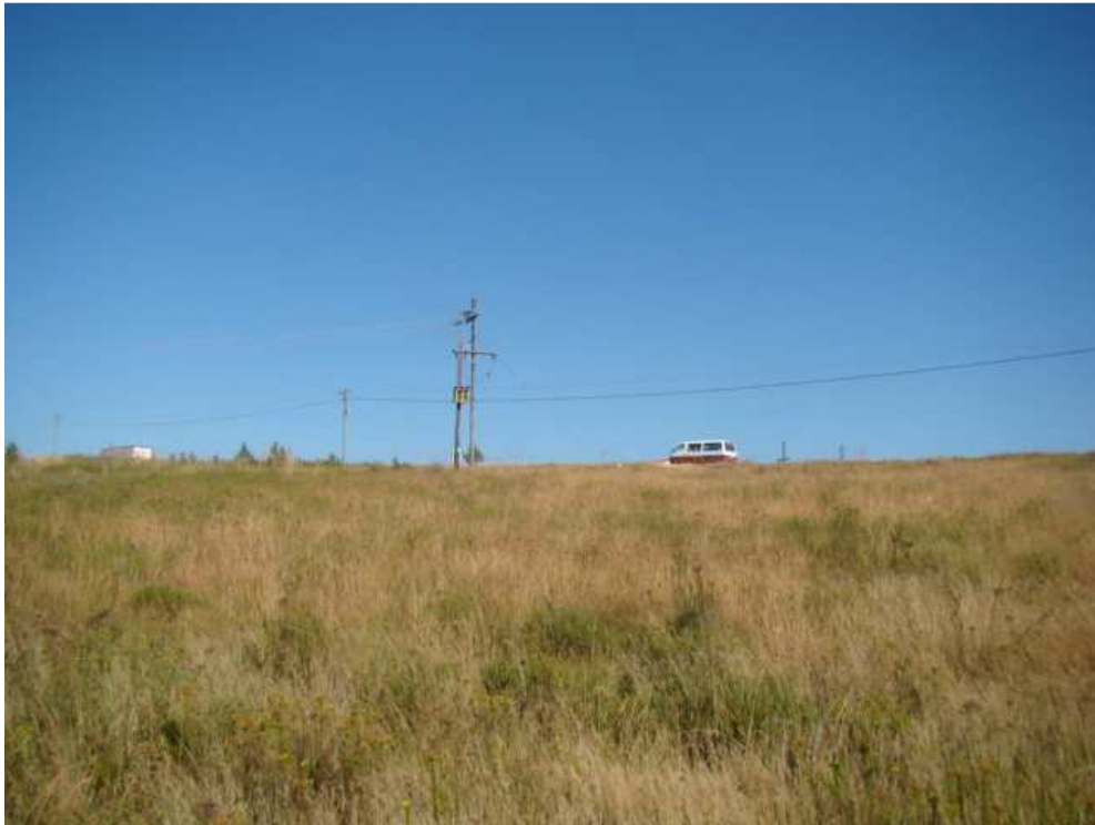
Fig. 12: View towards the R533 from the centre of the southern section.