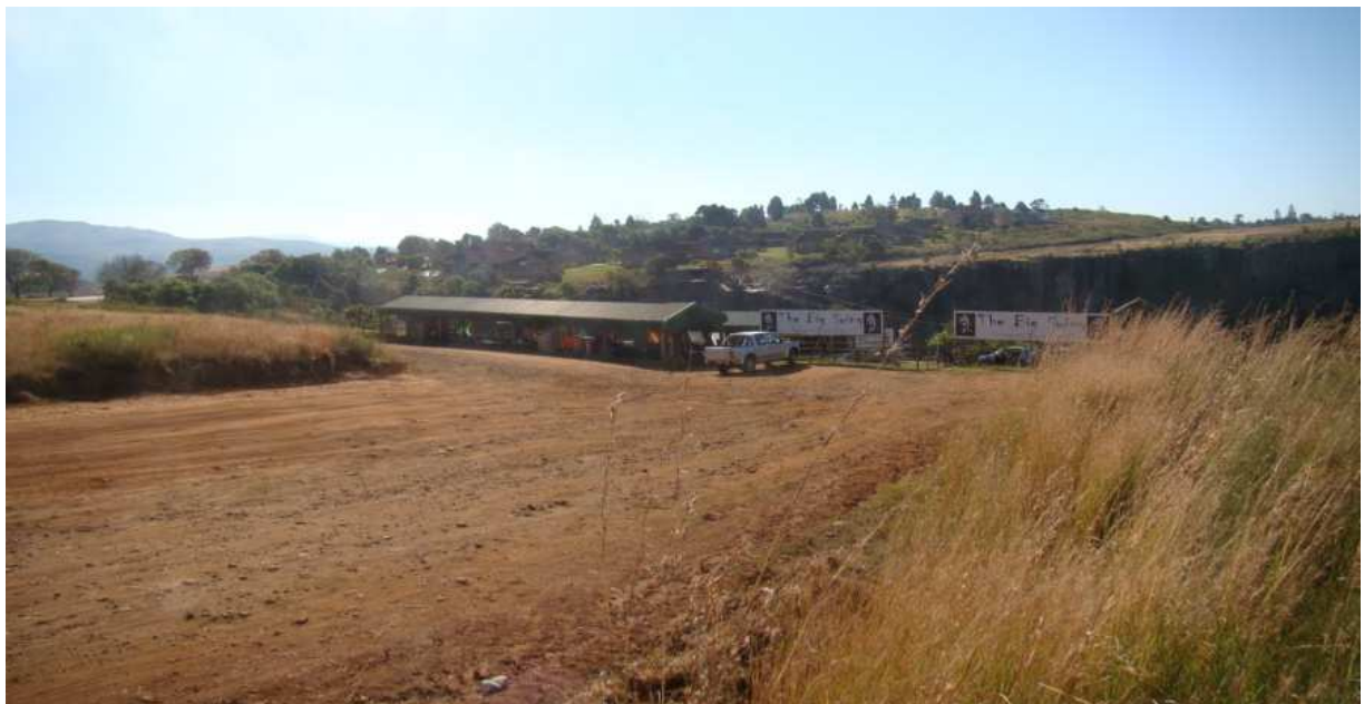
Fig. 13: The centre of the southern section is disturbed by access roads from the R533, to the informal trading area and the Edge Bar.