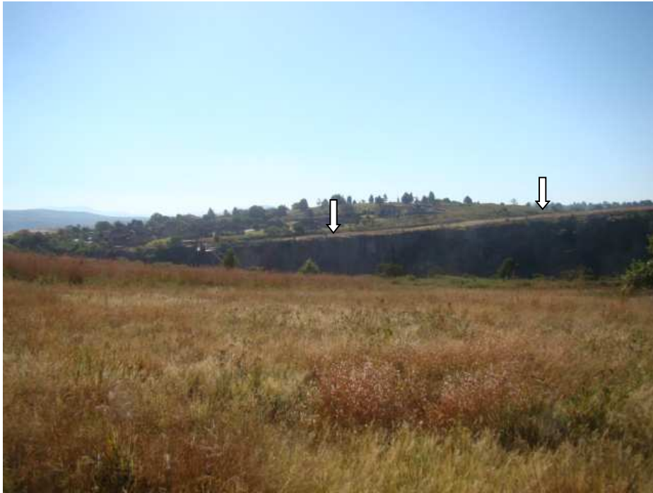
Fig. 14: The thin strip on the opposite side of the gorge, indicated by the arrows, forms the northern section of the study area (See Appendix 5).