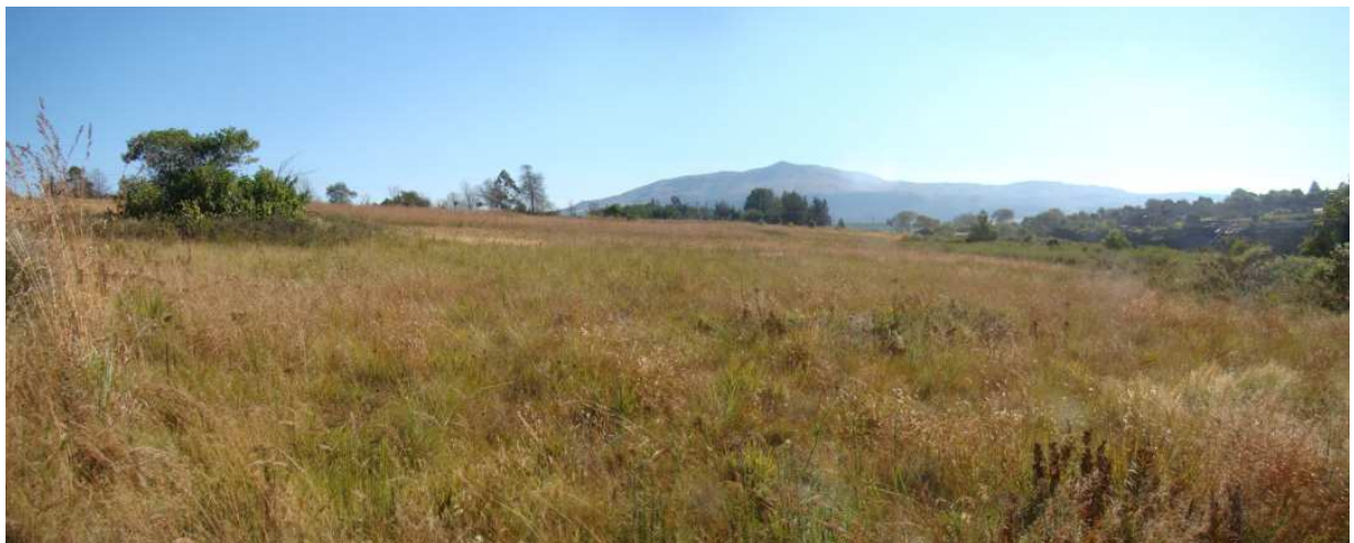
Fig. 11: View of the western (left) and northern (opposite of the gorge on right) sections of the study area.