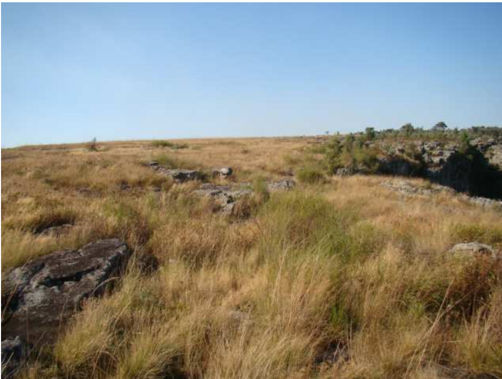
Fig. 17: The northern section of the study area is a thin strip along the escarpment.