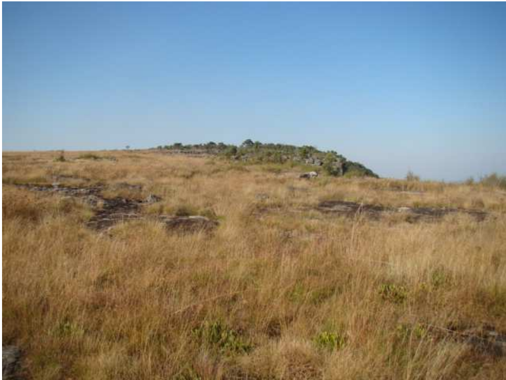
Fig. 16: The northern section consists of natural grassland.