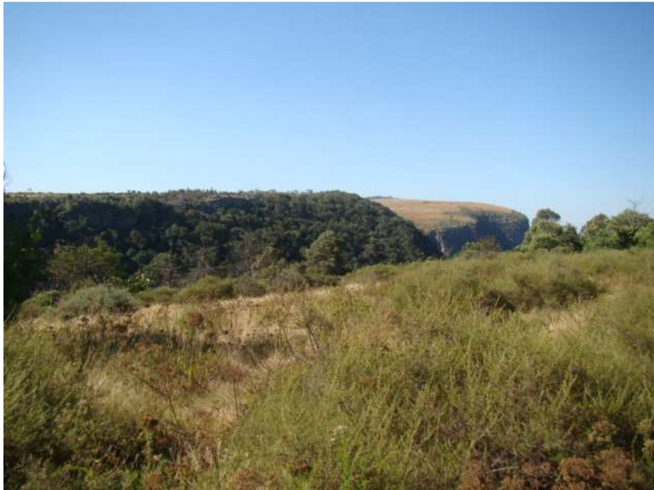
Fig. 10: The edge of the escarpment is covered with fynbos in the foreground.