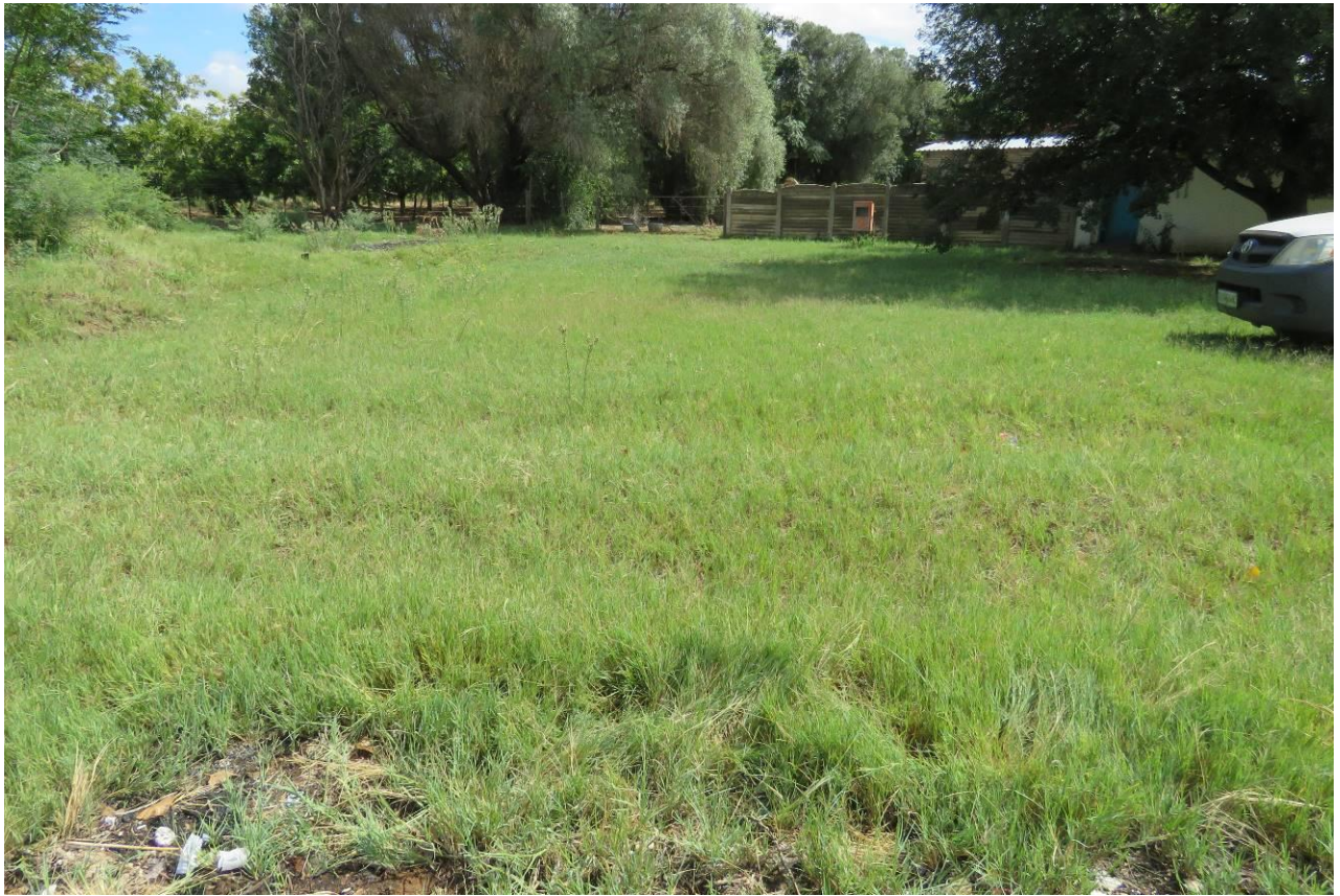
Figures 10&11: Zone C South. Less disturbed portions of the property.