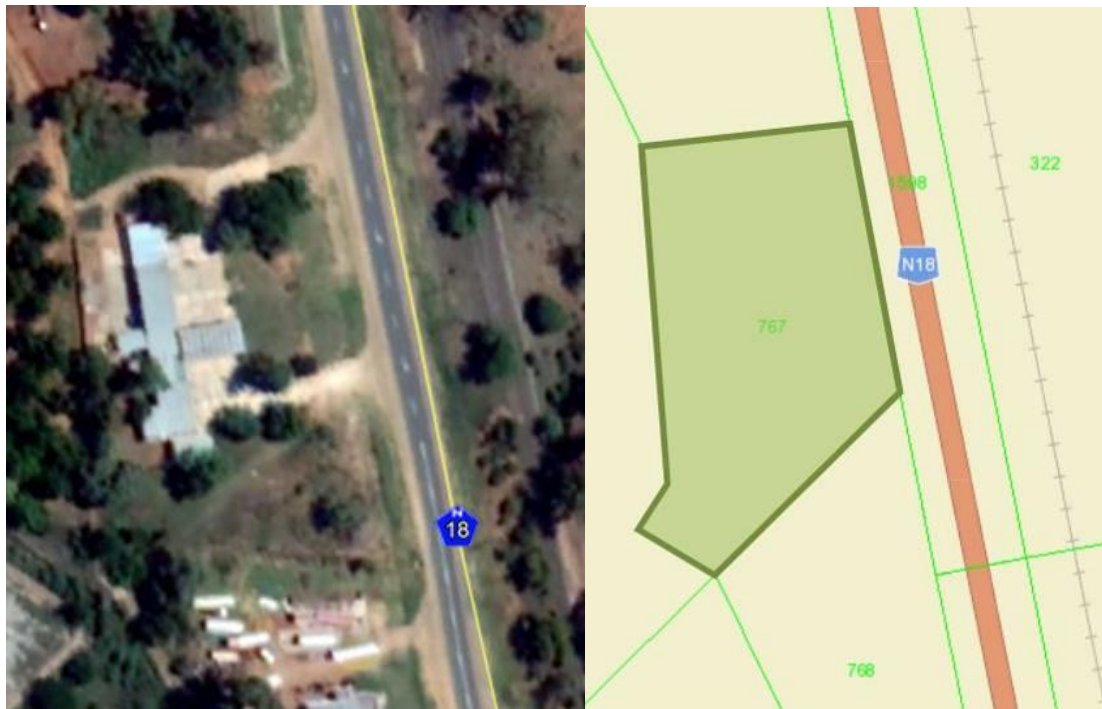
Figure 2: Google Earth image and plan of the Gateway Fuel Station development site (Erf 767)