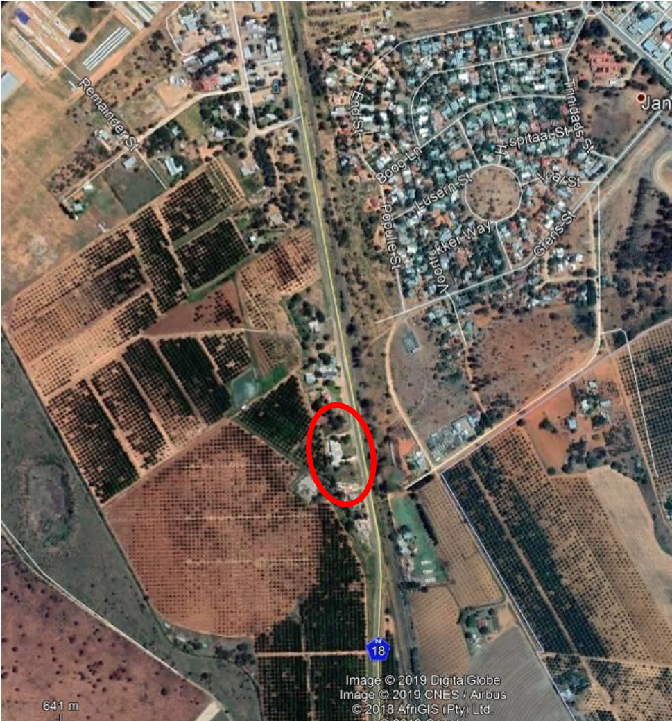
Figure 1: Position of proposed Gateway Fuel Station, Erf 767, relative to Jan Kempdorp.

The immediate environment is far from pristine, however, being much modified within the extent of the Vaal-Harts Irrigation Scheme and as an abandoned fuel station. The present surface, where not obscured by buildings and cement aprons, may itself be a recent artificial/landscaped surface.