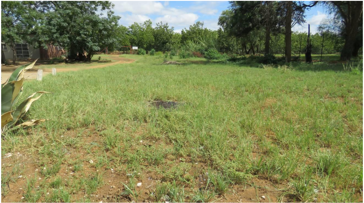
Figures 12&13: Zone C North. Less disturbed portions of the property. Both C North and C South have later twentieth century rubbish.