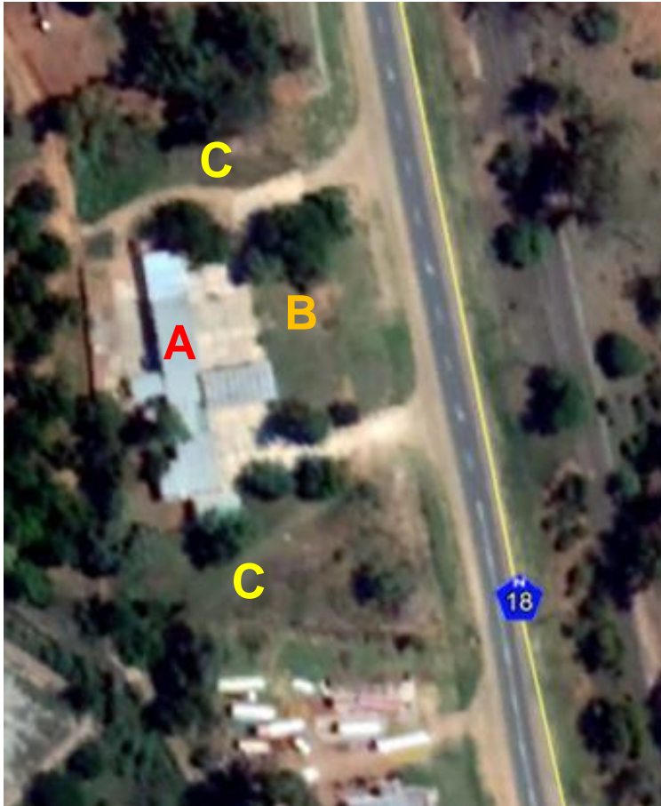
Figure 3: Zones as characterised in this report.