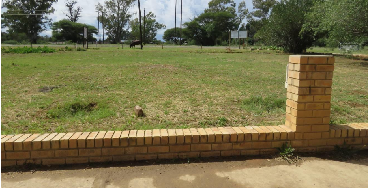
Figures 8&9: Zone B. Modified landscape between fuel station and N18 national road.