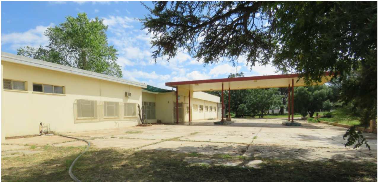
Figures 4&5: Zone A. Existing garage forecourt.

Zone C is potentially the only one having any remaining integrity of interest from an archaeological perspective. Particular attention was focussed on these areas north and south of the built infrastructure. It appears that both areas have also been previously disturbed, especially the southern part which has a trench dug through it. The trench was of interest in that it afforded an opportunity to note evidence of possible sub-surface middens and child burials such as those noted at Rooiwal near Taung (Morris & Seliane 2008). No such evidence was found, however, later twentieth century rubbish was recorded.