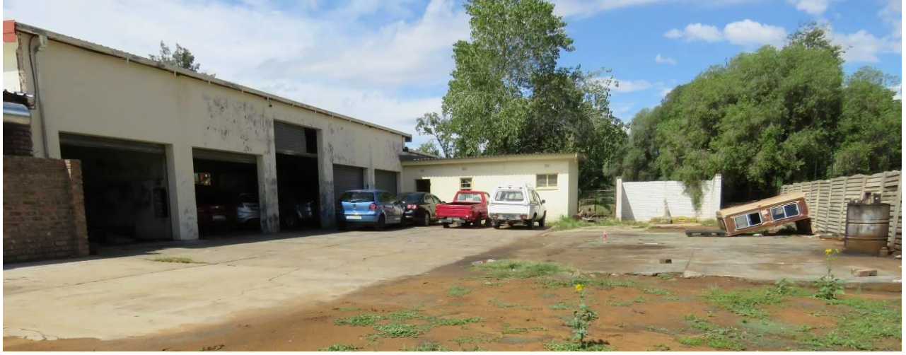
Figures 6&7: Zone A. Back of building – workshops, recreation feature.