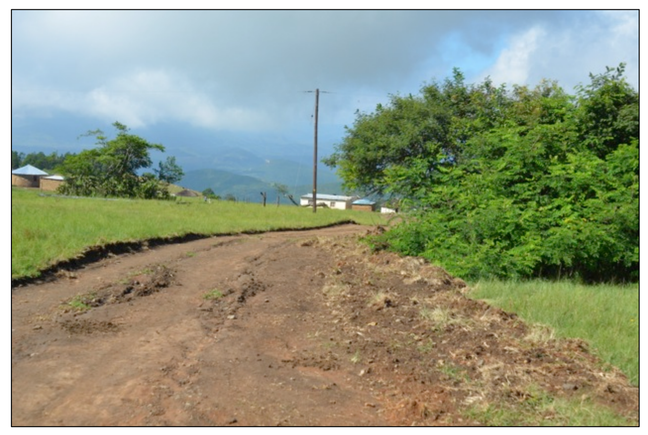
Figure 9. Start of road upgrade