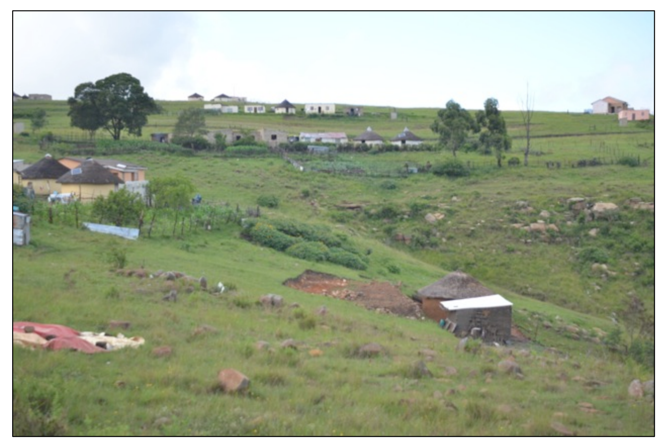
Figure 8. Possible grave sites