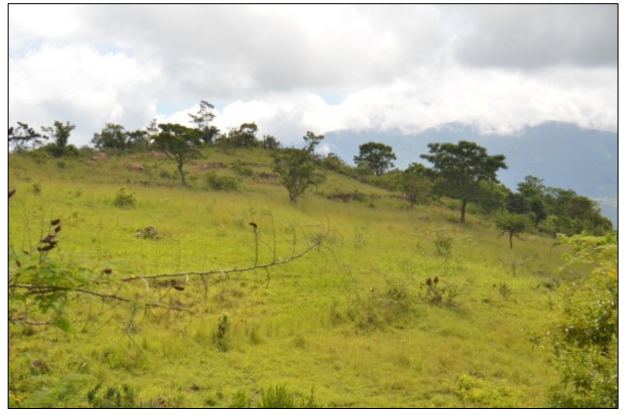
Figure 13. Stone walling along hillside next to road