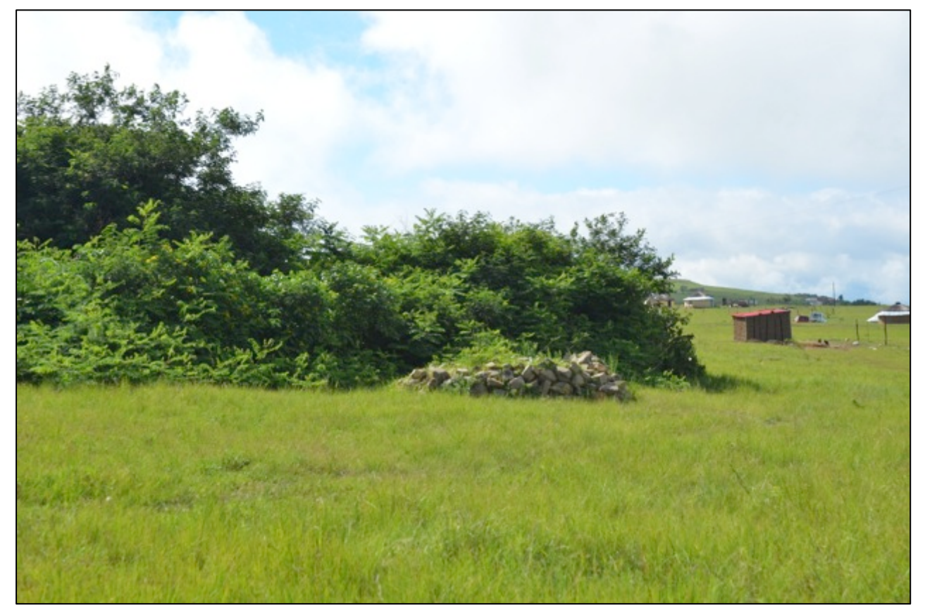
Figure 10. Graves along road upgrade