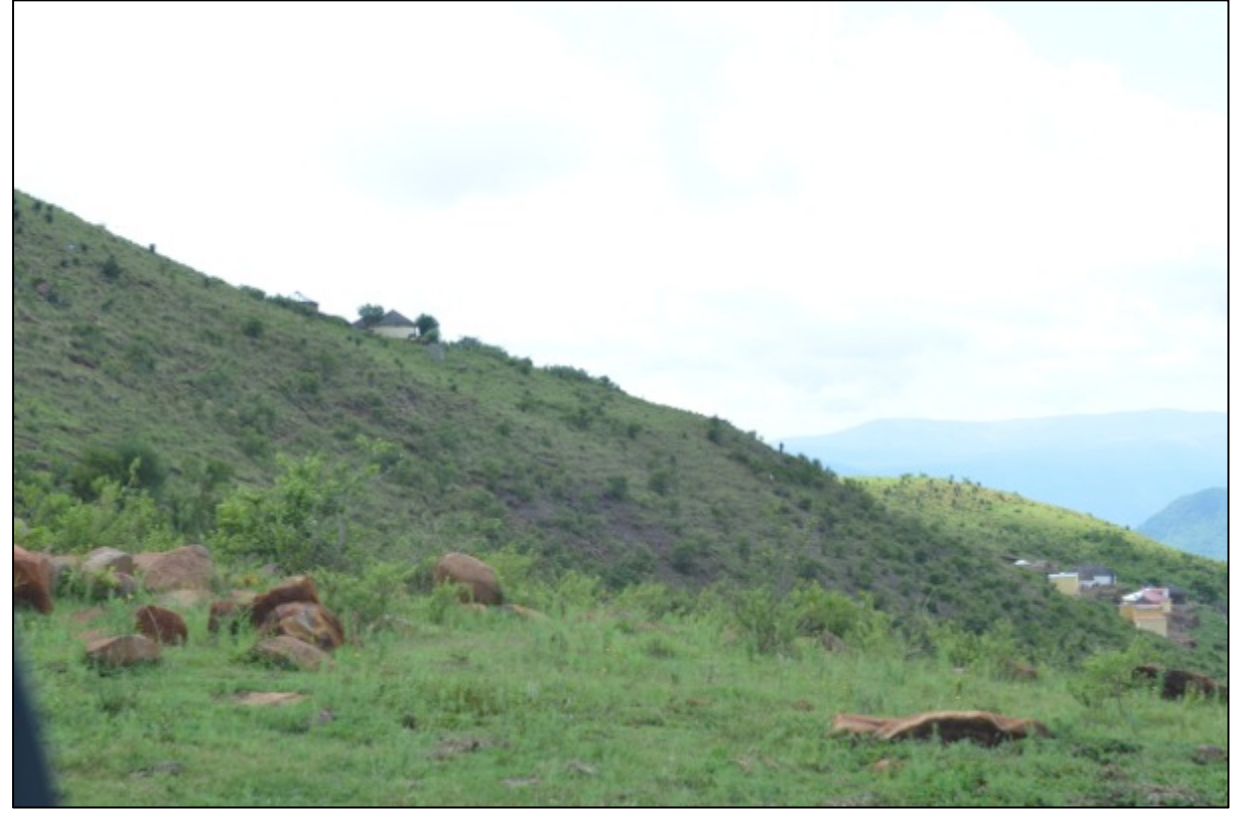
Figure 14. En dof road upgrade