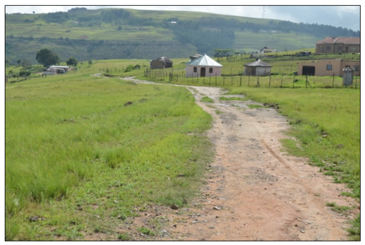
Figure 6. Start of road upgrade