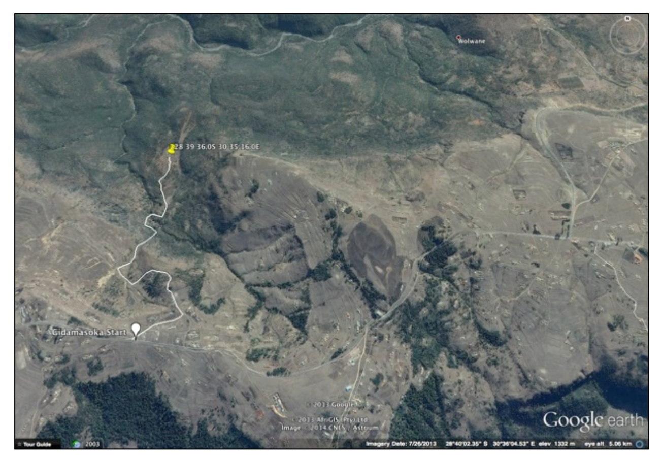
Figure 2. Aerial view of proposed upgrade of Gidamasoka North Road