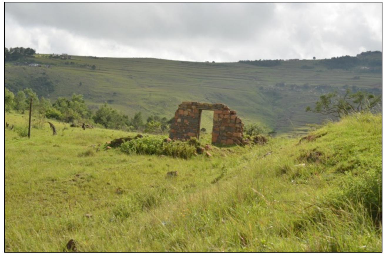
Figure 7. Stone walled ruins