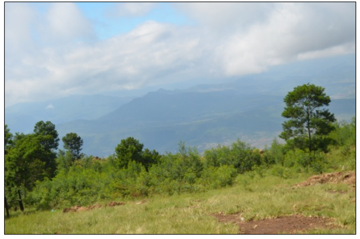
Figure 12. End of road upgrade