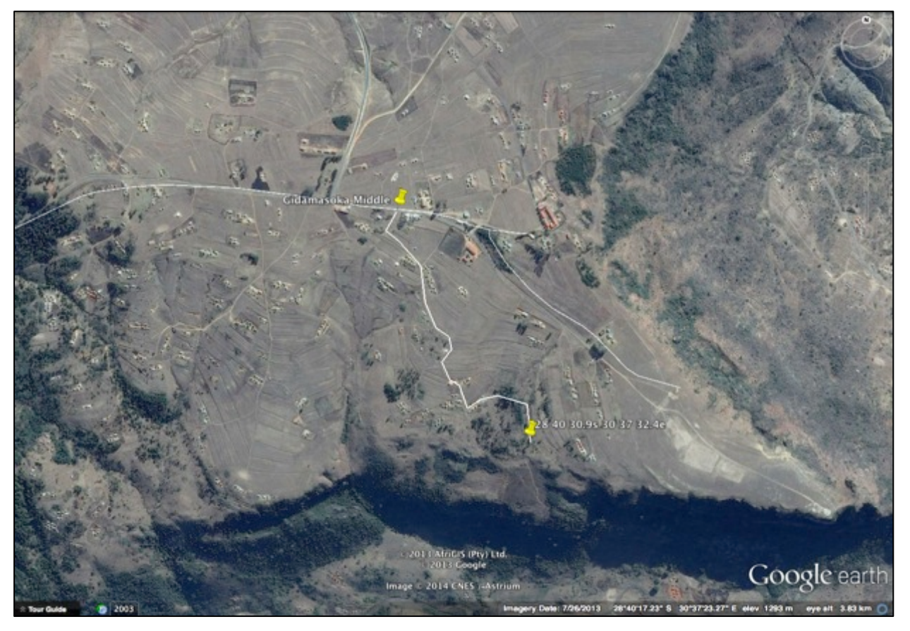
Figure 3. Aerial view of proposed upgrade of Gidamasoka Middle Road