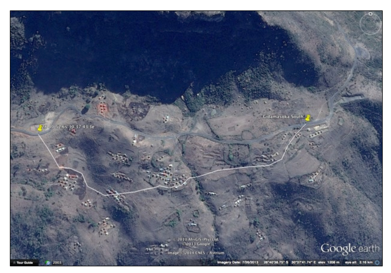
Figure 4. Aerial view of proposed upgrade of Gidamasoka South Road