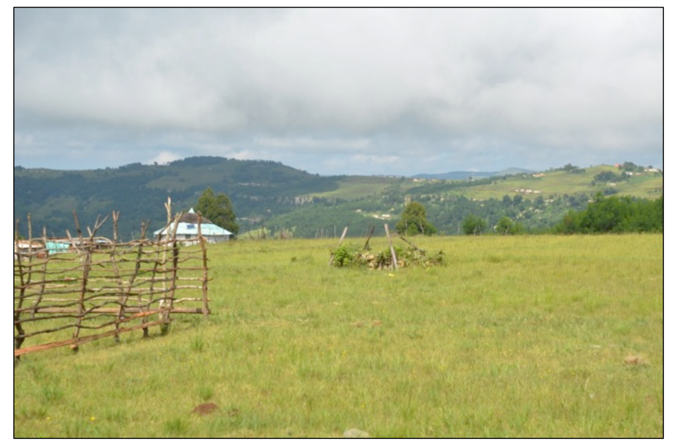
Figure 11. Grave along road upgrade