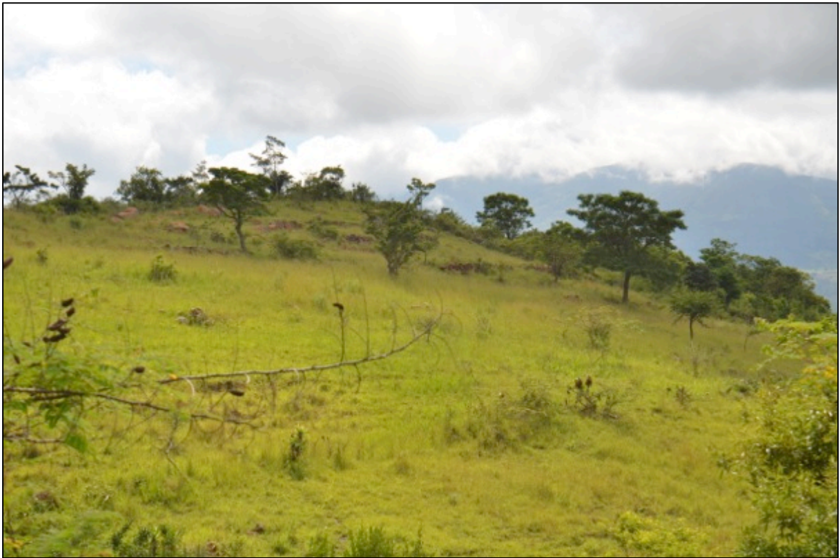
Figure 13. Stone walling along hillside next to road