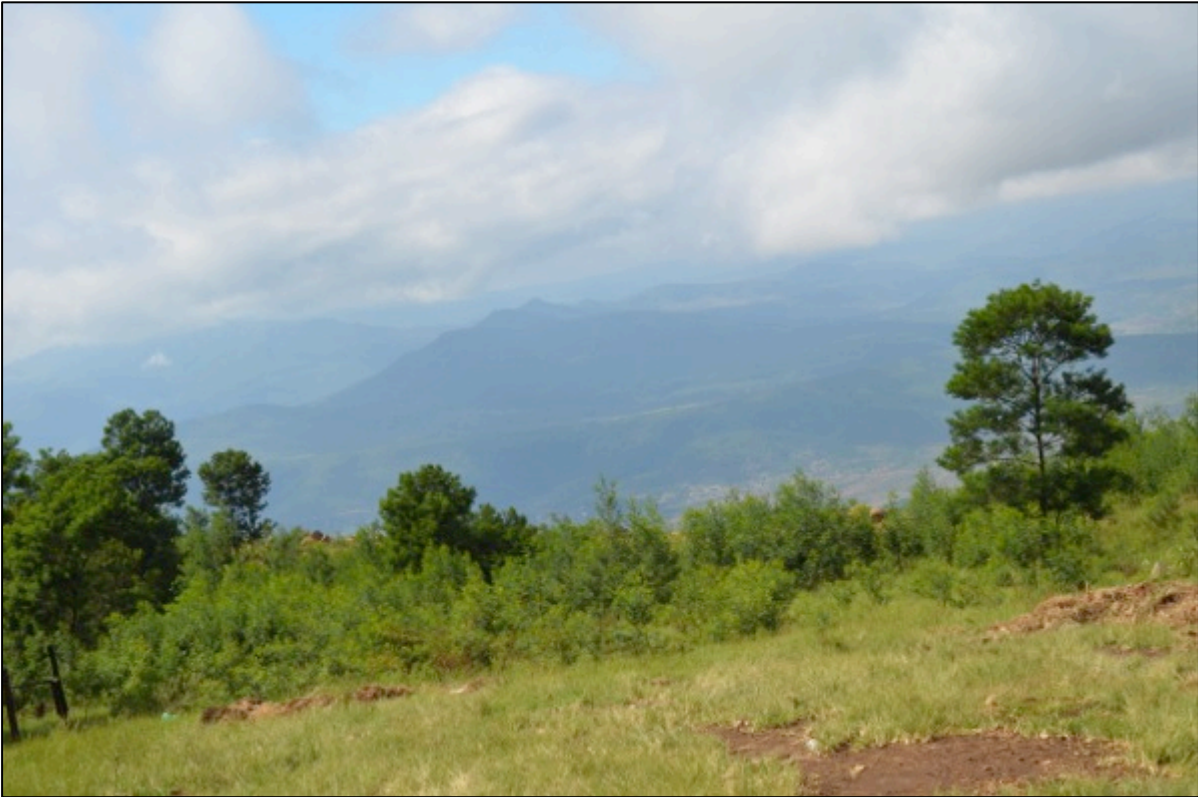
Figure 12. End of road upgrade