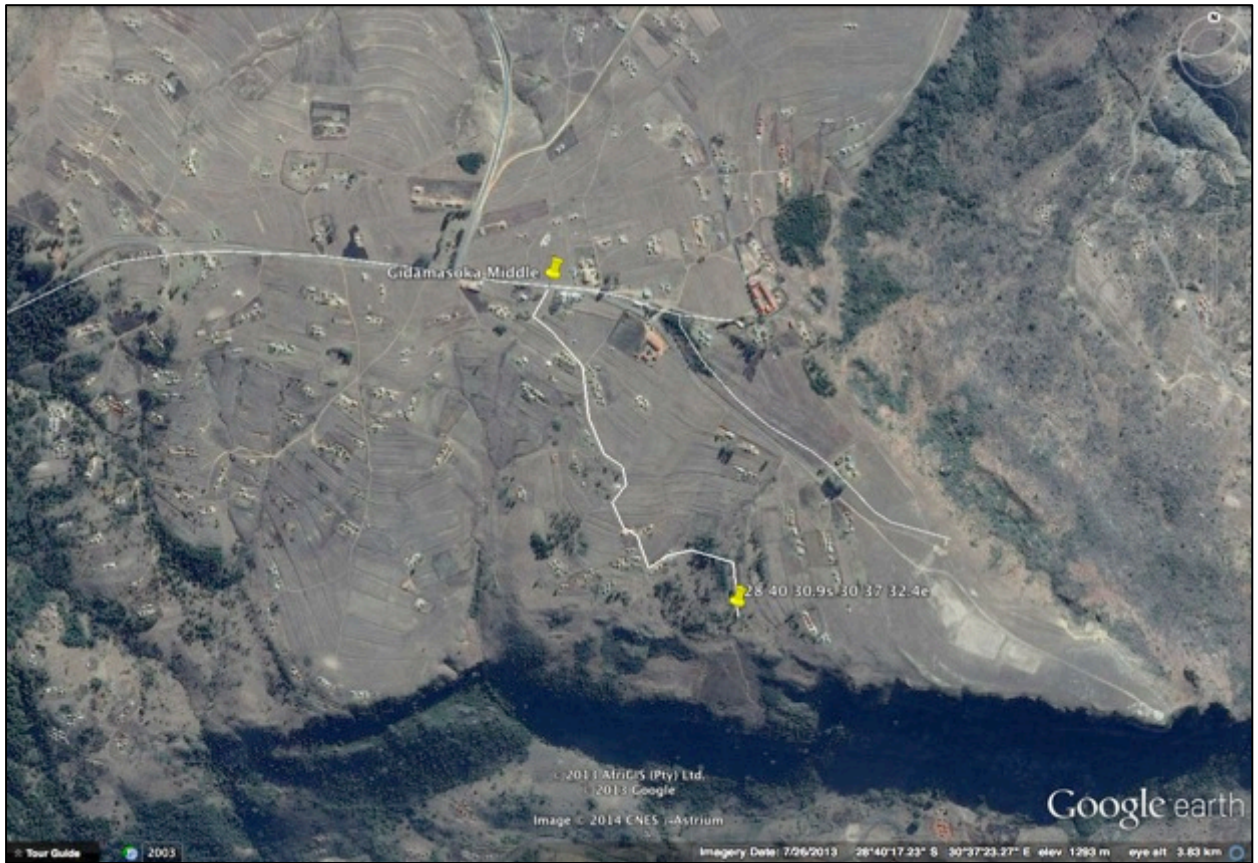
Figure 3. Aerial view of proposed upgrade of Gidamasoka Middle Road