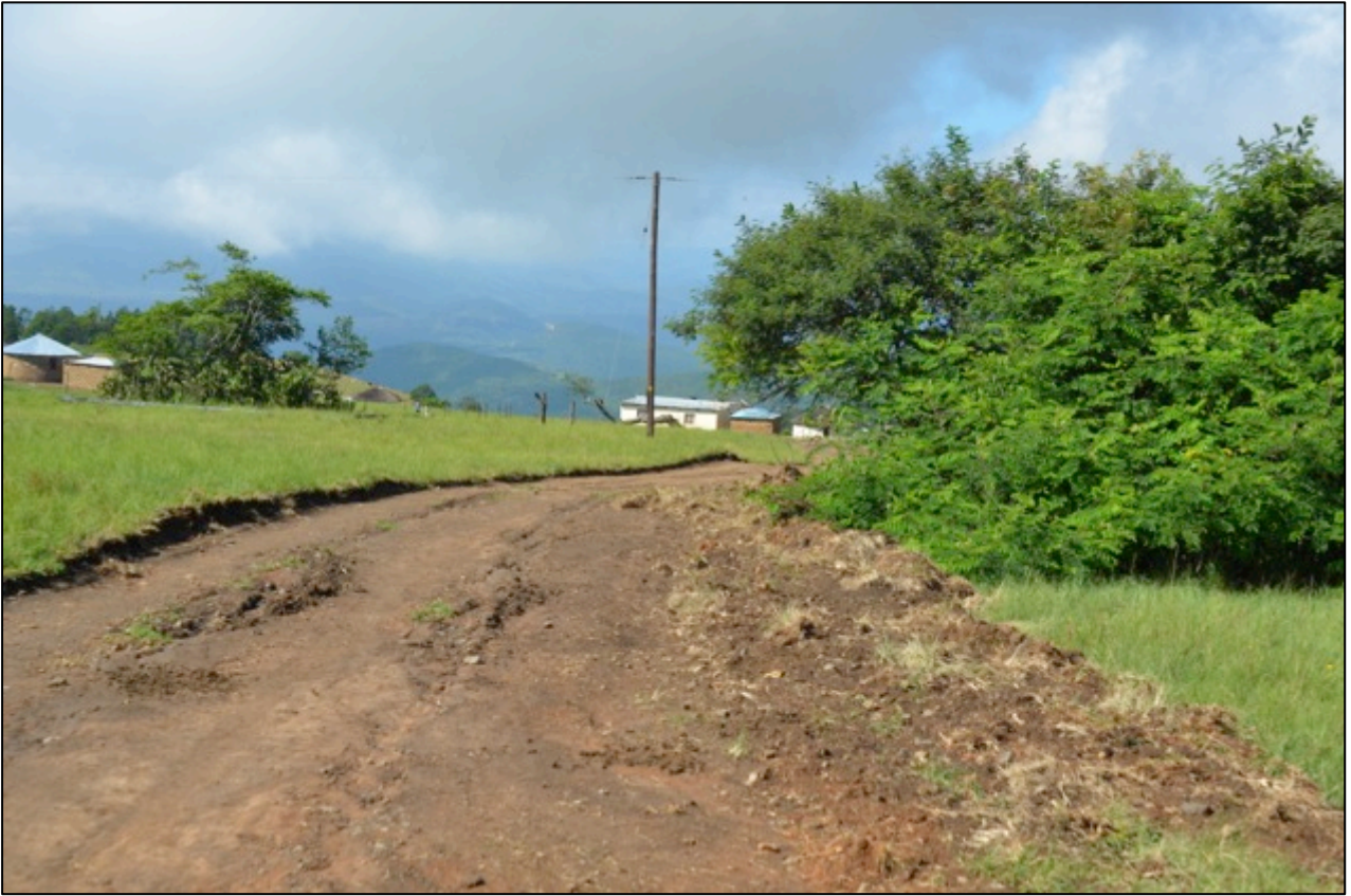
Figure 9. Start of road upgrade