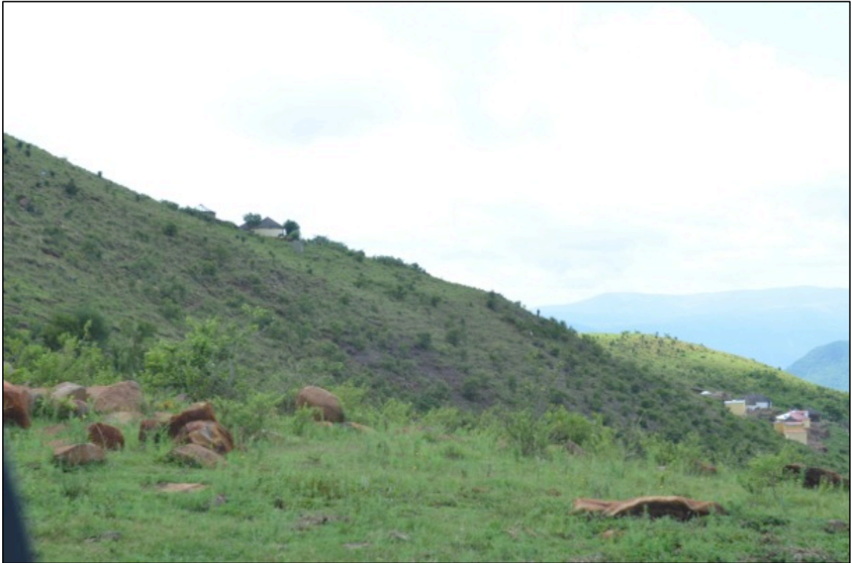
Figure 14. En dof road upgrade