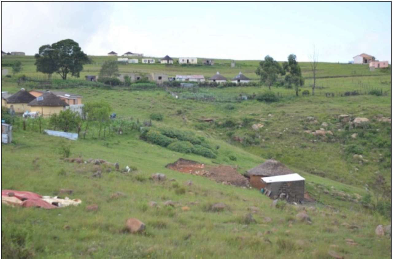
Figure 8. Possible grave sites