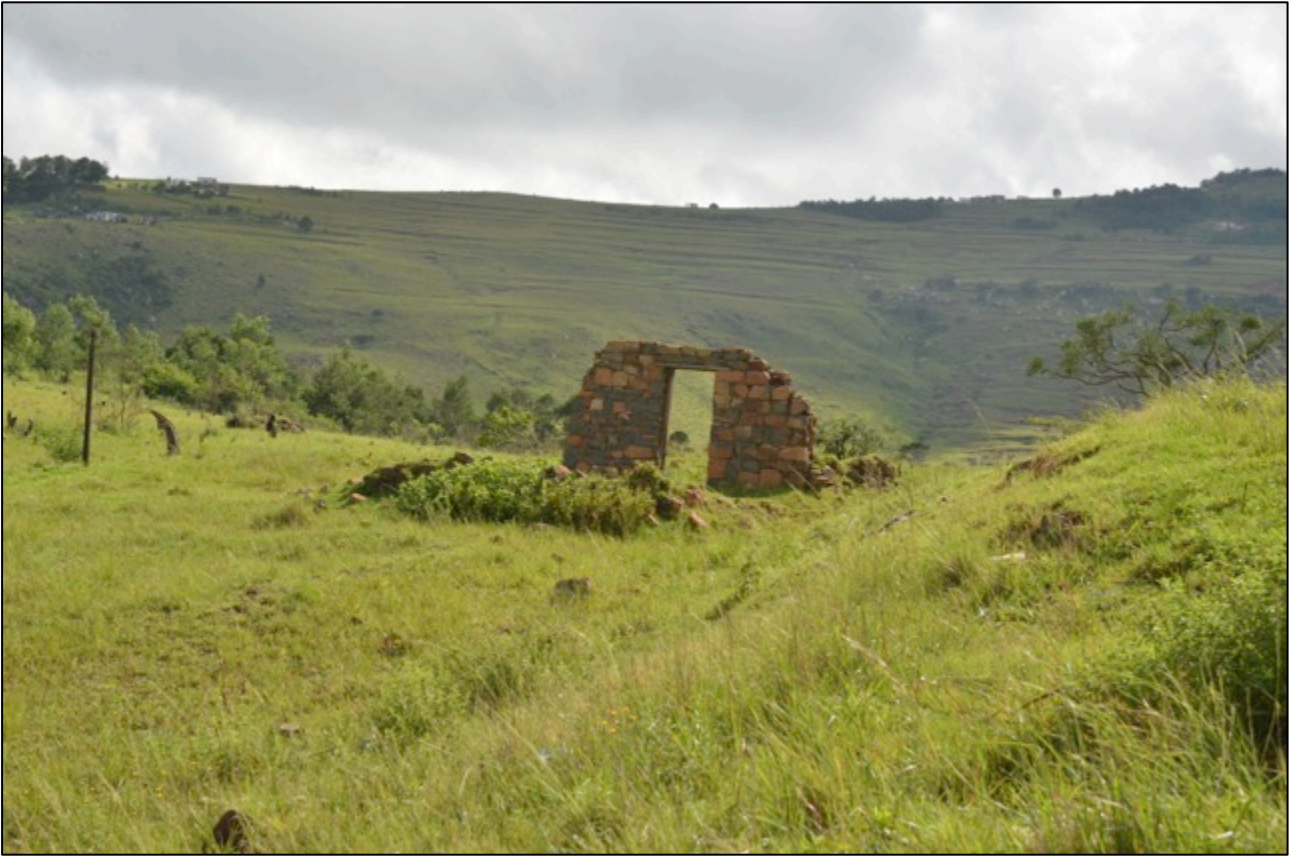
Figure 7. Stone walled ruins