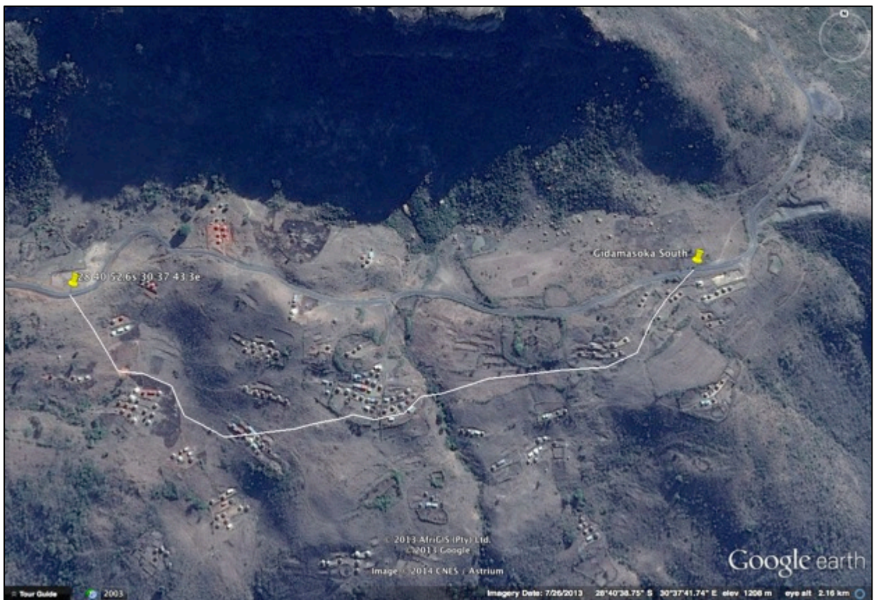
Figure 4. Aerial view of proposed upgrade of Gidamasoka South Road