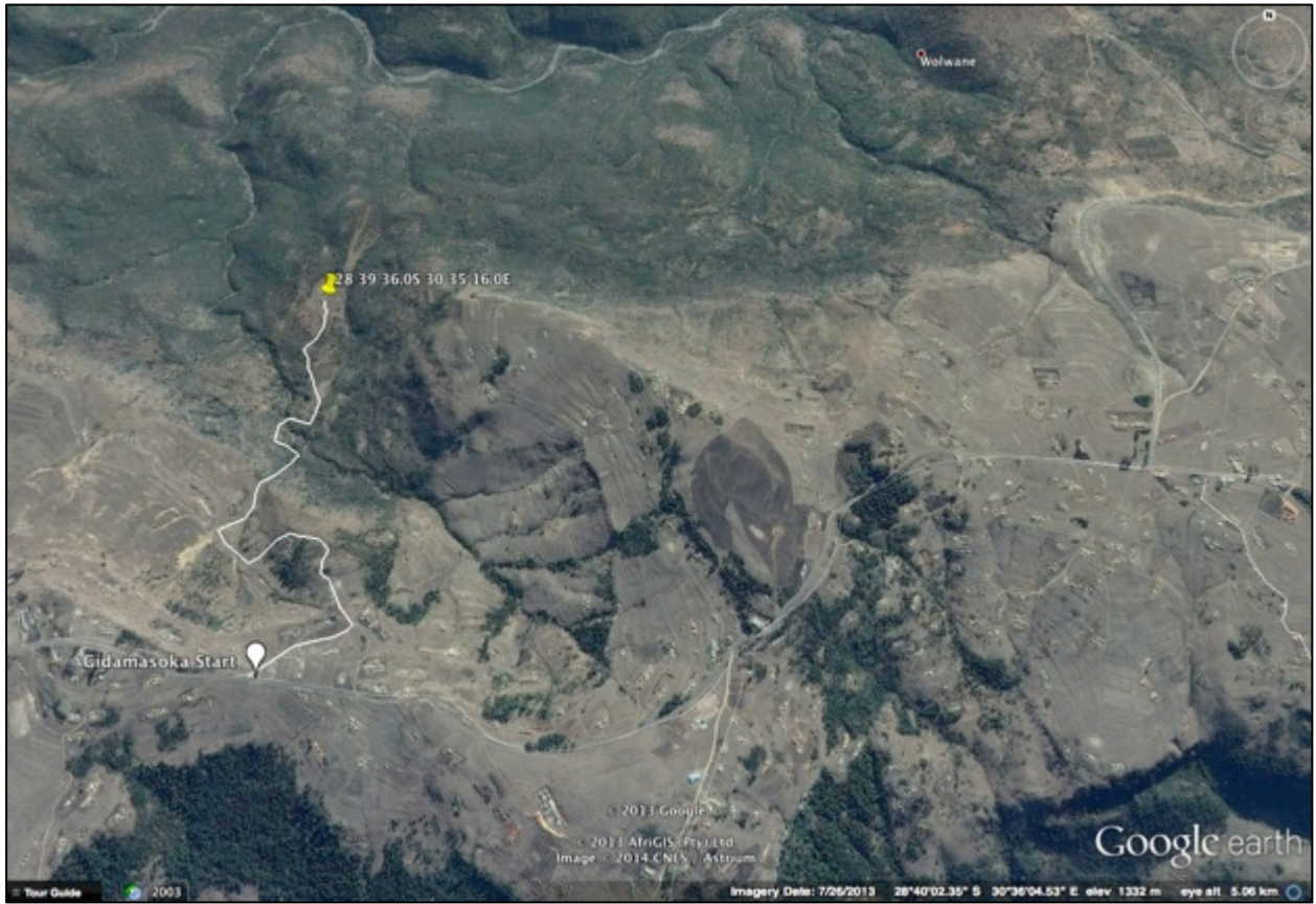
Figure 2. Aerial view of proposed upgrade of Gidamasoka North Road