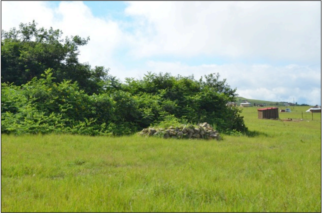
Figure 10. Graves along road upgrade