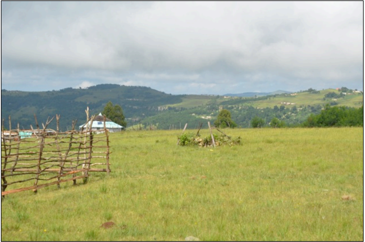
Figure 11. Grave along road upgrade