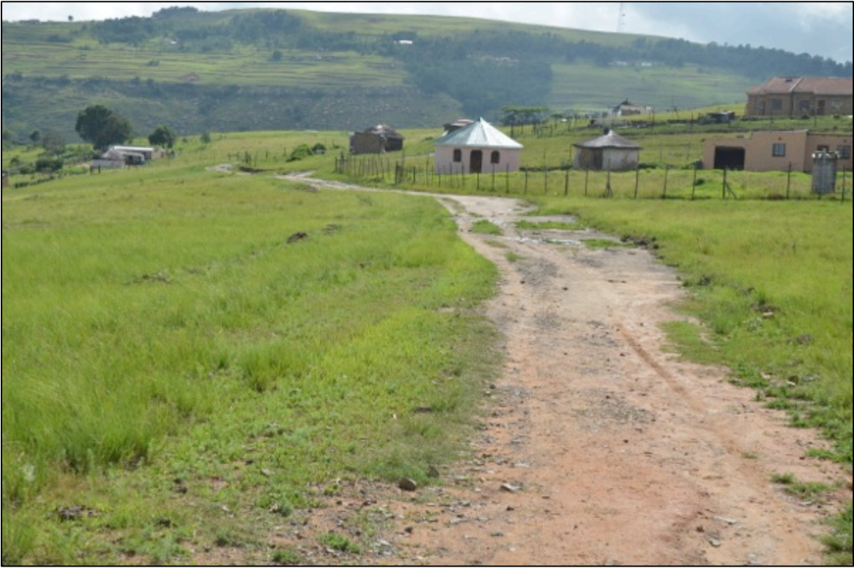
Figure 6. Start of road upgrade