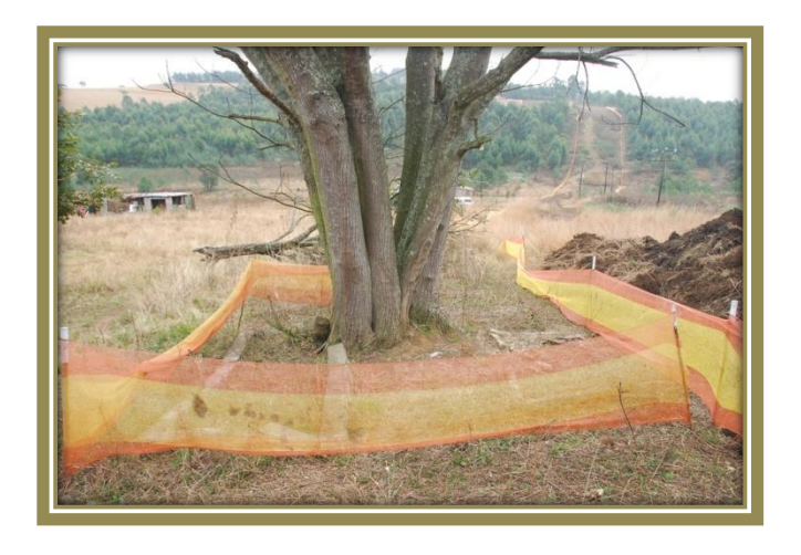
FIGURE 2 GRAVE SITE LOCATION AT 29° 44.639'S 30° 22.935'E