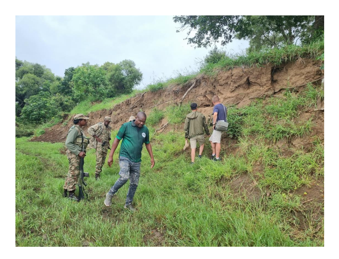
Figure 1: The geographical context of a grave, along a riverbank at the Kruger National Park.