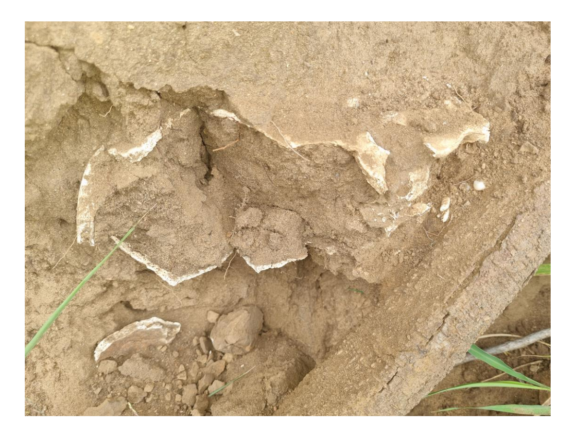
Figure 2: A compressed human skull – probably because of compacted soil above it.