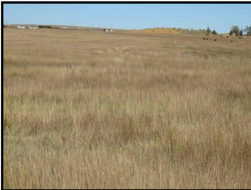
Figure 4. Photograph showing the northern section of the footprint including powerline corridor 2.