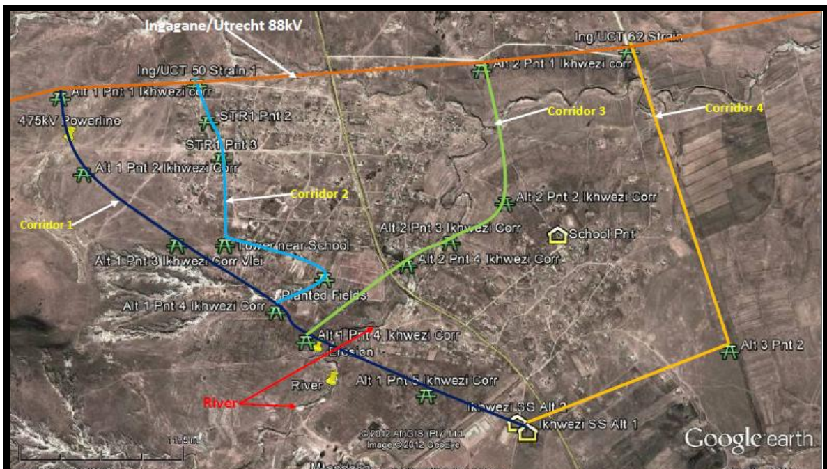
Figure 2. Google aerial photograph showing the location of the powerline corridors and substations within the study area