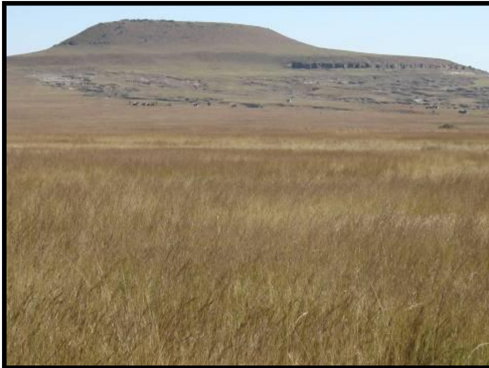
Figure 3. Photograph taken from the southern section of the footprint including powerline corridors 1 & 2