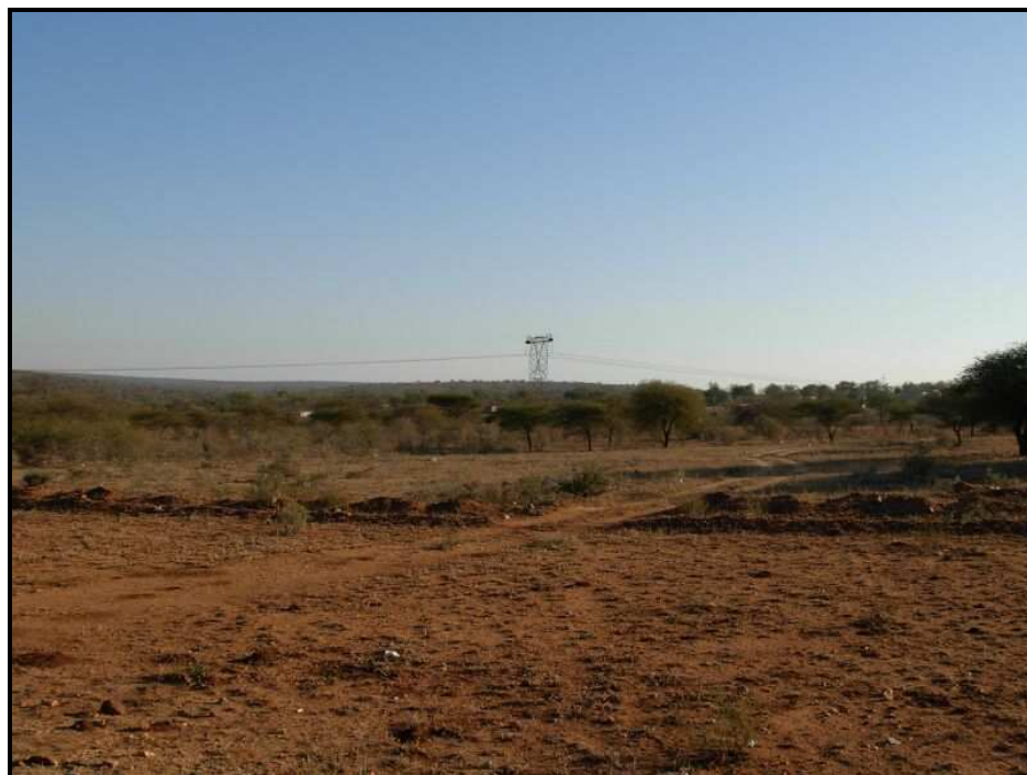
Figure 2: Borrow Pit 1 Locality

During the survey no heritage sites were identified in close proximity of the proposed road alignment.