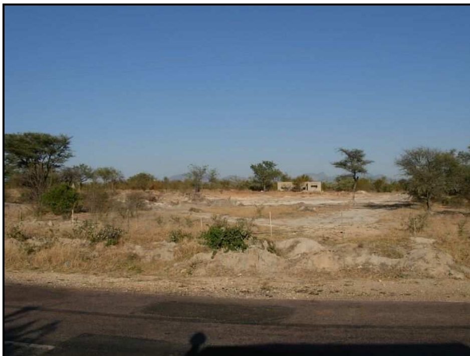
Figure 3: Borrow Pit 2 Locality