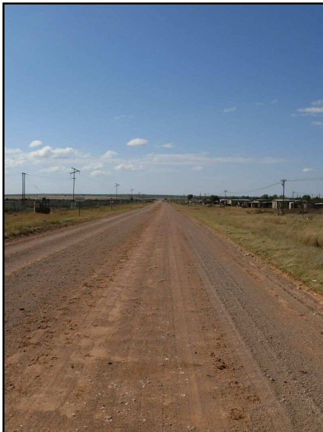
Figure 2: Start of road construction position at Amalia

During the survey no heritage sites were identified in close proximity of the proposed road alignment or borrow pit positions.