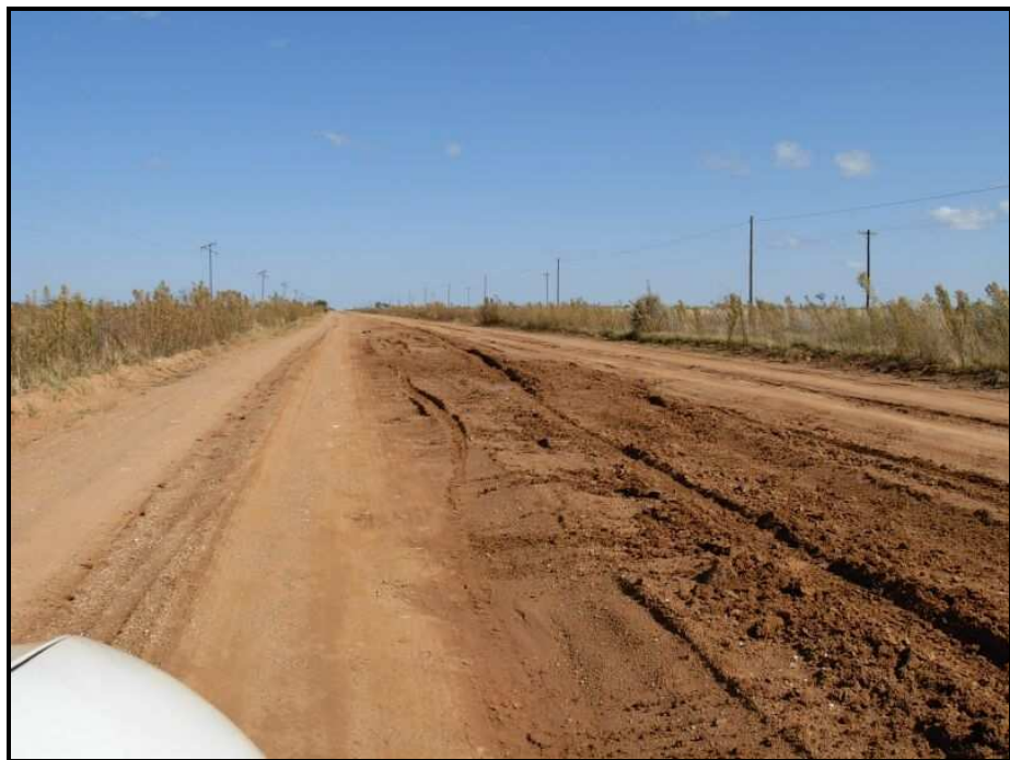
Figure 4: General Road conditions