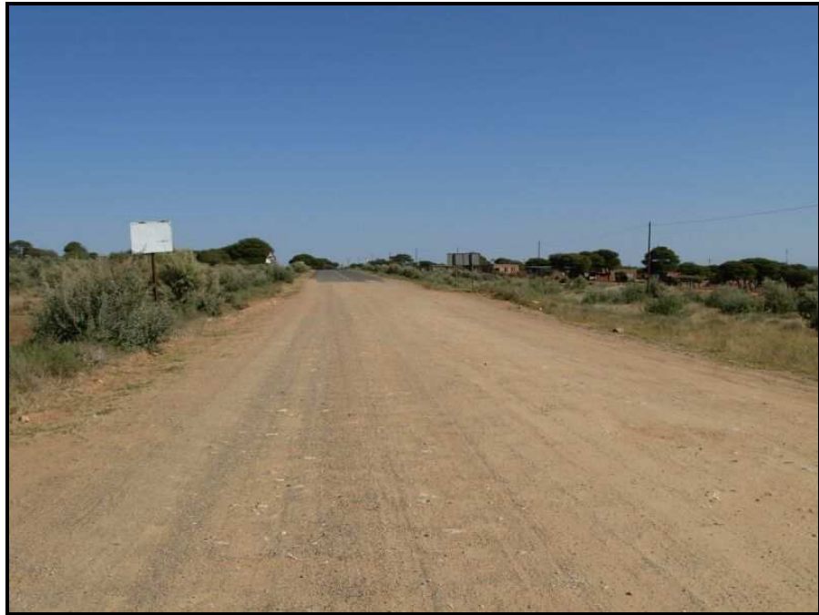
Figure 3: End of road construction position at Myra