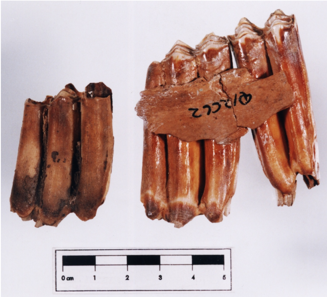
Figure 2. Side view (buccal view) of bovid lower dentition removed from jaw bone.