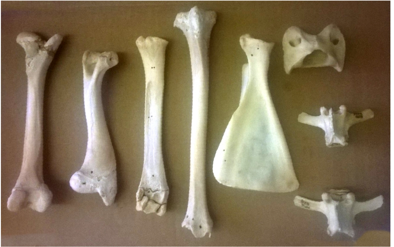
Figure 3. Example of post-cranial bovid skeletal elements including from left to right: femur, humerus, radius, tibia, scapula and vertebrae (x 3).