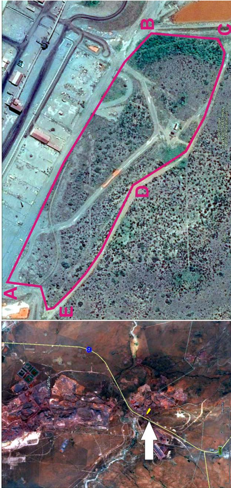
Figure 2 Aerial view and layout of the study area.