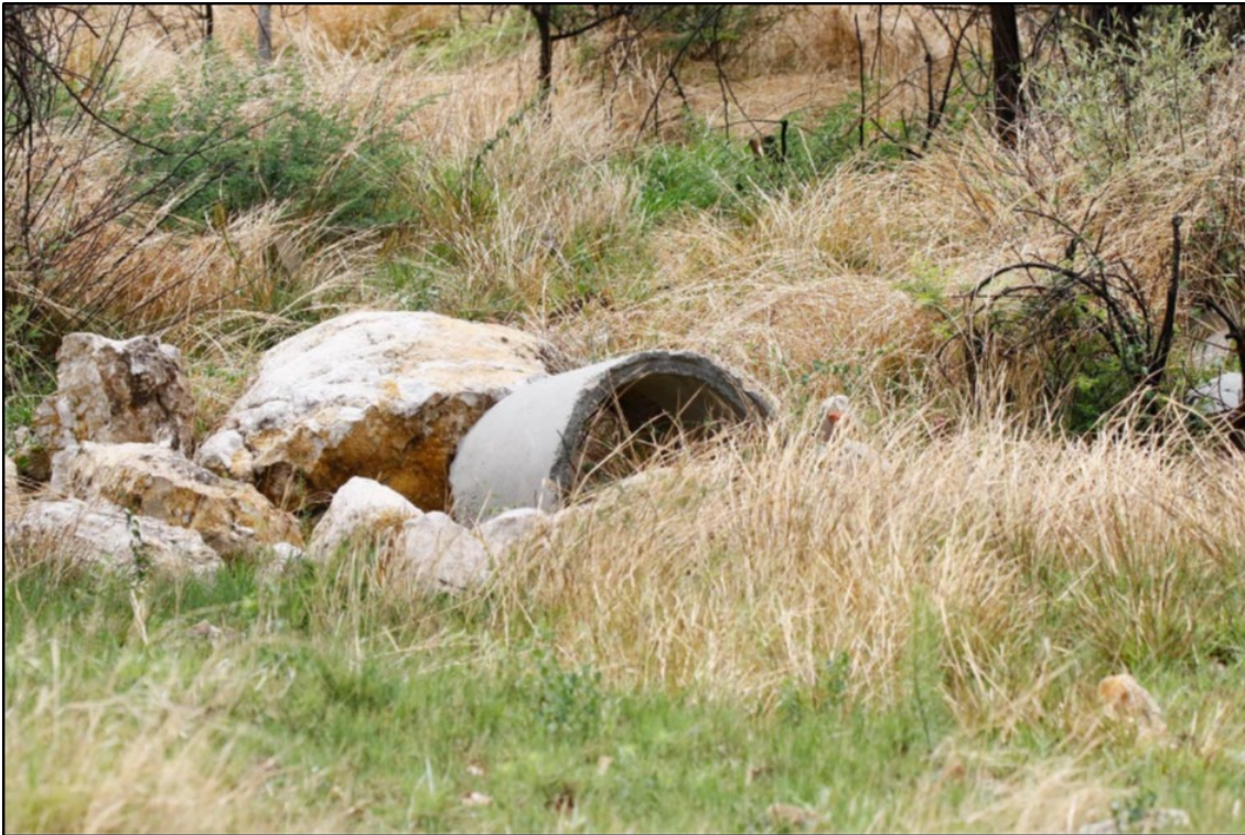
Photograph 5: Site characteristics