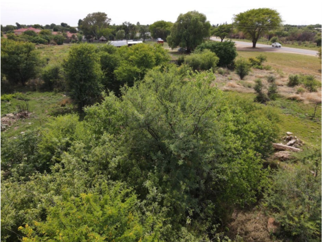
Photograph 7: Site characteristics