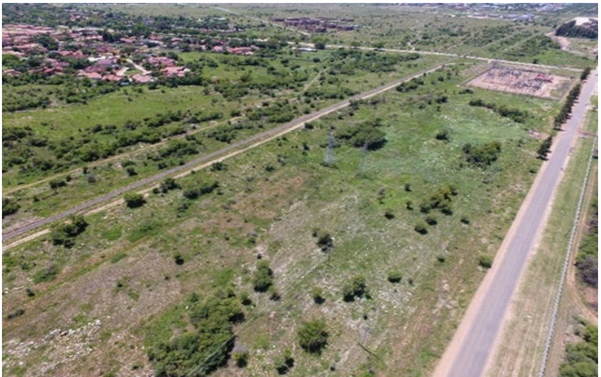
Photograph 1: Birds eye view of site earmarked for development