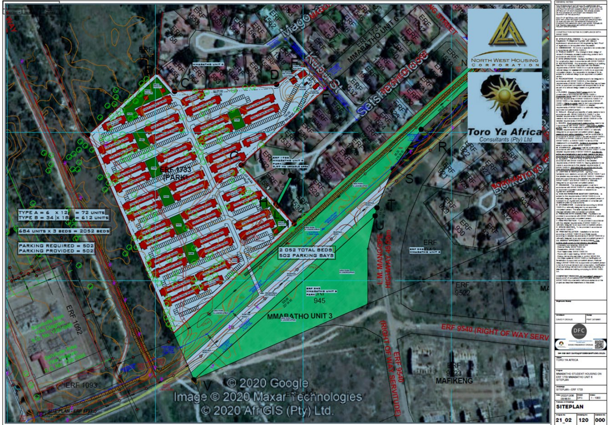
Figure 2: Proposed layout