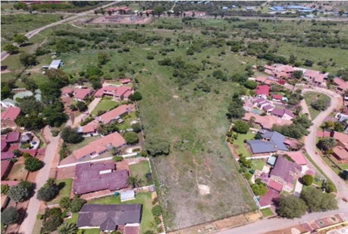
Photograph 4: Birds eye view of site earmarked for development