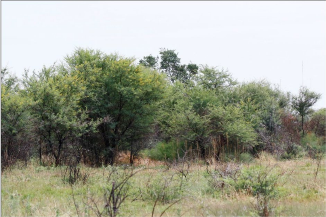
Photograph 6: Site characteristics