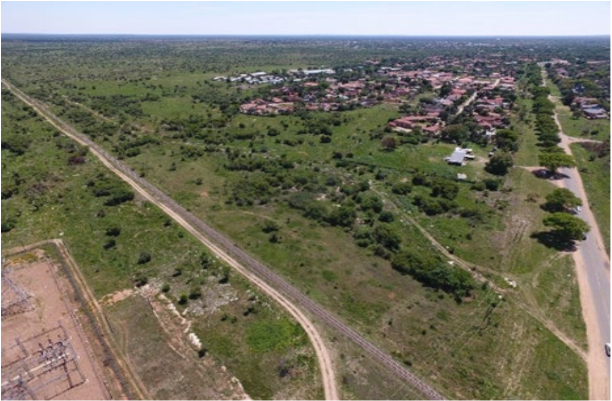
Photograph 2: Birds eye view of site earmarked for development