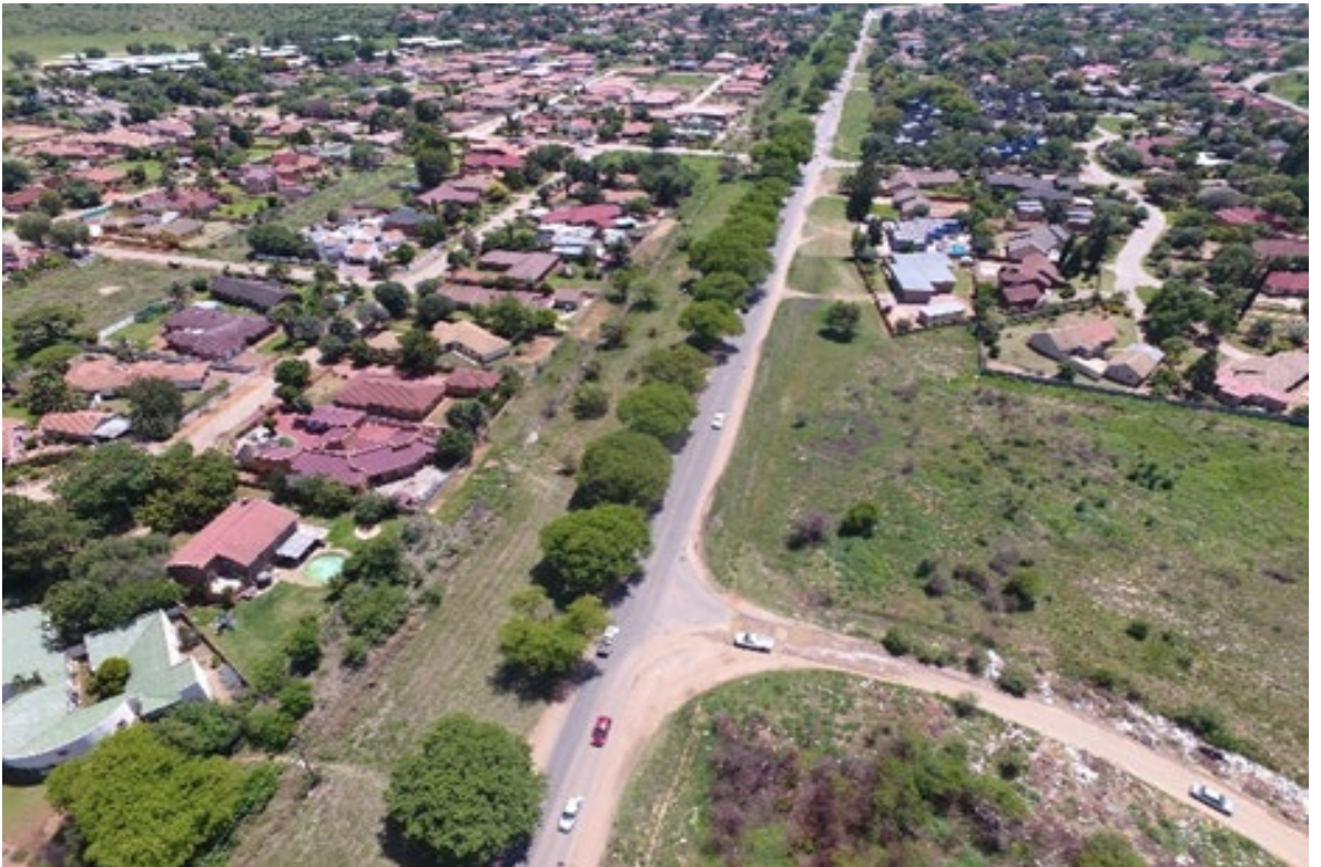
Photograph 3: Birds eye view of the site earmarked for development