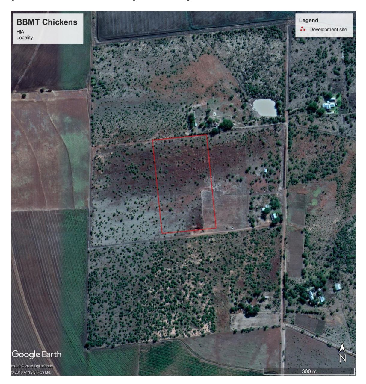
Figure 1: Location of study area

The proposed project is located approximately 20km South-East of Bela-Bela. The project site falls within the jurisdiction of the Bela-Bela Local Municipality and the Waterberg District Municipality. The proposed development terrain is located on agricultural land use and the general land use of the surrounding area is also agricultural in nature.