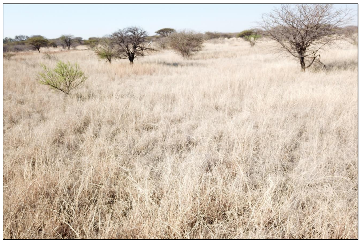
Figure 5: Area earmarked for development