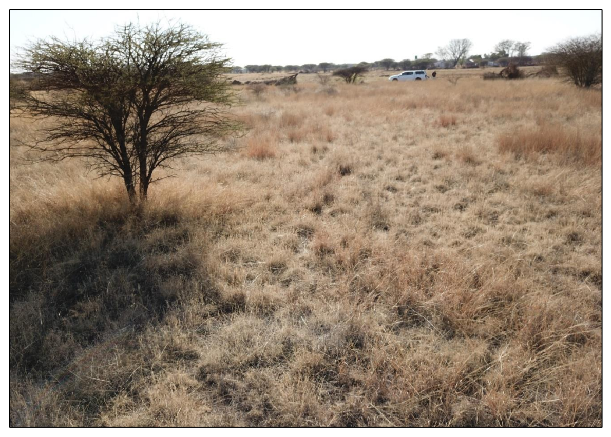
Figure 4: Area earmarked for development