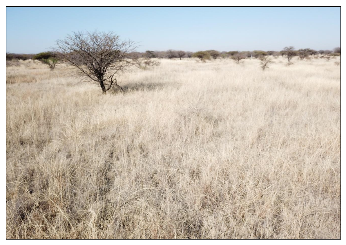
Figure 2: Area earmarked for development