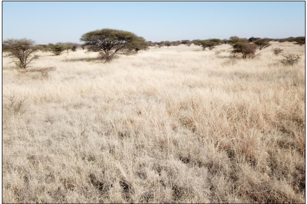
Figure 3: Area earmarked for development