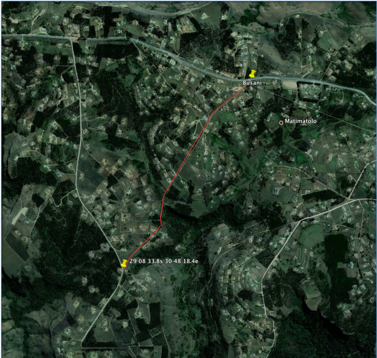
Figure 1. Aerial view of proposed upgrade