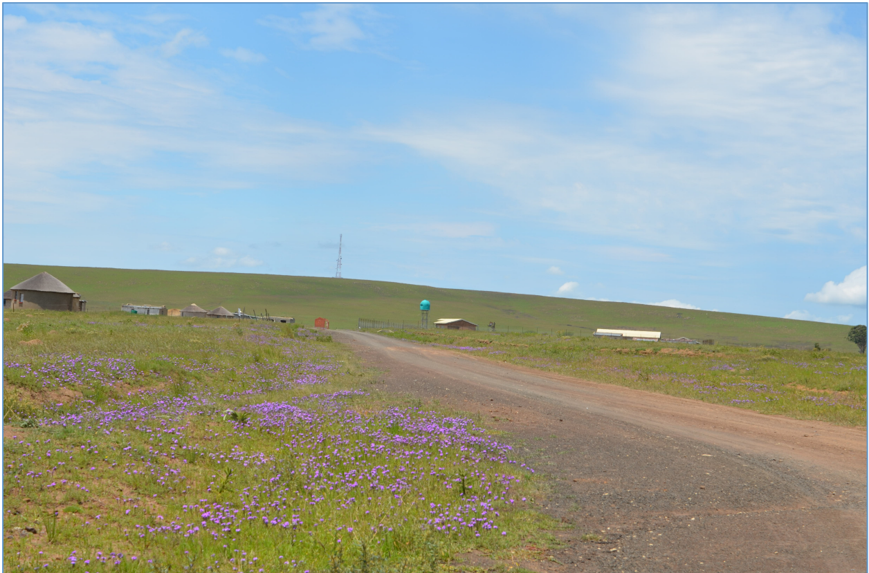
Figure 2. Proposed road upgrade

The cultural landscape in the study area is strongly associated with rural living and subsistence farming. There is still a strong community feeling here with many ancient traditions still surviving. The landscape of high, enclosing mountains and spectacular views also results in a feeling of isolation.