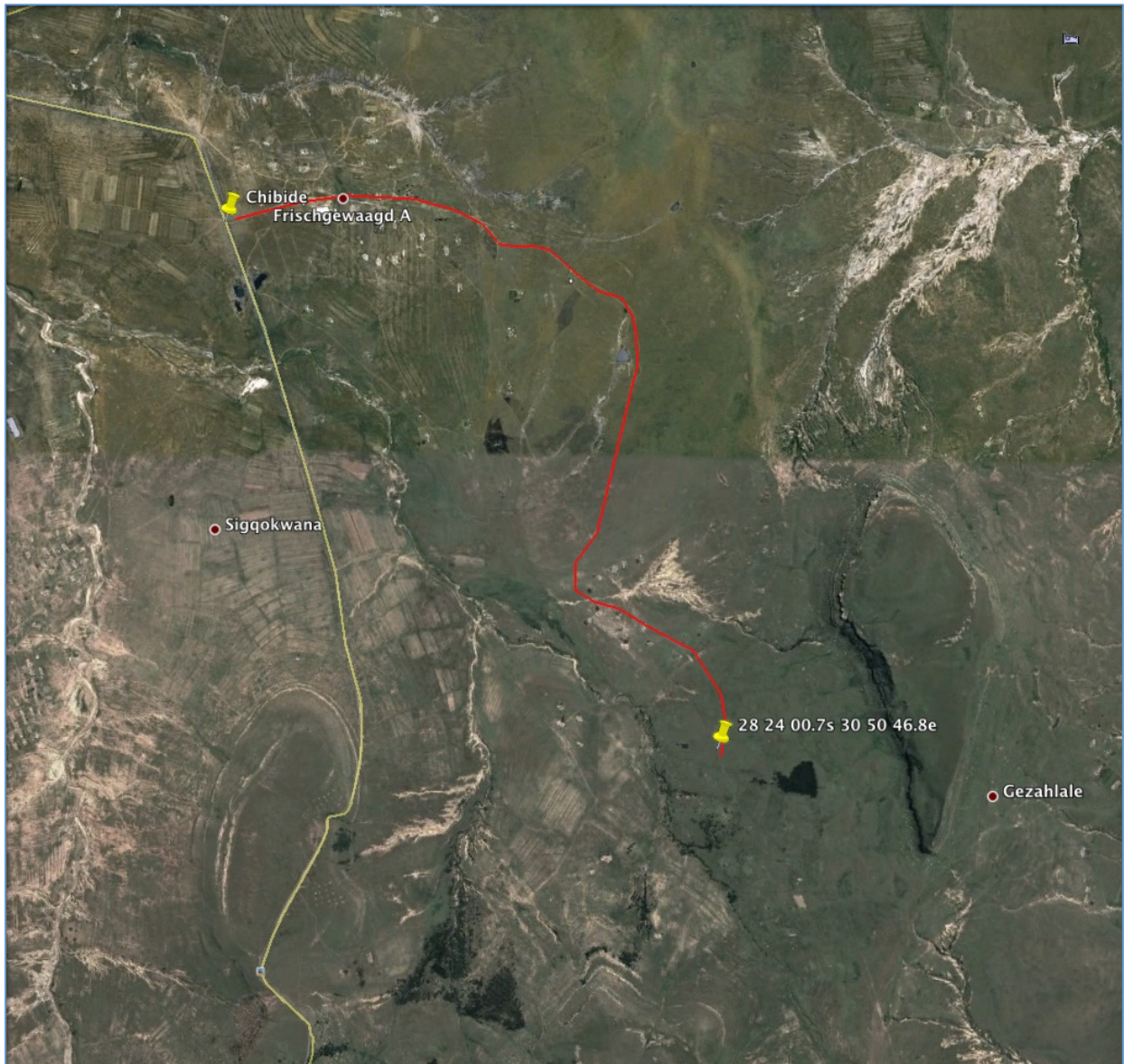
Figure 1. Aerial view of proposed upgrade