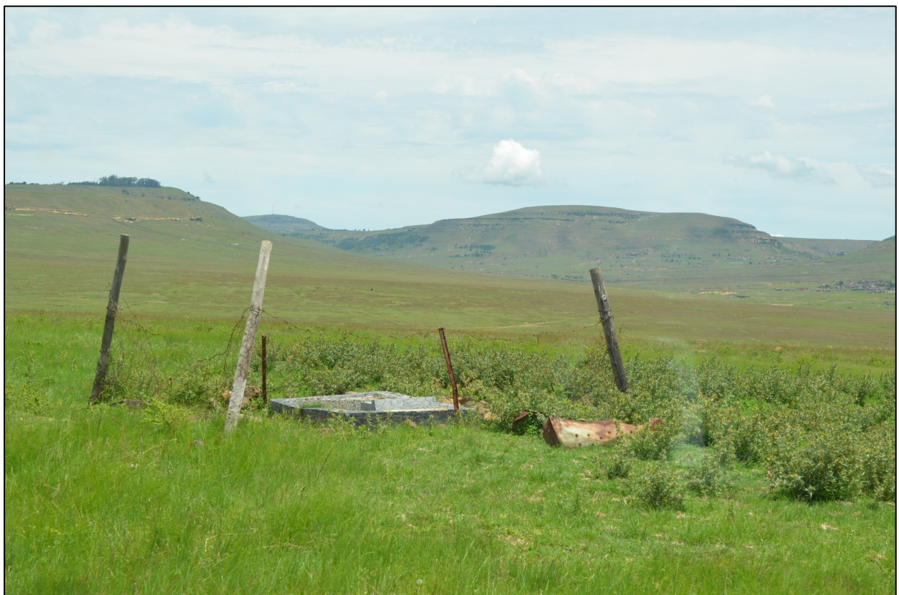
Figure 3. Grave sites near road upgrade