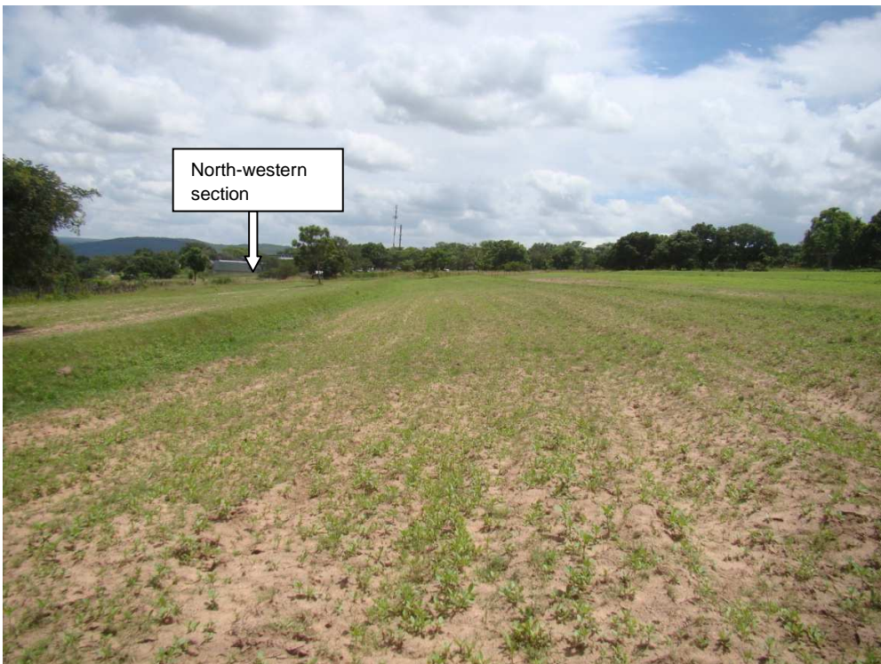
Fig. 4: View of the north-western section, with old tobacco lands in foreground.