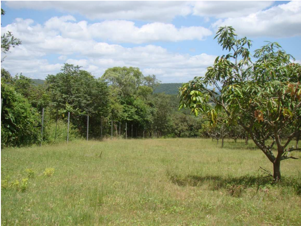
Fig. 3: South-western corner sloping towards a drainage line / dry stream bed.