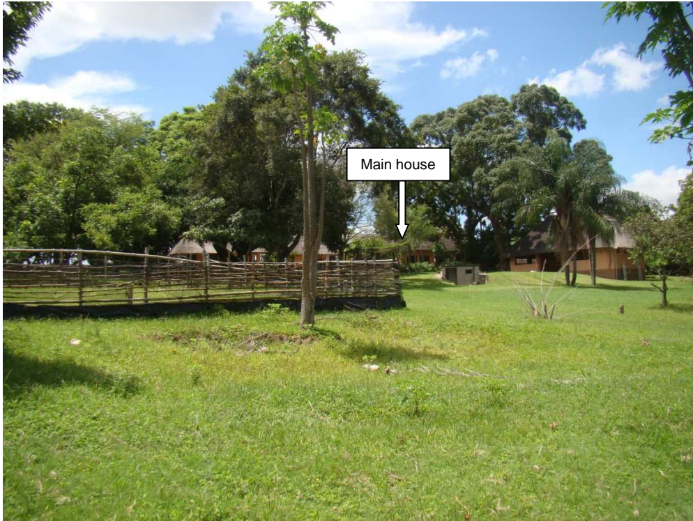
Fig. 9: View from the old tobacco lands towards the buildings. The vegetable garden is behind the pole fence.