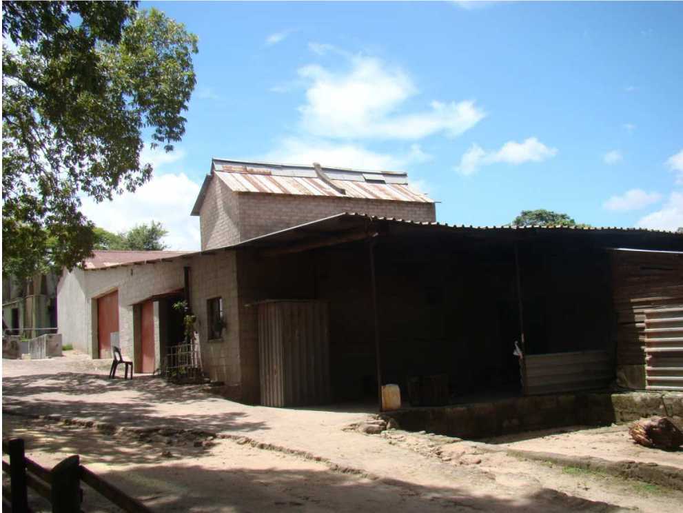
Fig. 11: Farm infrastructure. These structures are all of modern concrete bricks and not over 60 years old.