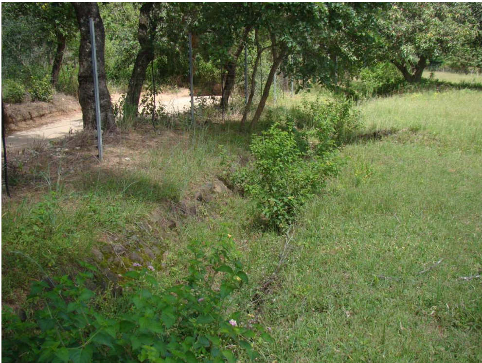
Fig. 12: A stormwater canal along the south border..