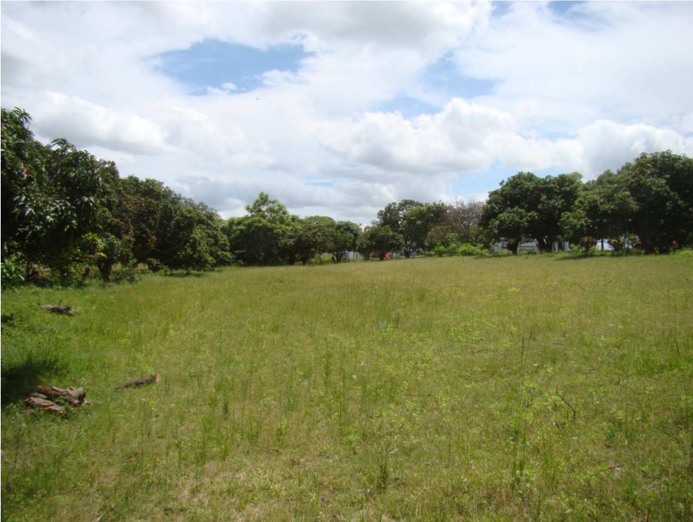
Fig. 5: North-eastern corner. Old mango trees fringe a previous cultivated land.