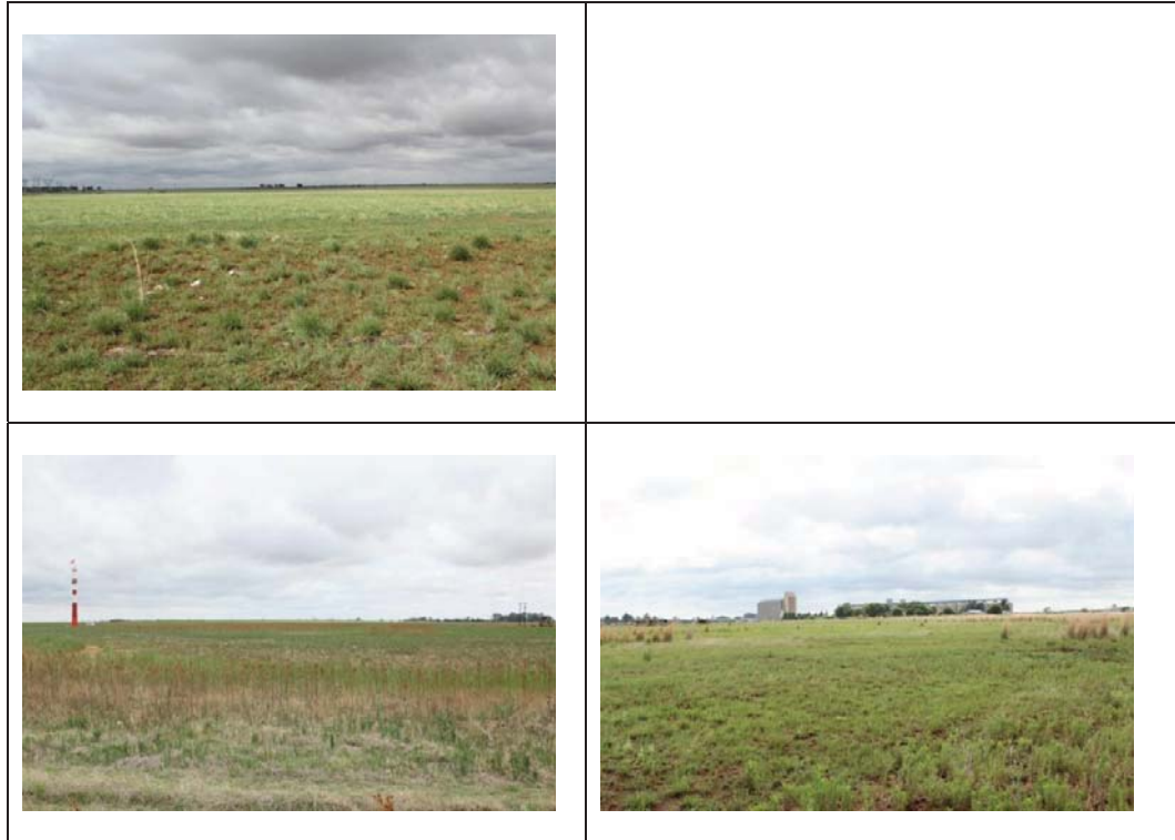
Fig. 2. Views over the study areas (western and eastern blocks).

Both of the study areas were used for agricultural fields, although some sections are now used for grazing purposes (Fig. 2).