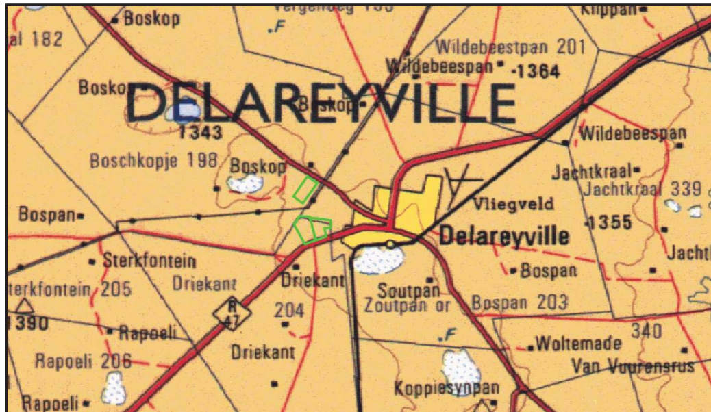
Fig. 1. Location of the study area in regional context. (Map 2624: Chief Surveyor-General)