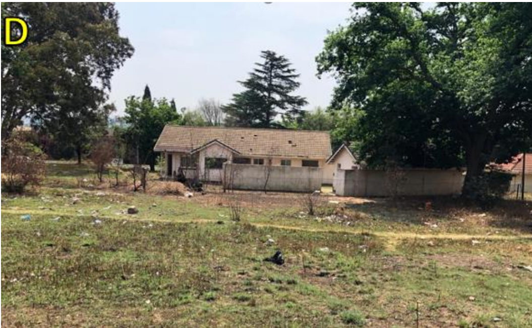
Photograph 6: Area adjacent to development area