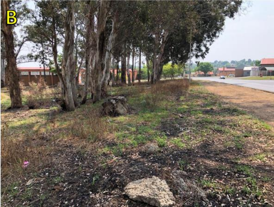
Photograph 3: Site characteristics