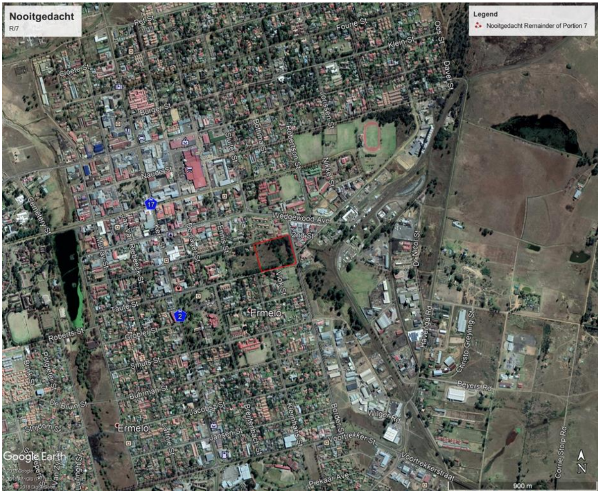
Figure 1: Locality Map (Development area indicated in red)