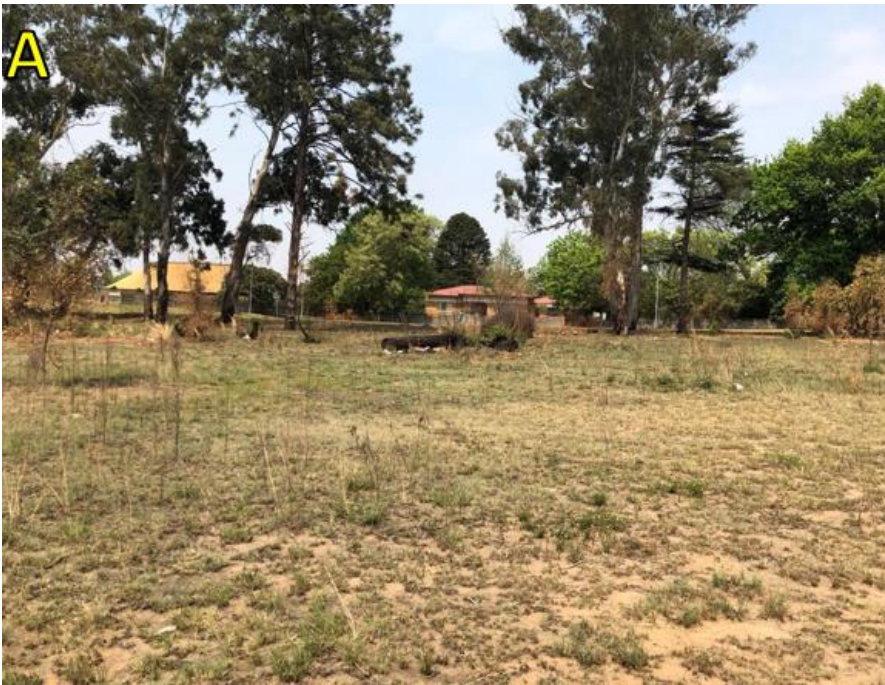
Photograph 2: Site characteristics