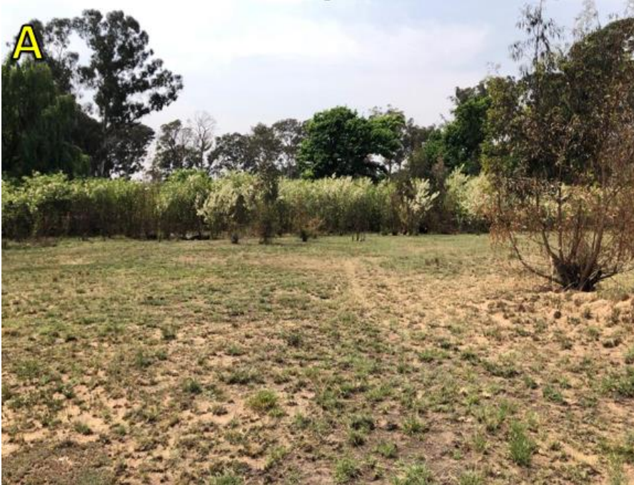
Photograph 1: Site characteristics