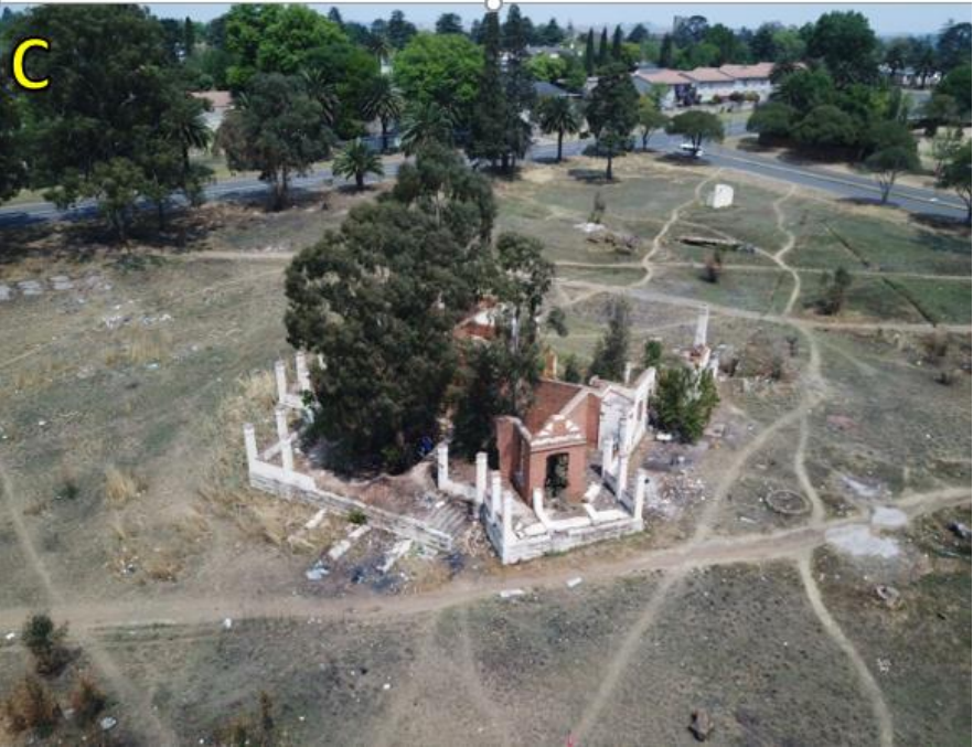
Photograph 4: Structure older than 60 years situated on the area adjacent to the development area