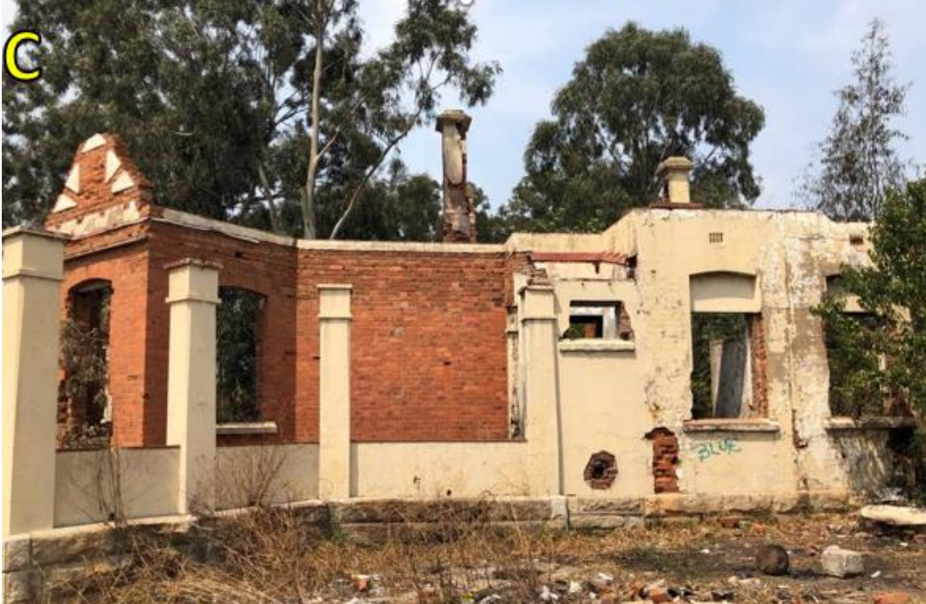
Photograph 5: Information from a resident obtained identify the structure as the old police single quarters