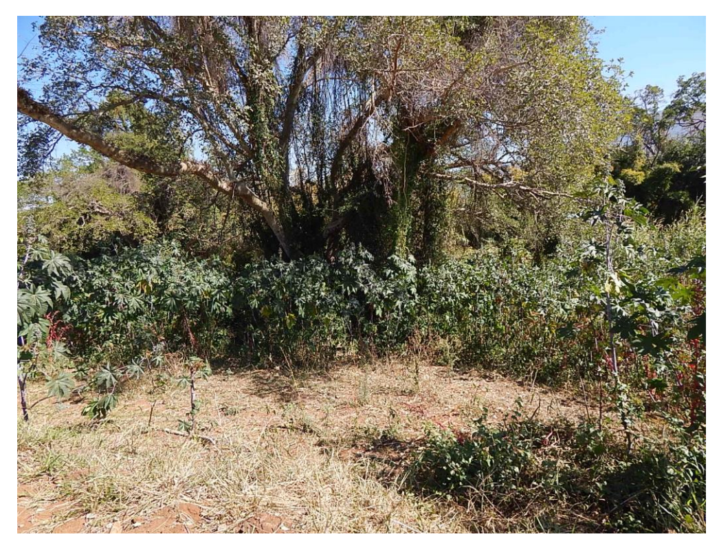
Fig. 9: The riparian zone along the Louw's Creek in the north-eastern section. Please note alien invader species, in front of the large Fig tree.