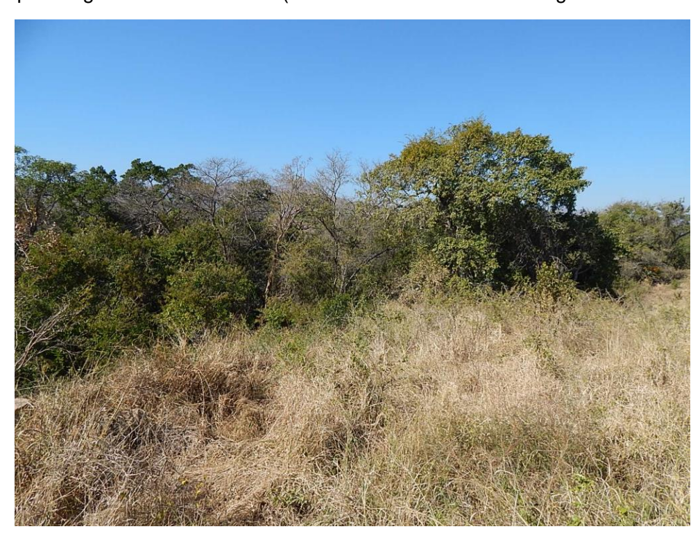
Fig. 26: The south end of the study area. The Creek is below where the large trees are.