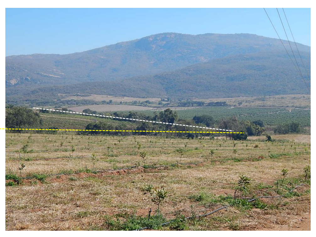
Fig. 7: A view from the east (facing west), of the Louw's Creek (yellow) and the Kaap River (white), with cultivated lands visible in the direct vicinity.