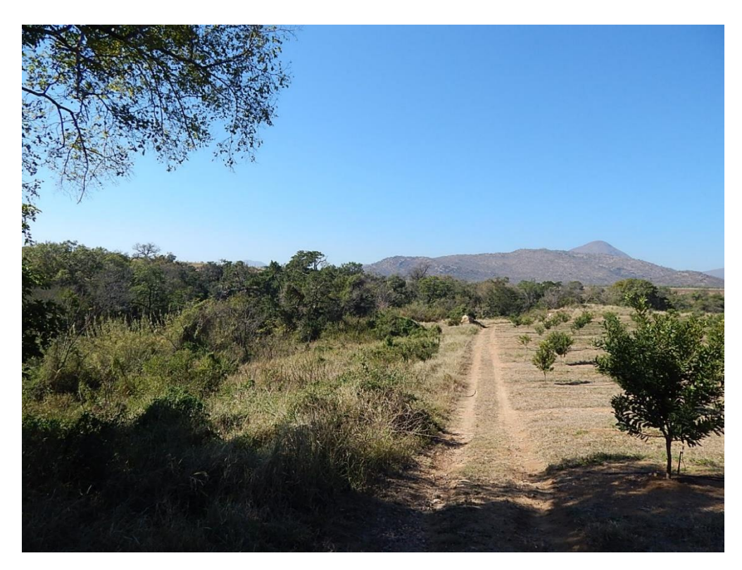
Fig. 21: A view towards the south (from the north-western corner), show the Louw's Creek towards the left, and an access road and macadamia fields to the right.