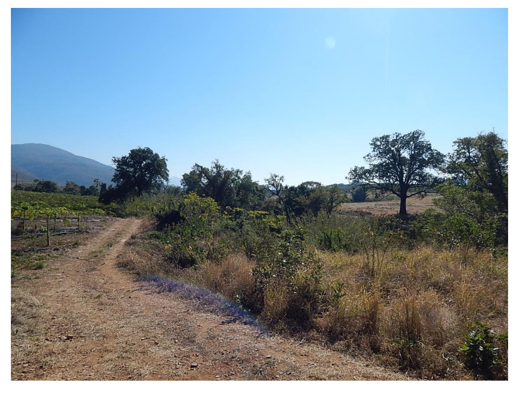
Fig. 24: A view towards the north, at the middle section of the study area (Louw's Creek is towards the right hand).