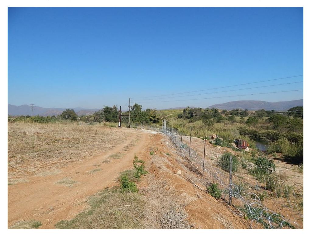
Fig. 8: The confluence of the Louw's Creek and the Kaap River is visible. The image was taken from the eastern side, facing south-west. Please note the cleared areas along the river bank.