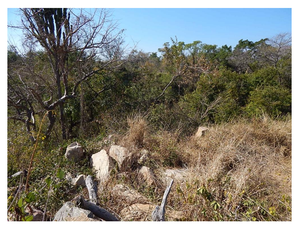
Fig. 25: A small rocky outcrop is visible towards the southern end of the study area which forms a deep cutting towards the Creek. (Louw's Creek is where the large trees are visible).