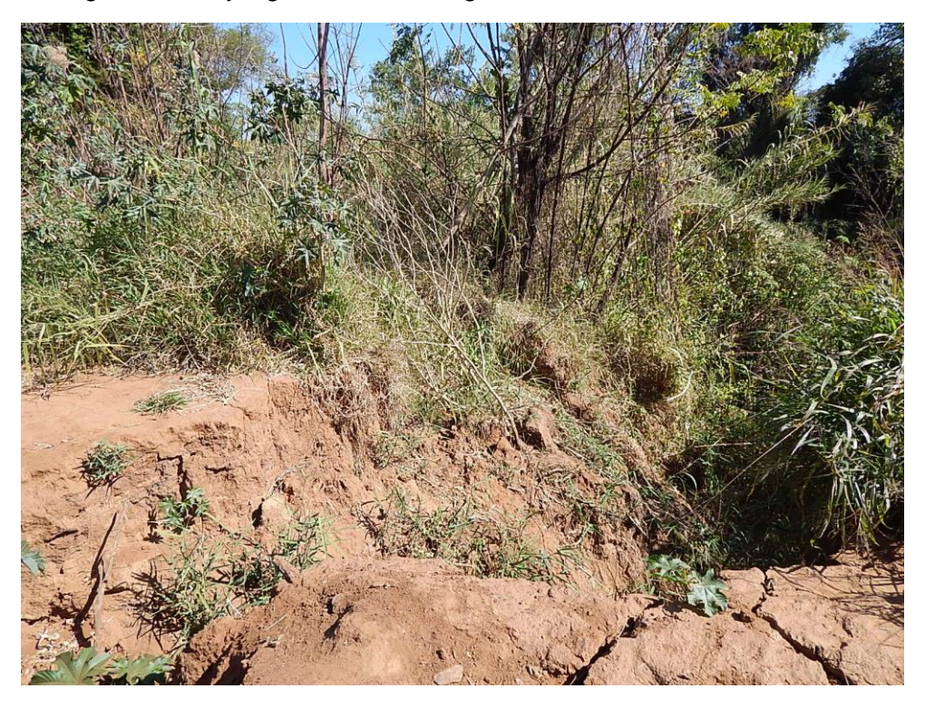
Fig. 18: A donga, east of the Louw's Creek was investigated for any signs of archeological material, but none was observed.