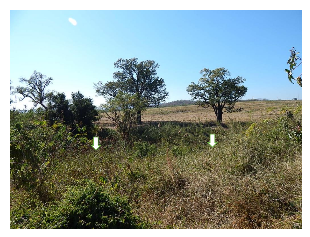
Fig. 3: A general view from the western side, facing east. The Louw's Creek is in the middle (arrows). Cultivated land visible on eastern side.