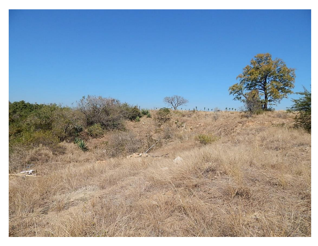
Fig. 19: A quarry on the western side was investigated for any signs of archaeological material, but none was observed.