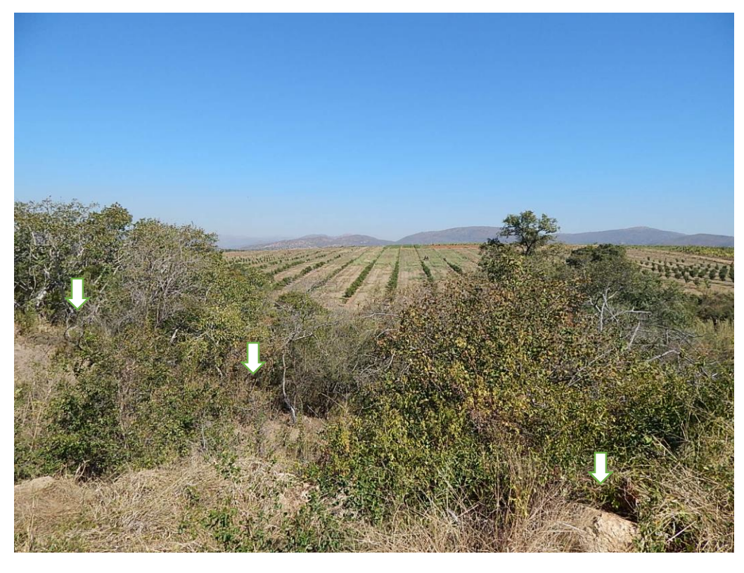
Fig. 4: A general view from the eastern side, facing west. The arrows indicate the Louw's Creek. Cultivated land on the western side.