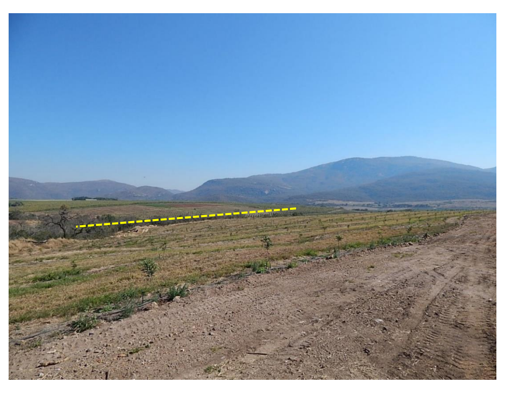
Fig. 1: A general view of the Louws Creek (yellow dashes), from the south-east, facing northwest.