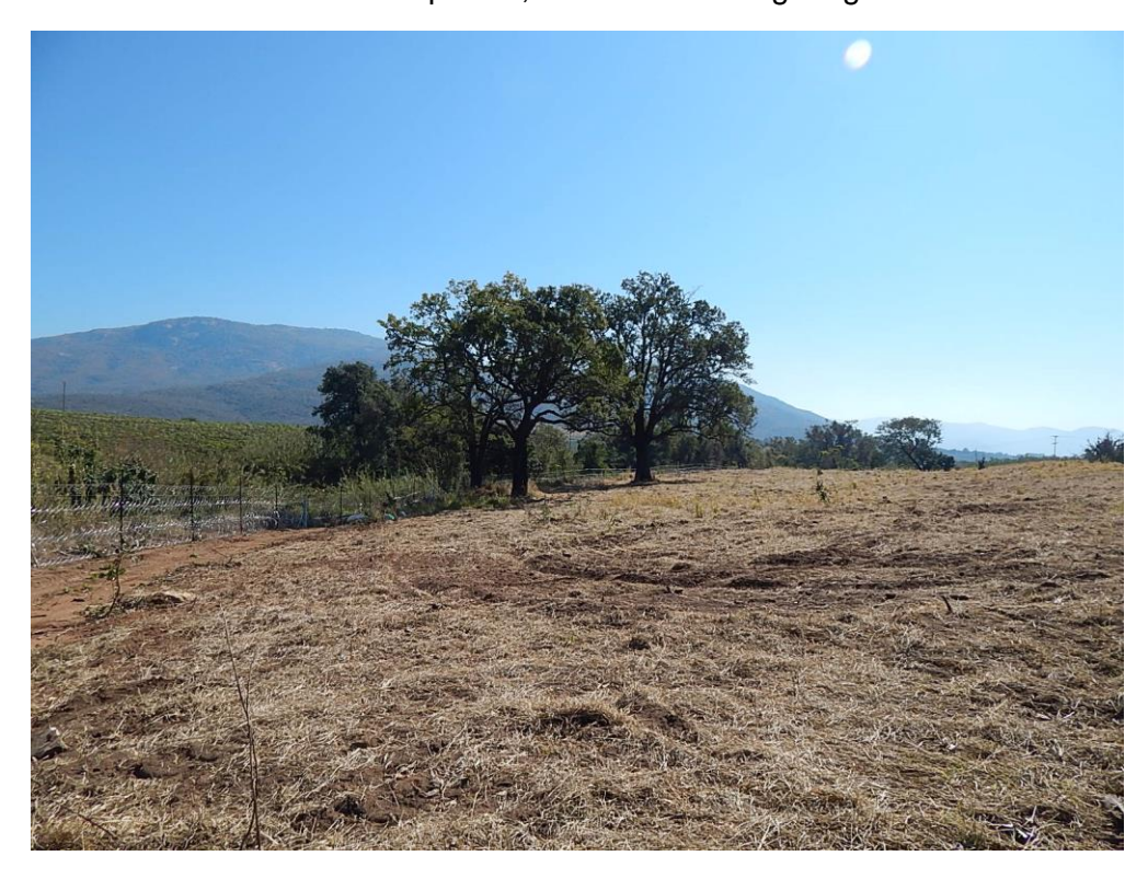
Fig. 10: The Louw's Creek is visible just behind the fence. The areas to the east are cleared for agriculture (orchards).