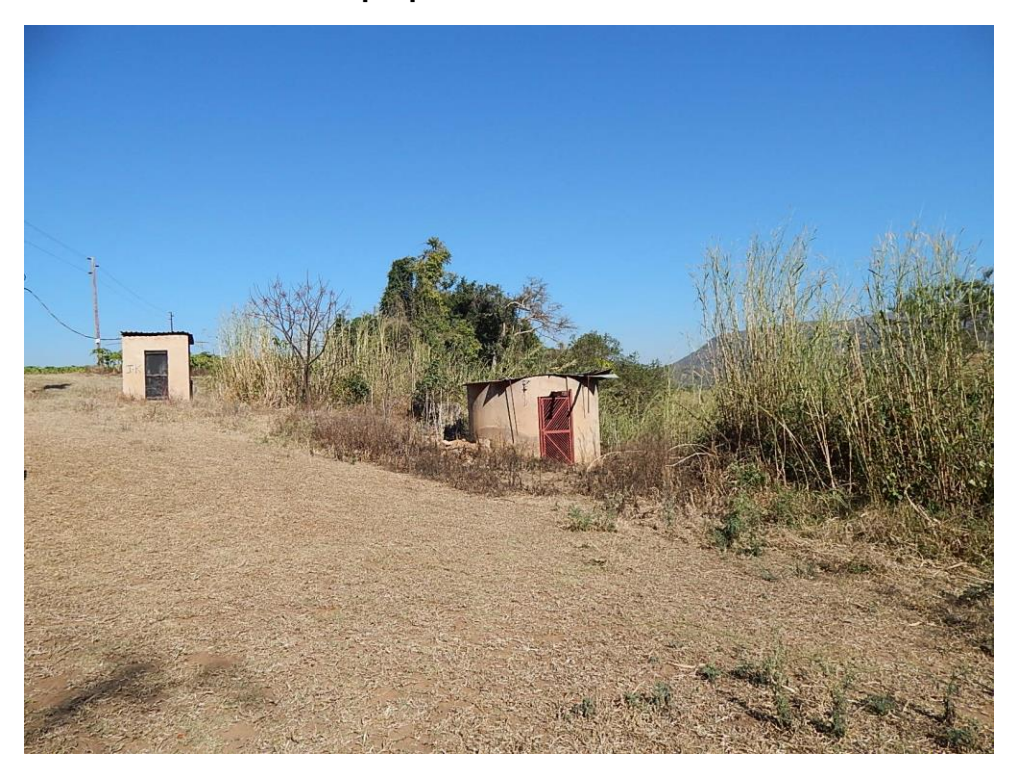
Fig. 5: The section on the western side between the Louw's Creek and the Kaap River. Recent pump house structures are visible (farm ESPERADO ANNEX).