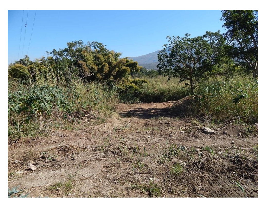
Fig. 17: An area in the eastern section of the study area (Creek) was scraped clear. Large bamboo (other side of the Creek), and other invader species are also visible. This area was investigated for any signs of archaeological material, but none was observed.