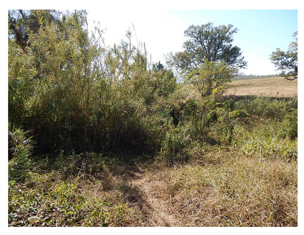
Fig. 23: Visibility in the riparian zone of the Louw's Creek was restricted. View of the middle section on the western side.