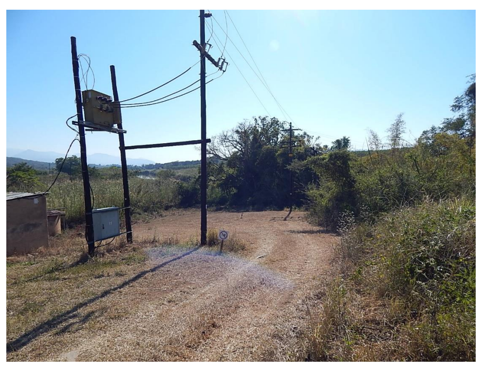
Fig. 20: The north-western corner where the dam wall will be situated. Please note the large powerlines and pump station (farm ESPERADO ANNEX).