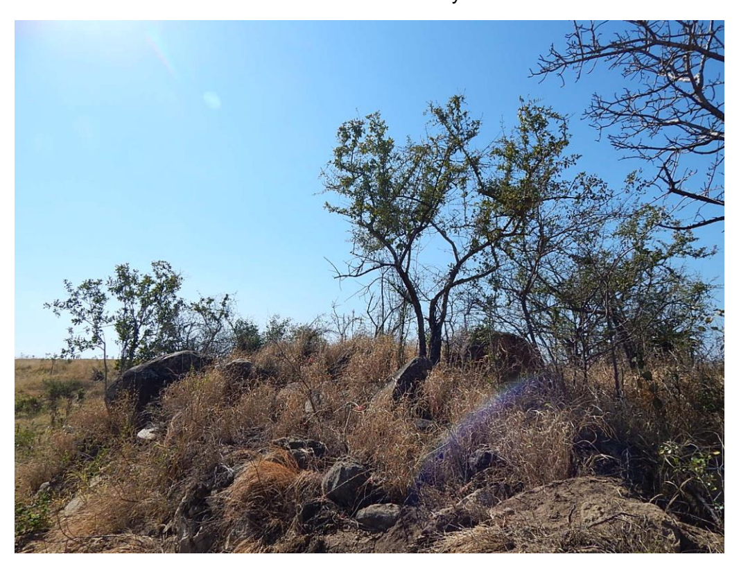
Fig. 14: A small rocky outcrop to the south of the study area.