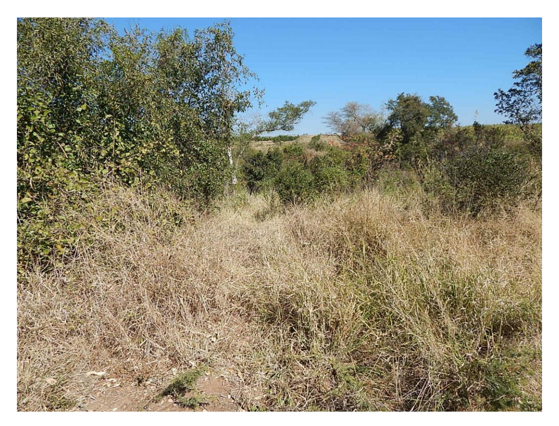
Fig. 11: The Louw's Creek (middle section) on the eastern side. Vegetation was dense.