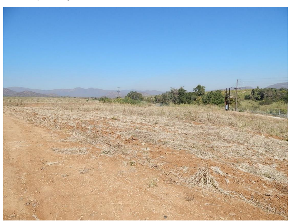
Fig. 16: The sections to the east of the Louw's Creek is de-bushed and prepared for establishing orchards.