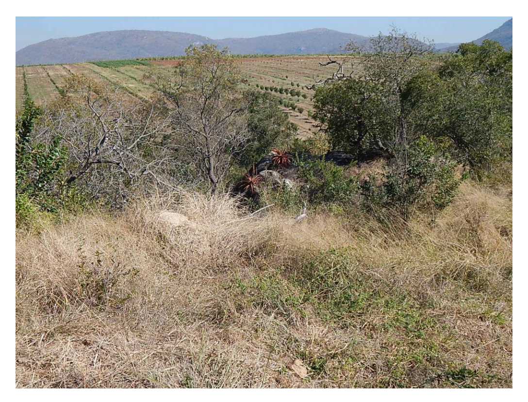
Fig. 13: The southern section which is steep consists of a small rocky outcrop. The cultivated lands to the west are clearly visible.