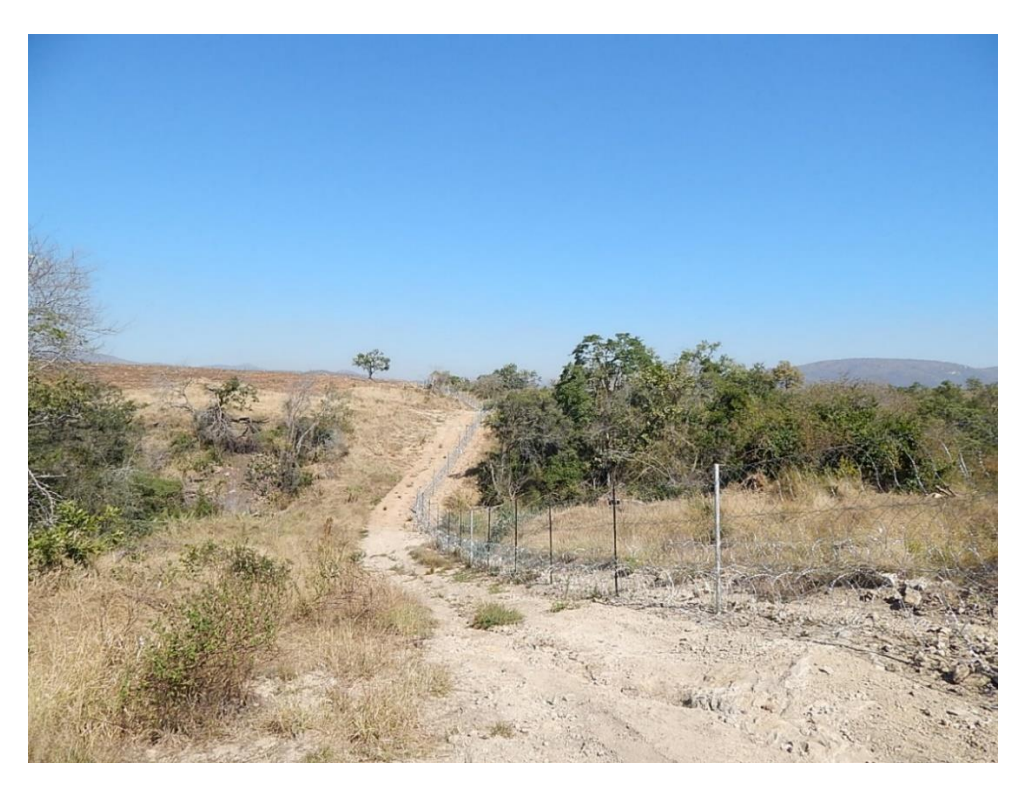
Fig. 15: View of the south end of the study area. The Louw's Creek is to the right, behind the fence.