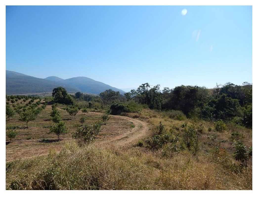
Fig. 22: A view towards the north (taken from the south). The Louw's Creek is on the right, with the access road and macadamia fields to the left.