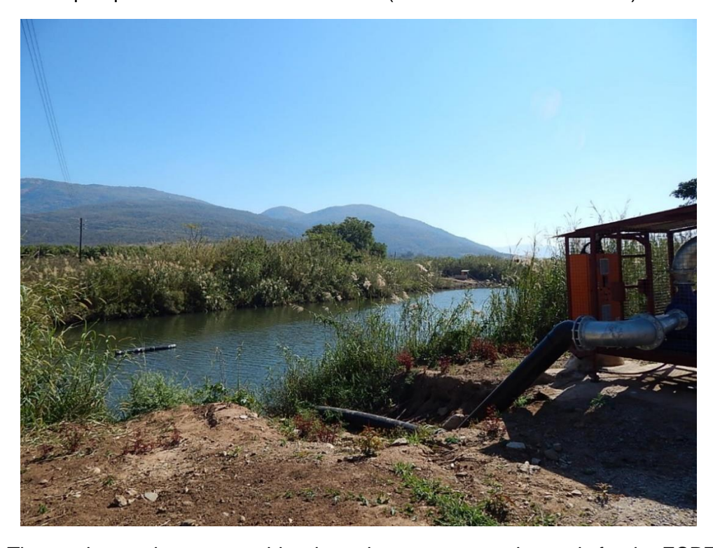
Fig. 6: The section on the eastern side where the recent pump house is for the ESPERADO farm is.