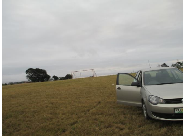
Figure 3: East view of the study area