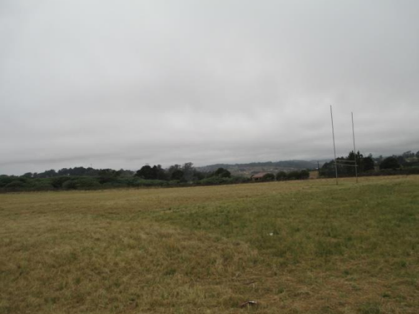
Figure 5: Rugby field within the proposed site