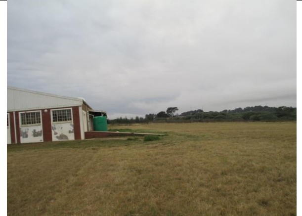
Figure 4: South East view of the study area