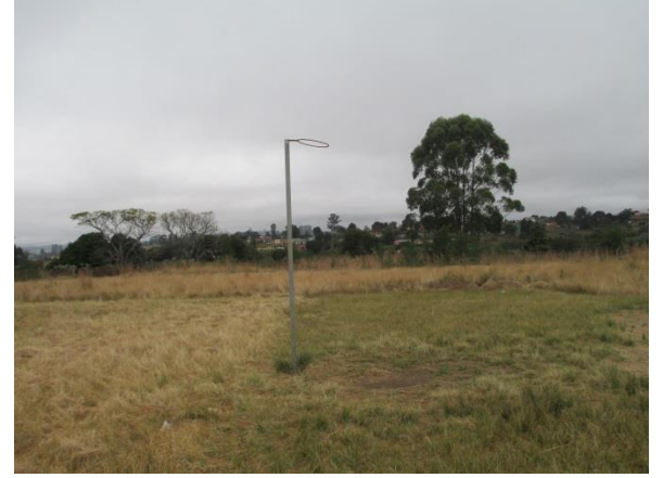
Figure 6: Netball field within the study area