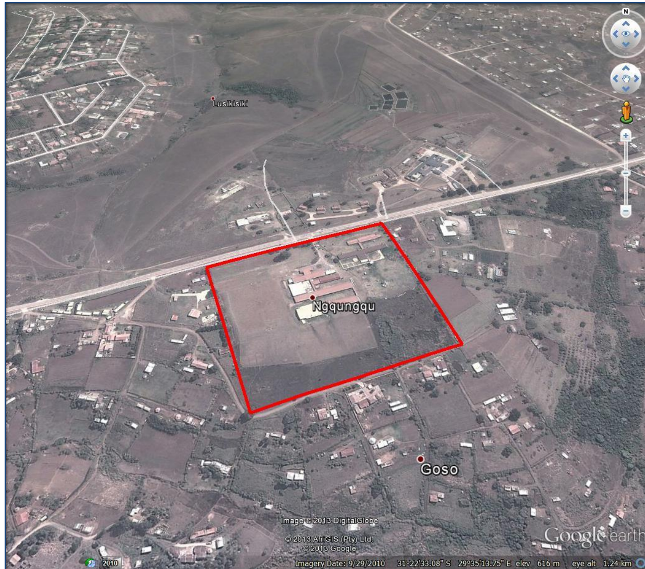
Figure 3: Aerial view of the study area