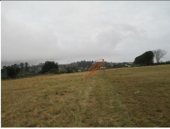
Figure 1: North view of study area