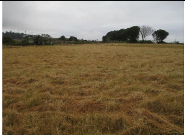
Figure 2: North East view of the study area