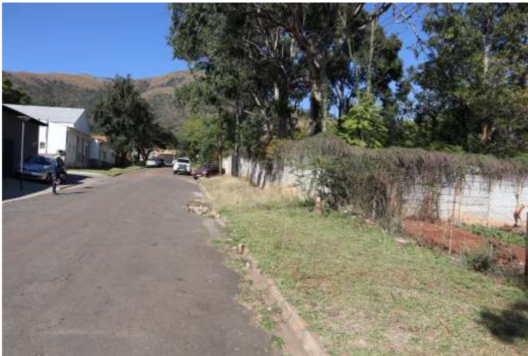
Figure 7: View of Wagner Street from Northern side and the proposed site to the right.