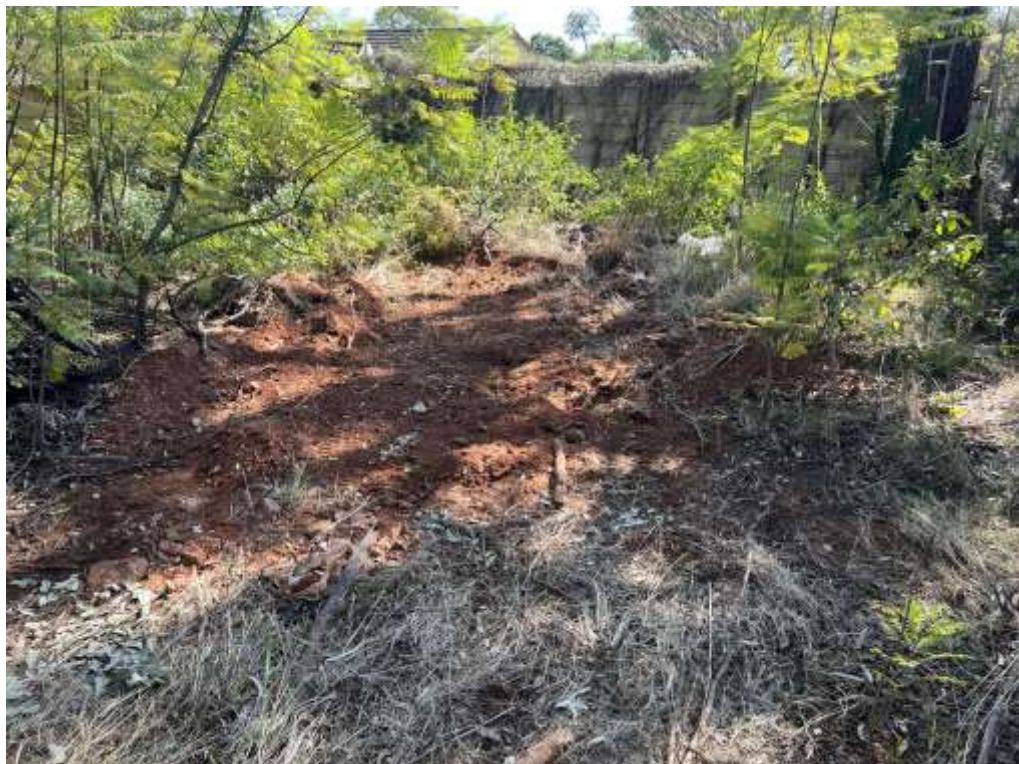
Figure 5: View of a Geo-tech test pit within the proposed site.