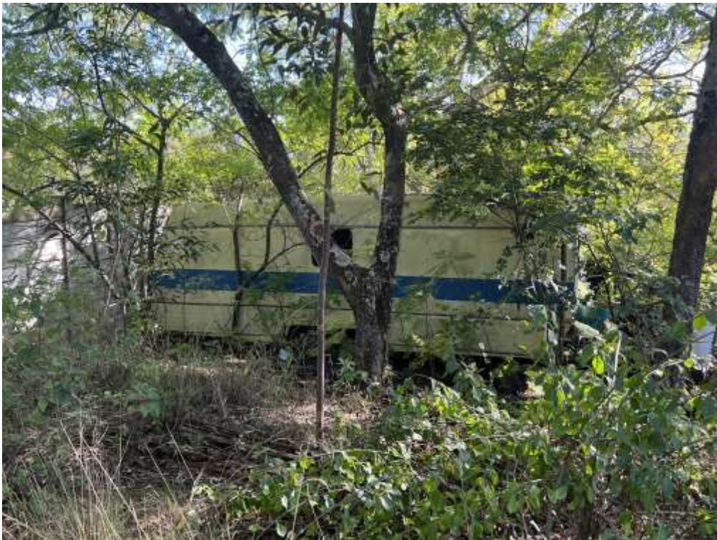
Figure 3: View of the Police Caravan within the proposed site.