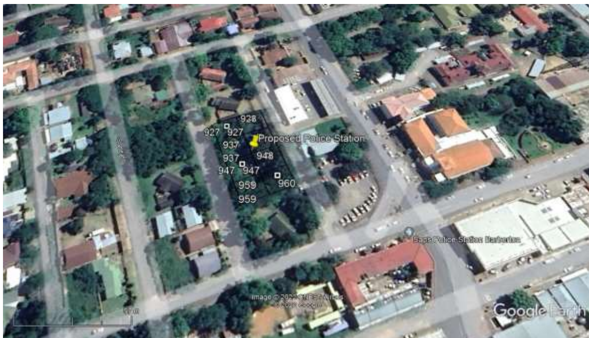
Figure 1: Aerial Photo map.

The proposed site is situated between Wagner Street to the east, Harris Street to the West, De Villiers Street to the South and Van Der Merwe Street to the North GPS S25.790073° E31.051010°. The site is well fenced by Concrete palisade and it is not easily accessed. The site is only accessed through the gate which is facing Sheba Motors along Wagner Street which end at the Police Station Building to the South.