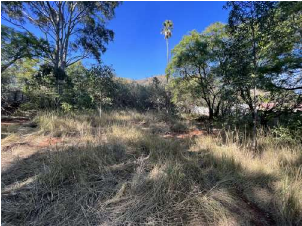
Figure 2: General view of the proposed site.