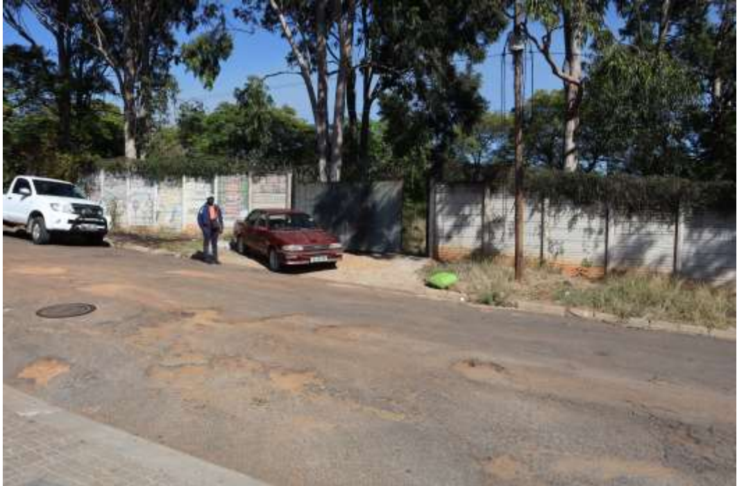
Figure 6: View of the the access gate to the site.