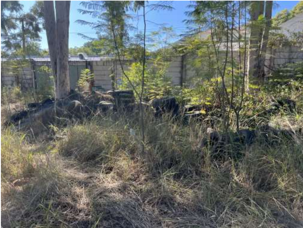
Figure 4: View of the old tires from the Police cars.