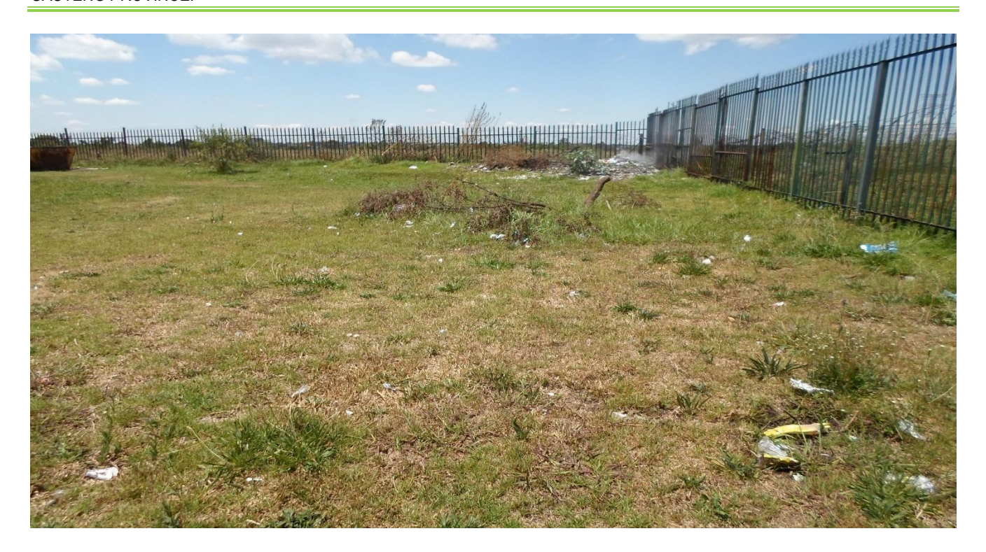
Plate 2: showing proposed school upgrade site.