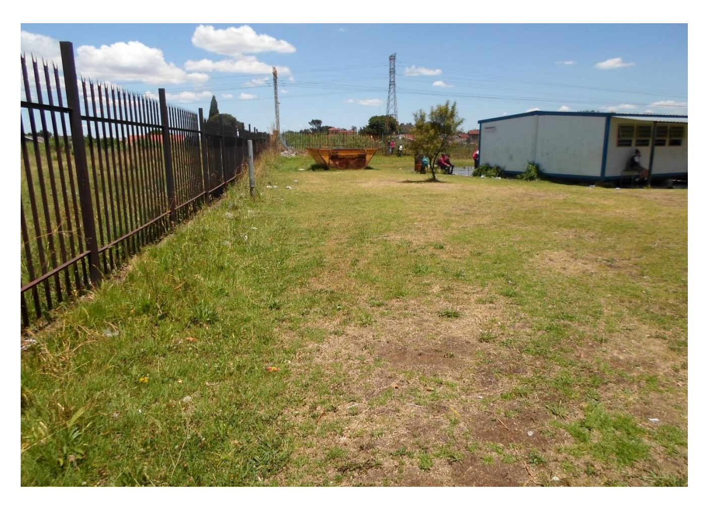
Plate 1: showing the proposed School Upgrade site

The following photographs illuminate the nature and character of the Project Area.