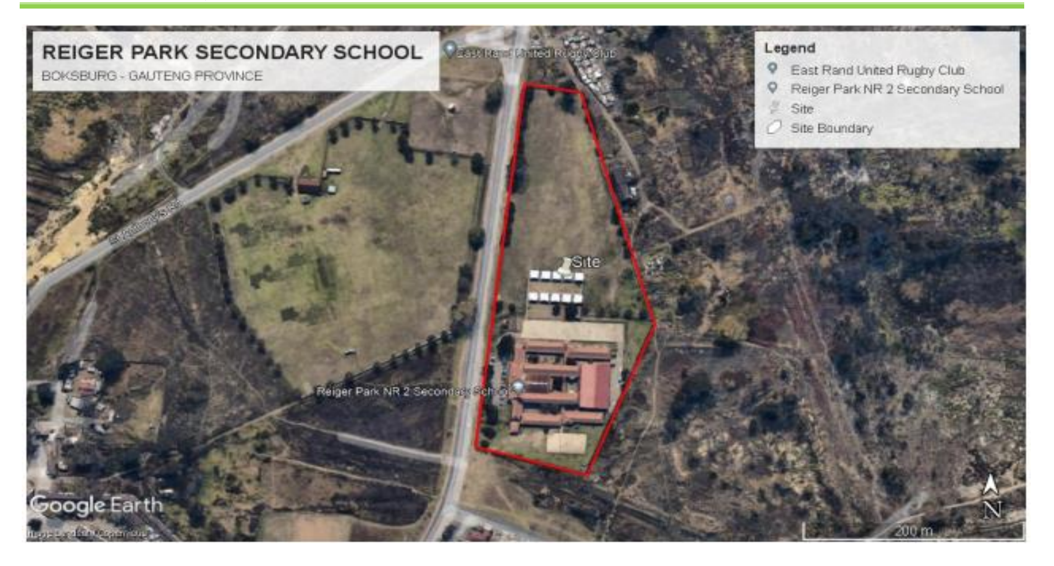
Figure 1: Location of the proposed project site (ISS, 2022)