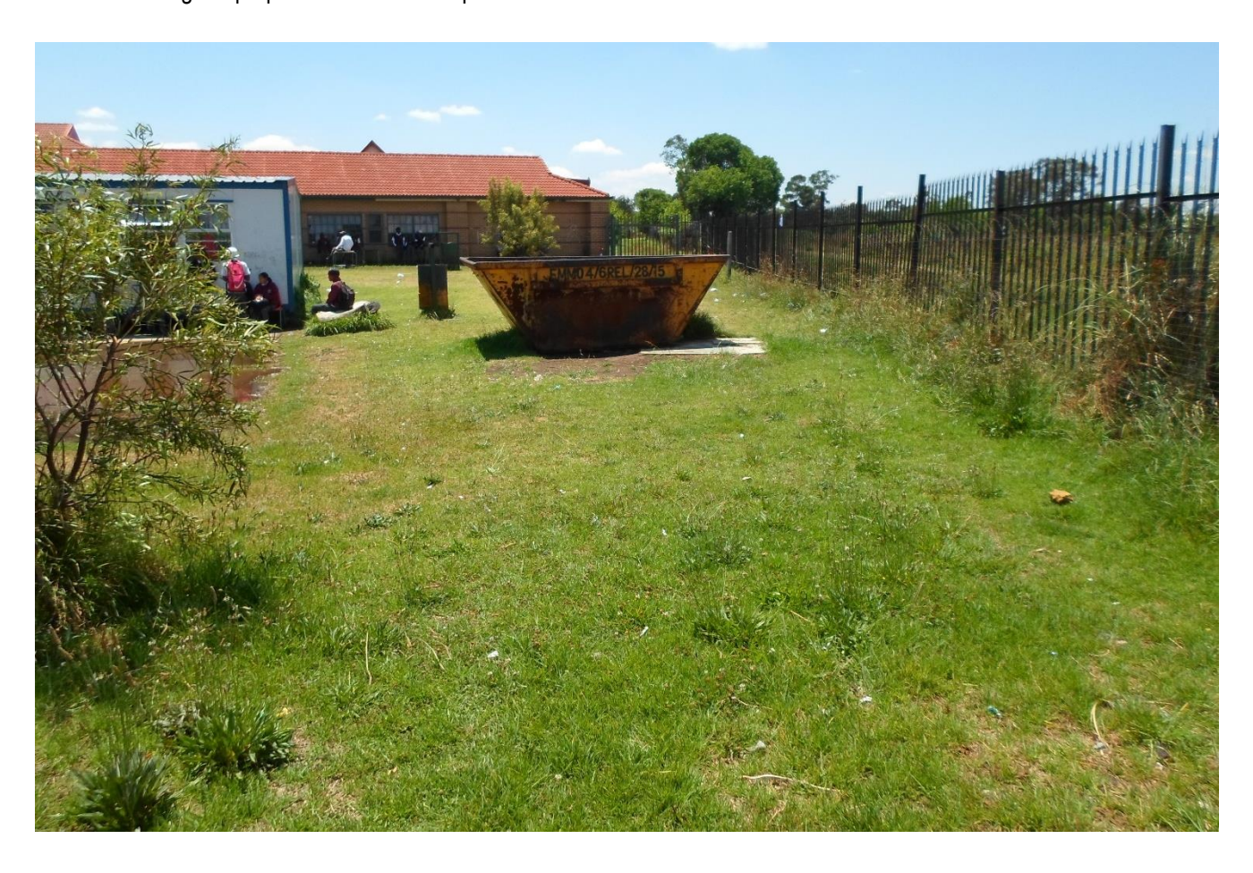
Plate 7: showing the proposed school upgrade site