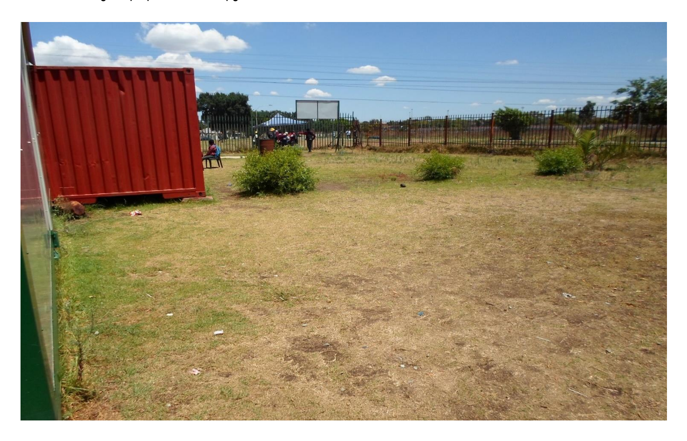
Plate 9: showing the proposed school upgrade site