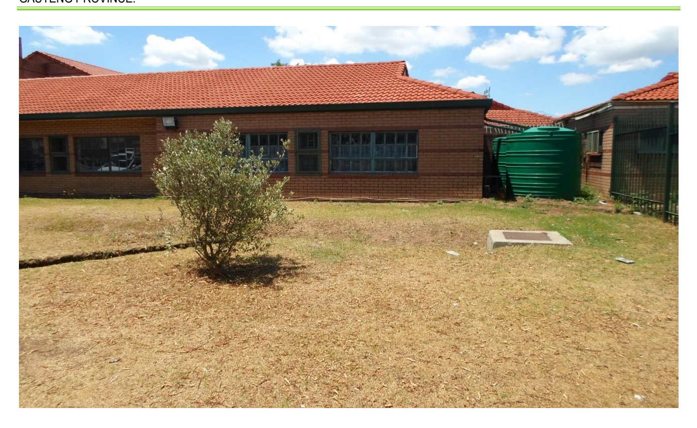
Plate 14: showing the proposed school upgrade site