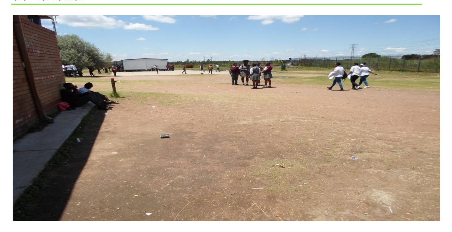
Plate 4: showing proposed school upgrade site