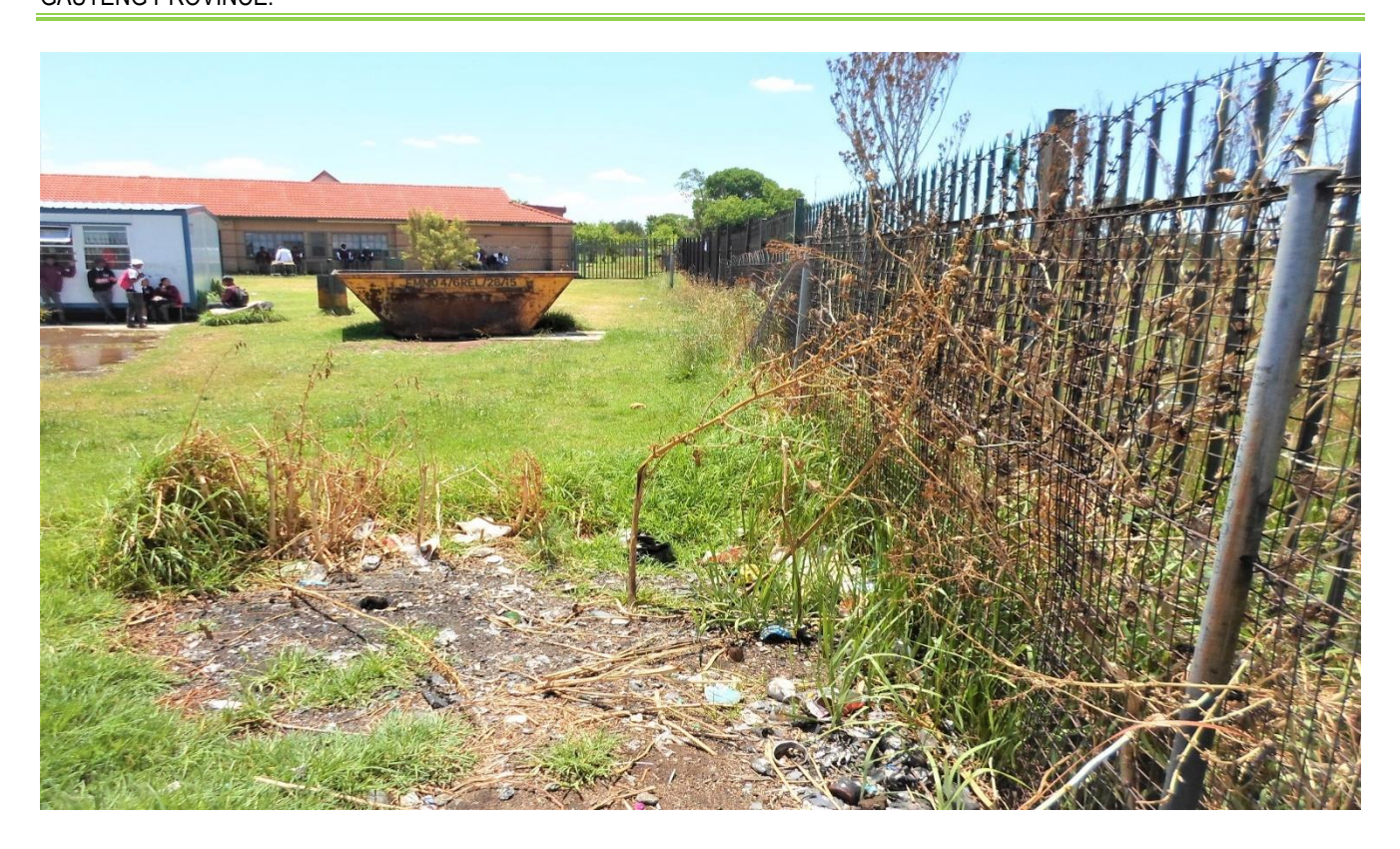
Plate 10: showing the proposed school upgrade site.