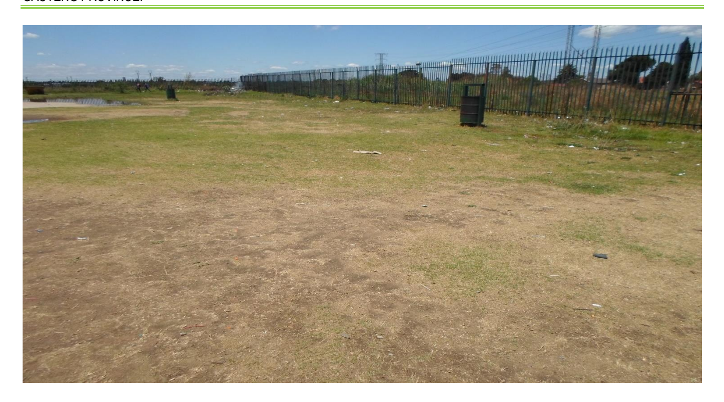
Plate 8: showing the proposed school upgrade site