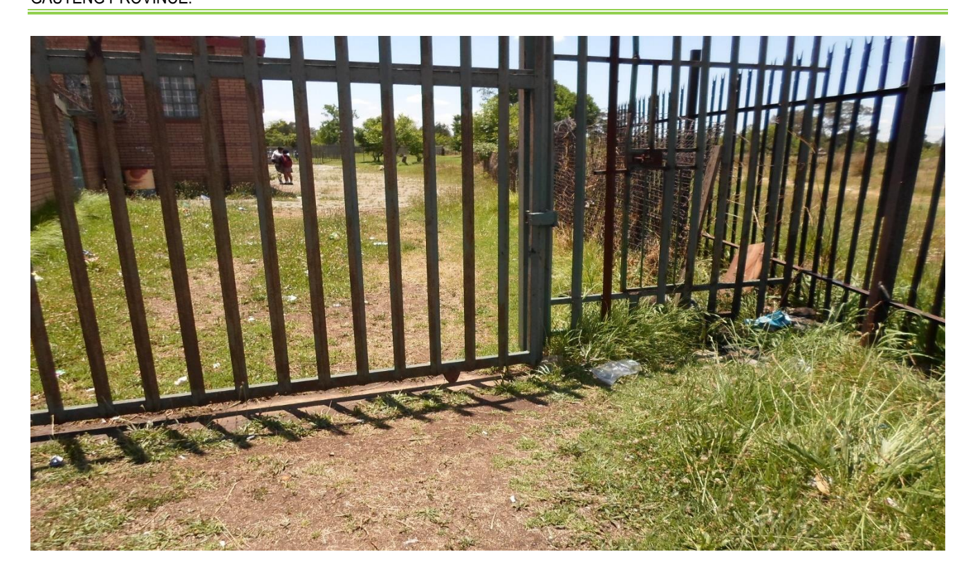
Plate 12: showing the proposed school upgrade site