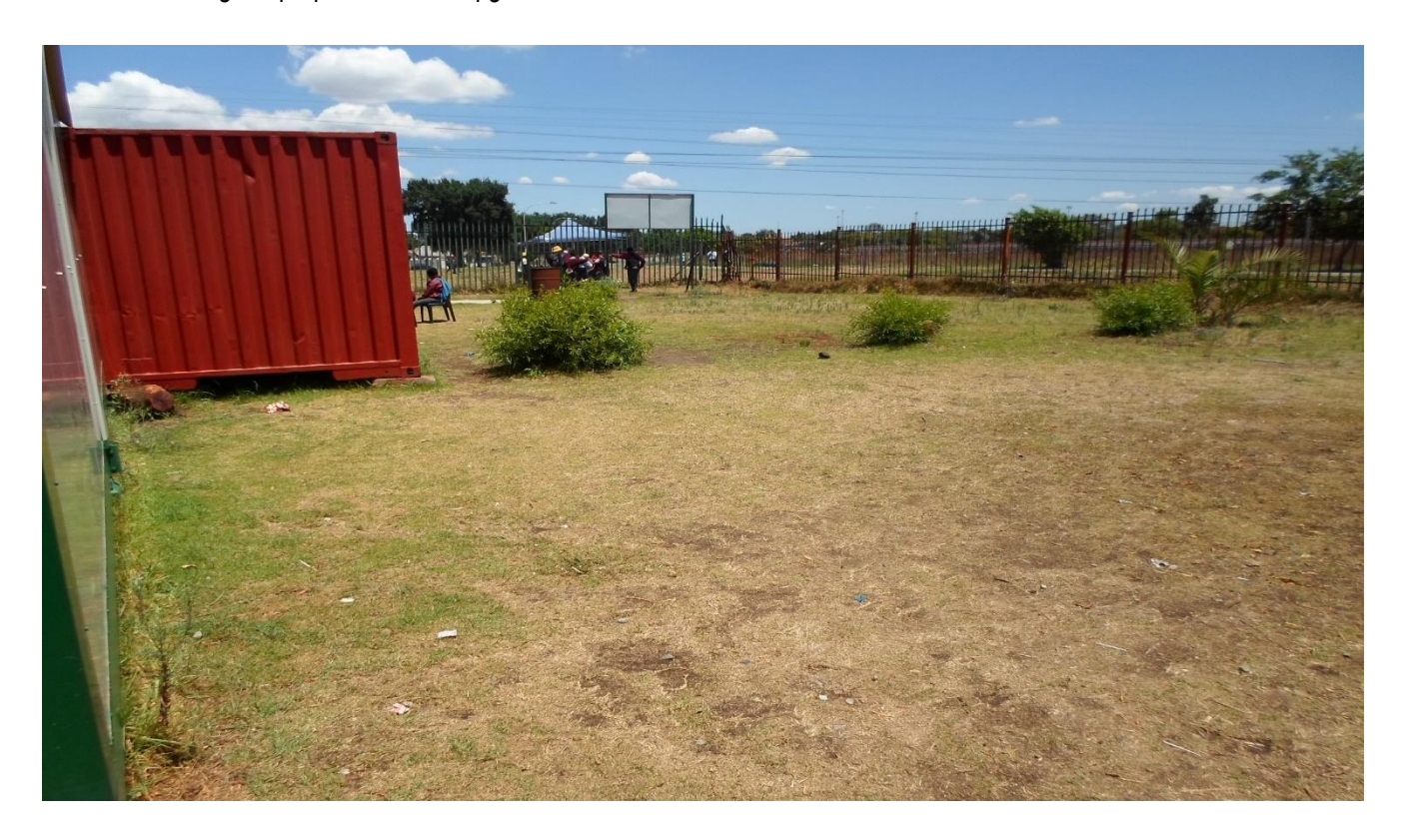
Plate 13: showing the proposed school upgrade site