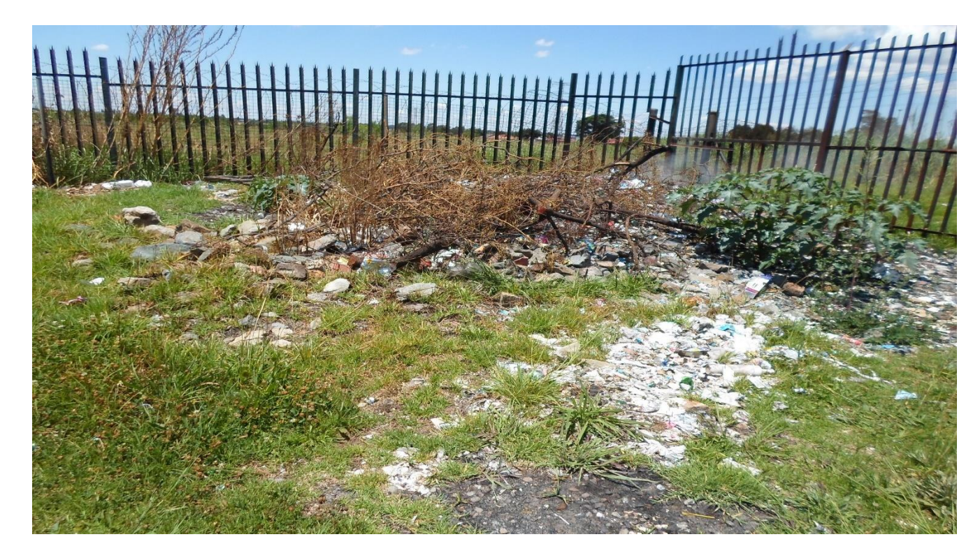
Plate 3: showing proposed school upgrade site.