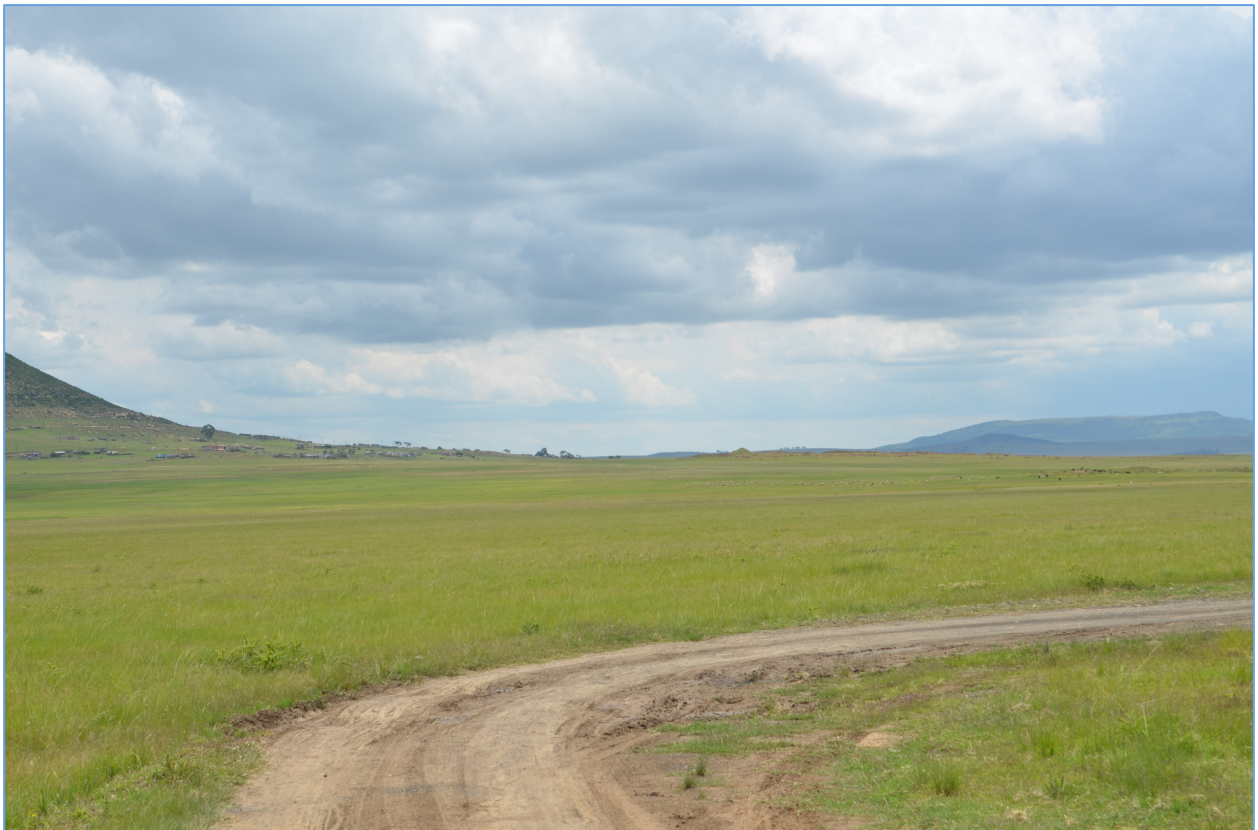
Figure 2. Road upgrade section

The cultural landscape in the study area is strongly associated with rural living and subsistence farming. There is still a strong community feeling here with many ancient traditions still surviving. The landscape of high, enclosing mountains and spectacular views also results in a feeling of isolation.