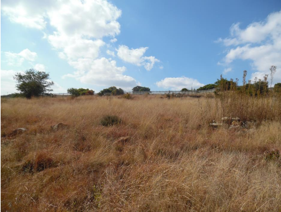
Figure 3: Site caharacteristics: Photograph taken from the west