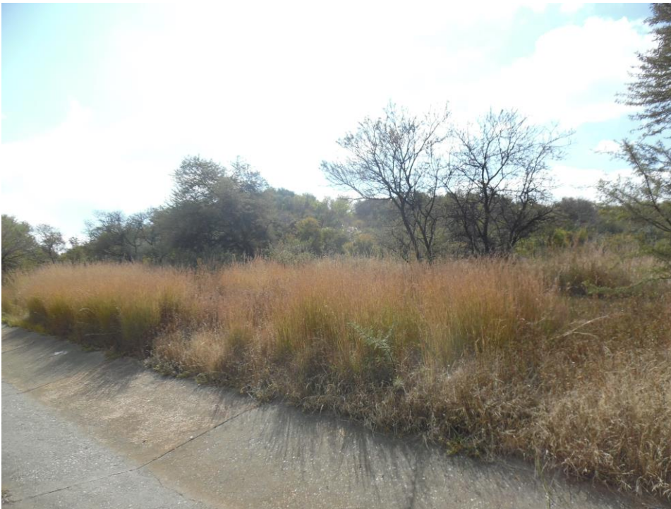
Figure 8: Site characteristics: Photograph taken from the west