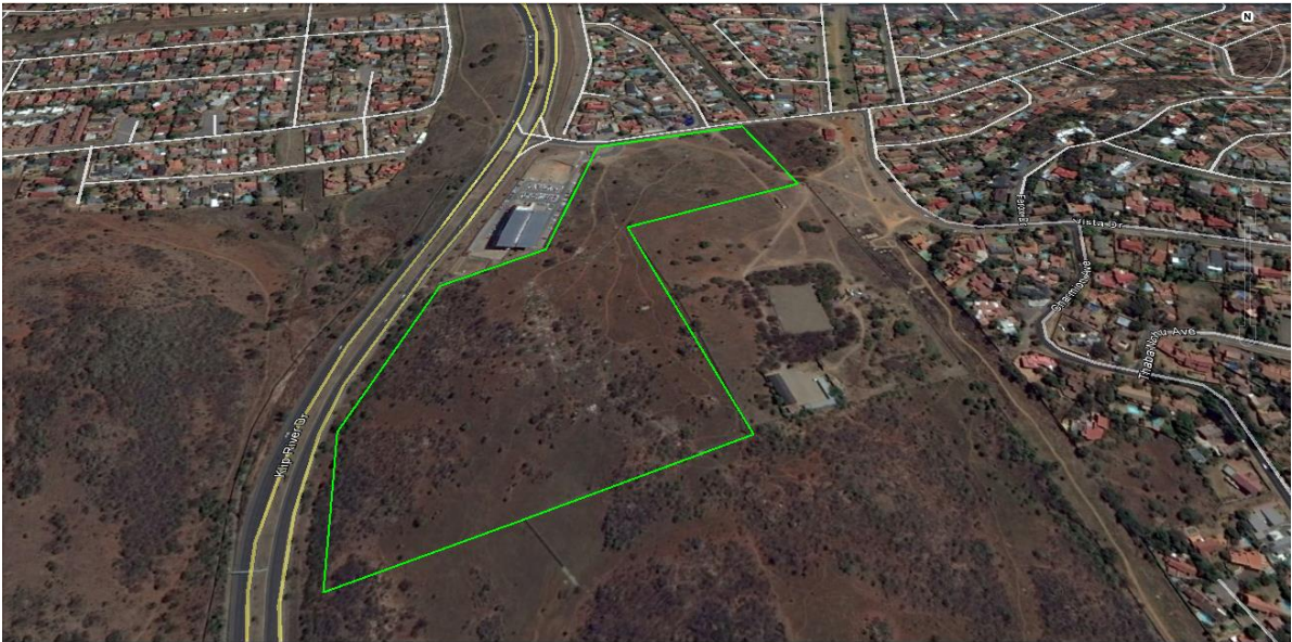
Figure 2: Aerial map