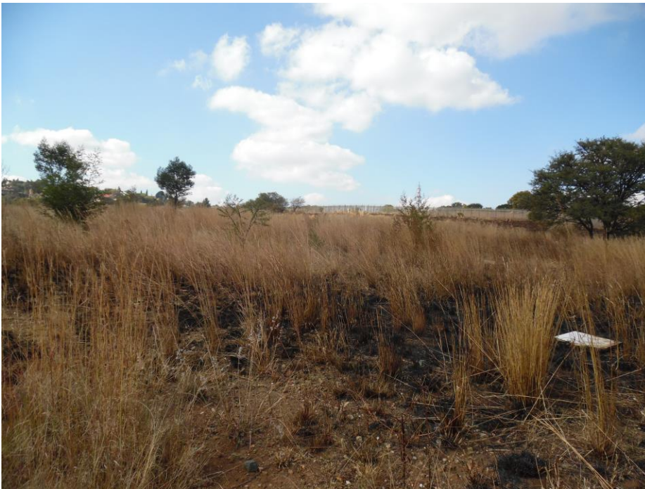
Figure 4: Site charateristics: Photograph taken towards the east