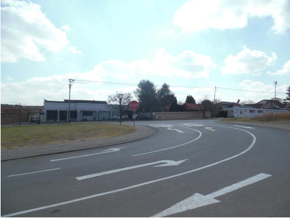
Figure 5: Site characteristics: Van Beek Avenue