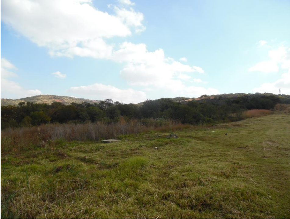
Figure 7: Site characteristics: Photograph taken from the east