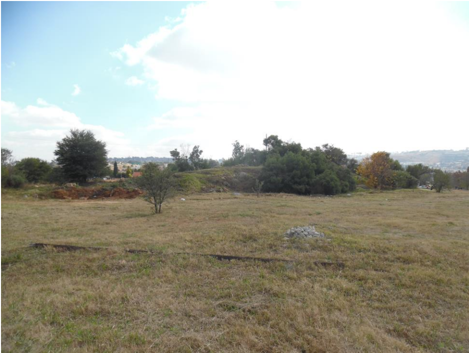
Figure 6: Site characteristics: North