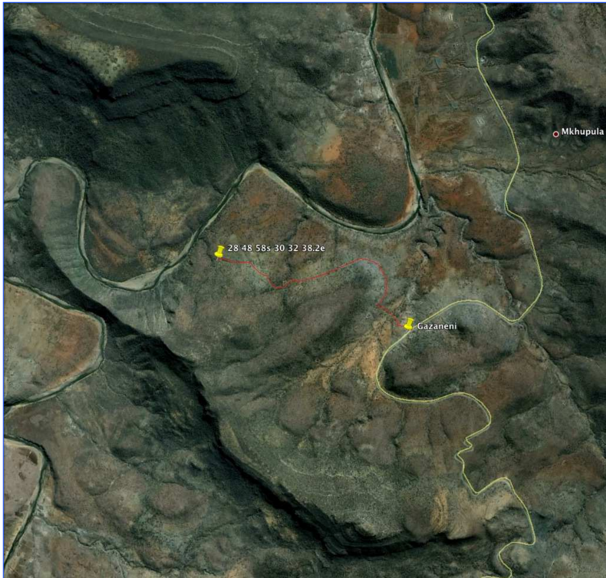
Figure 1. Aerial view of proposed upgrade