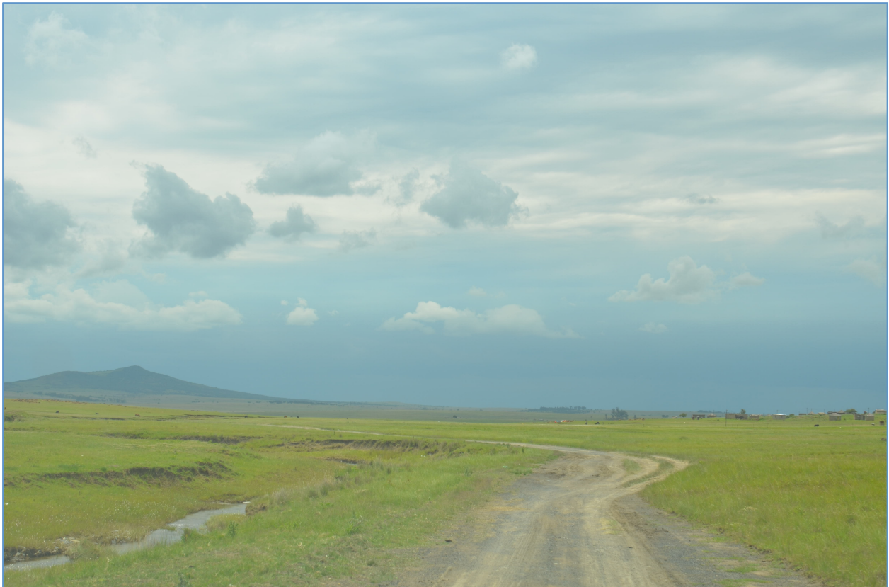
Figure 2. Proposed road upgrade

The cultural landscape in the study area is strongly associated with rural living and subsistence farming. There is still a strong community feeling here with many ancient traditions still surviving. The landscape of high, enclosing mountains and spectacular views also results in a feeling of isolation.