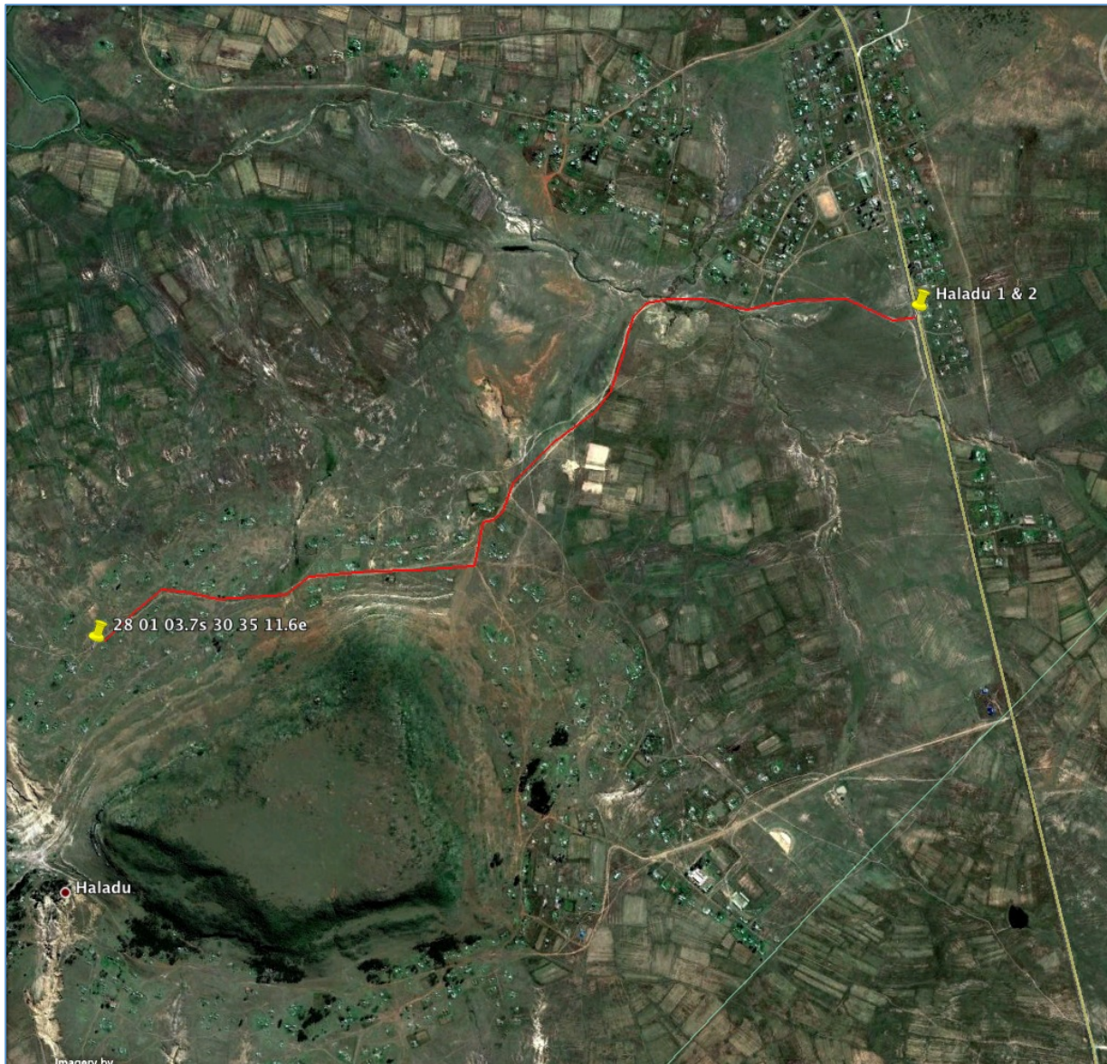
Figure 1. Aerial view of proposed upgrade