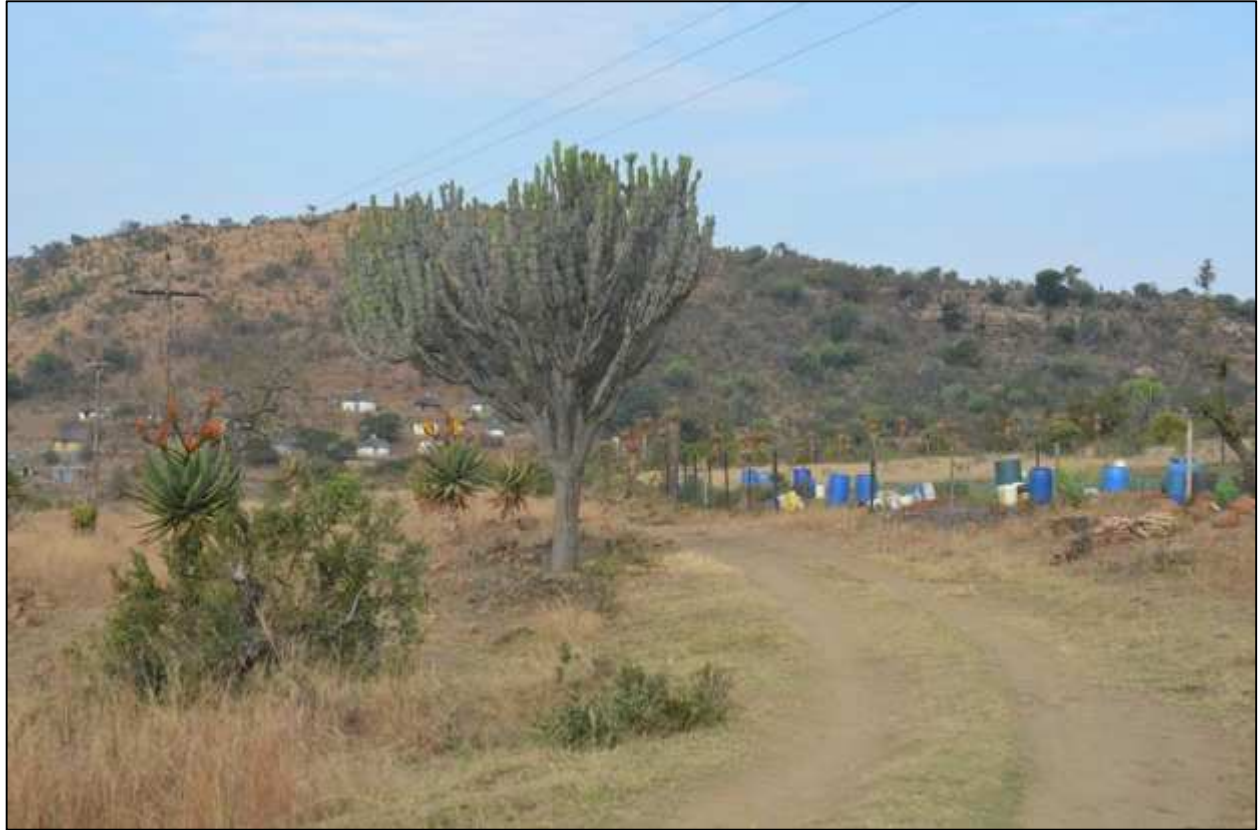
Figure 3. View towards the foot of the hill