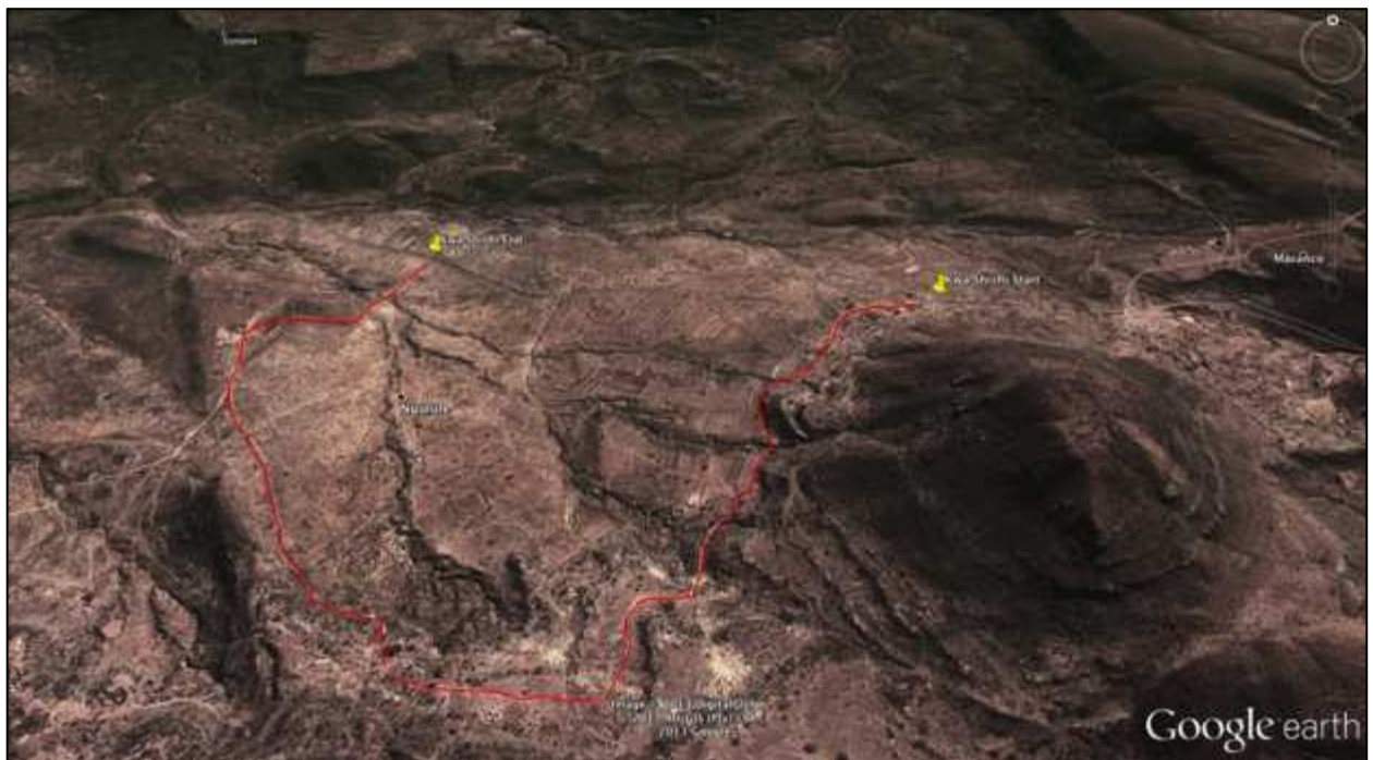
Figure 2. Aerial view of road segment