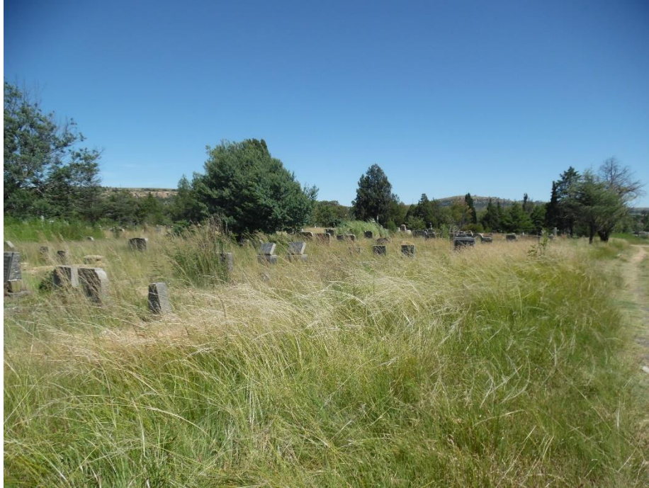
Photograph 18: Municipal cemetery situated near Study area 3 (will not be impacted on by the proposed development)

The municipal cemetery is situated near study area 3.