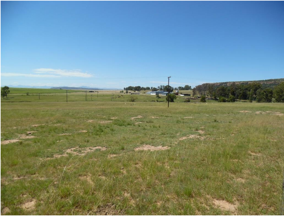
Photograph 13: Site characteristics (Study area 3)