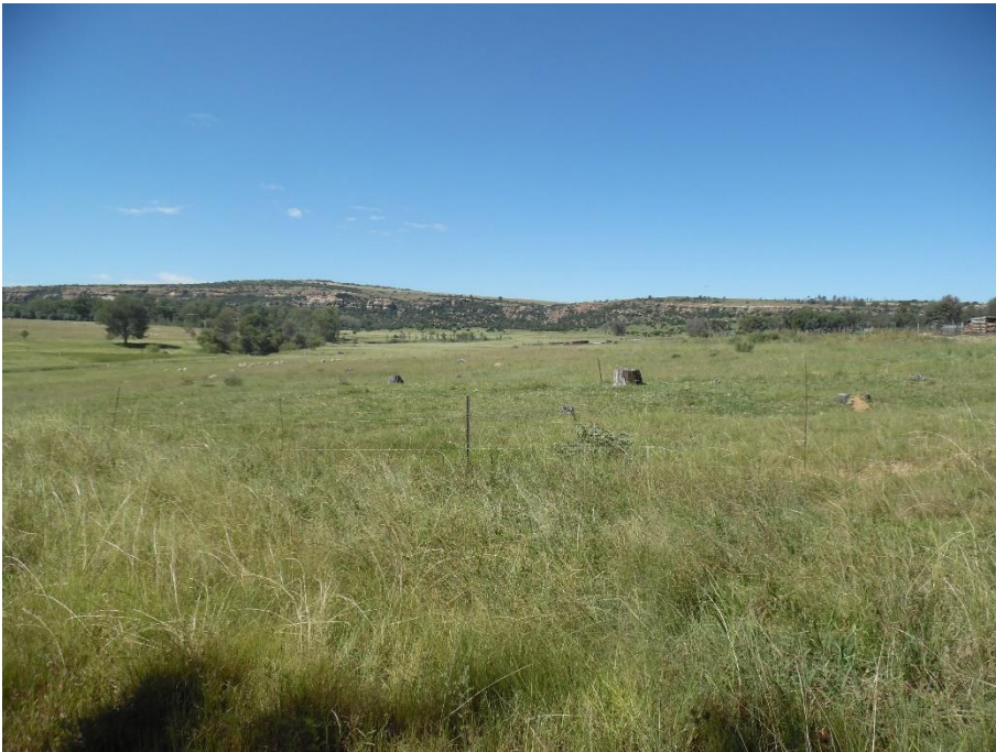
Photograph 10: Site characteristics (Study area 3)