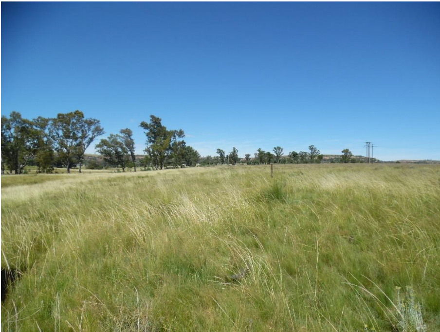
Photograph 16: Site characteristics (Study area 3)