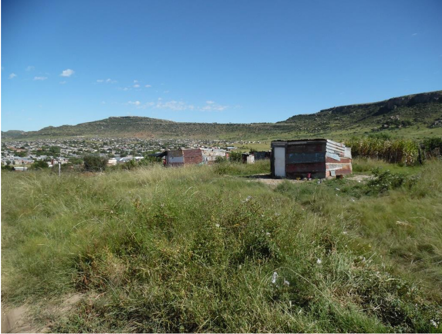
Photograph 5: Site characteristics (Study area 2)