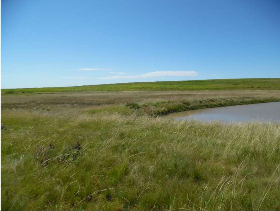
Photograph 15: Site characteristics (Study area 3)