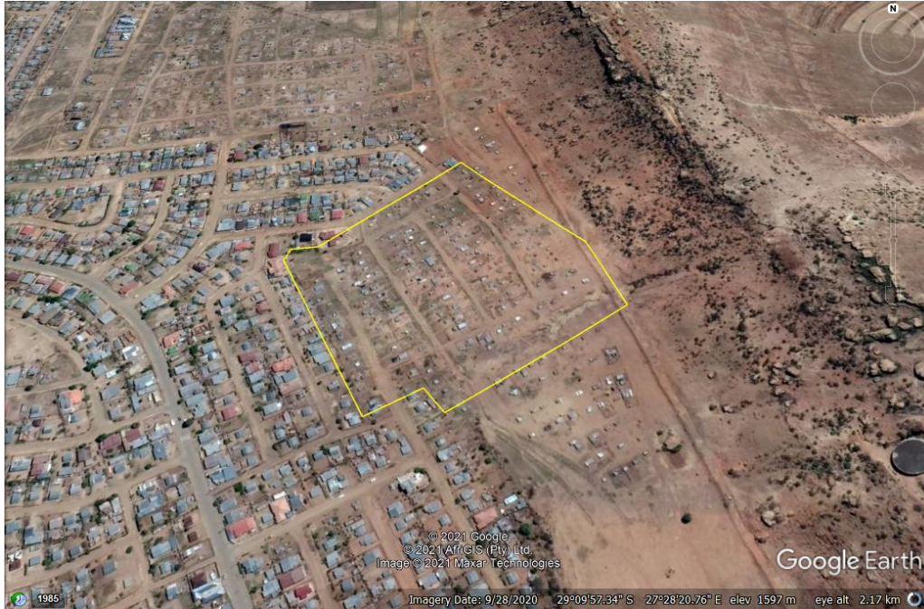
Figure 1: Study area 1 (Erf 1960)