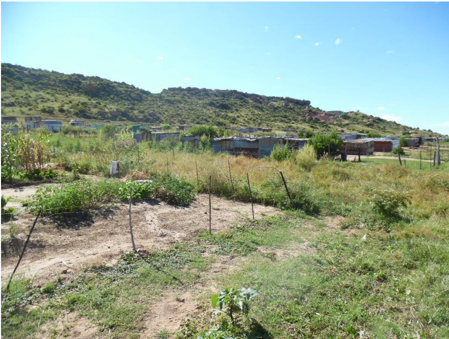
Photograph 8: Site characteristics (Study area 2)