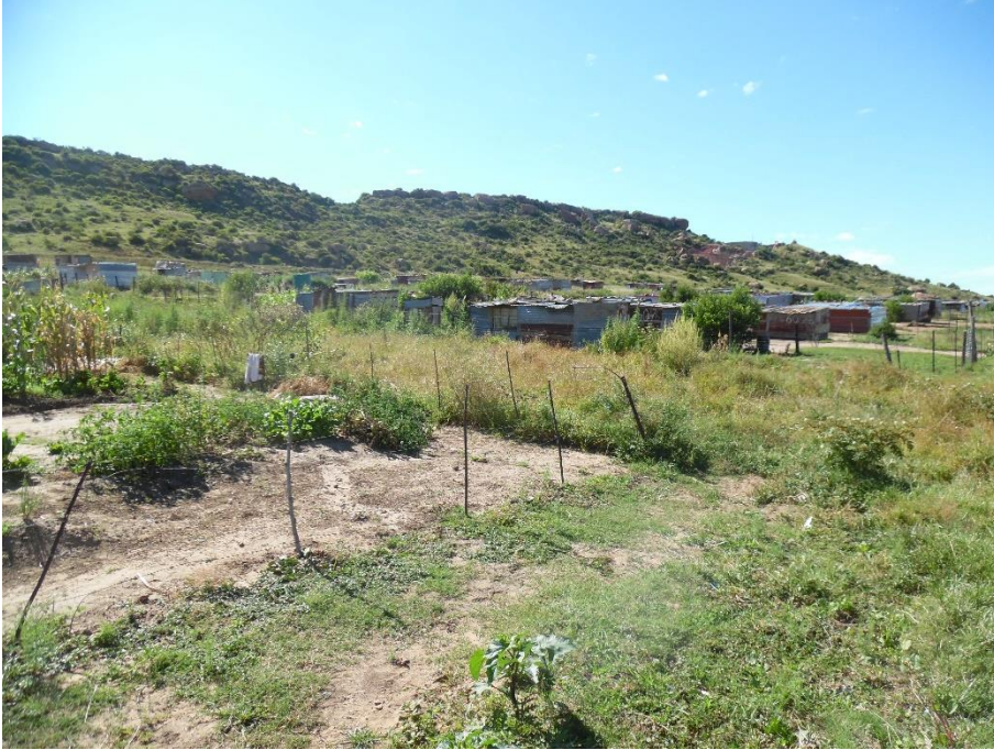
Photograph 3: Site characteristics (Study area 1)