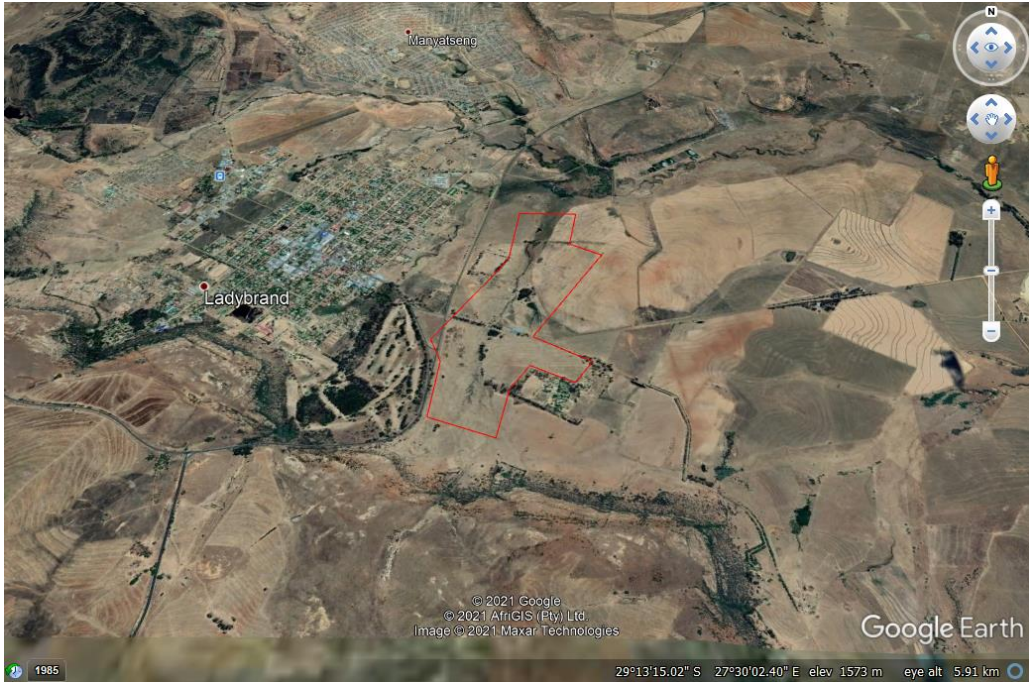
Figure 3: Study area 3 (Ptn 20/451)