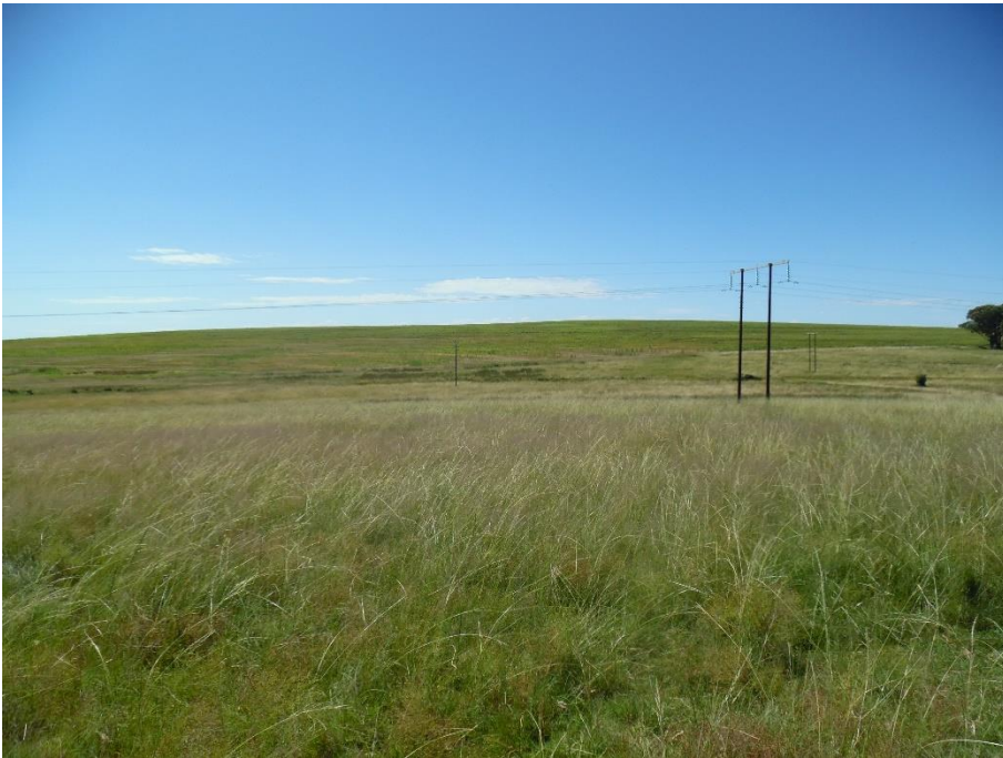
Photograph 14: Site characteristics (Study area 3)