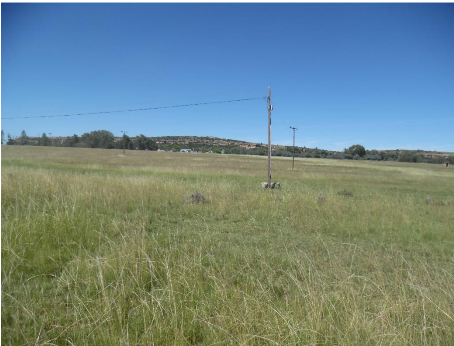
Photograph 12: Site characteristics (Study area 3)