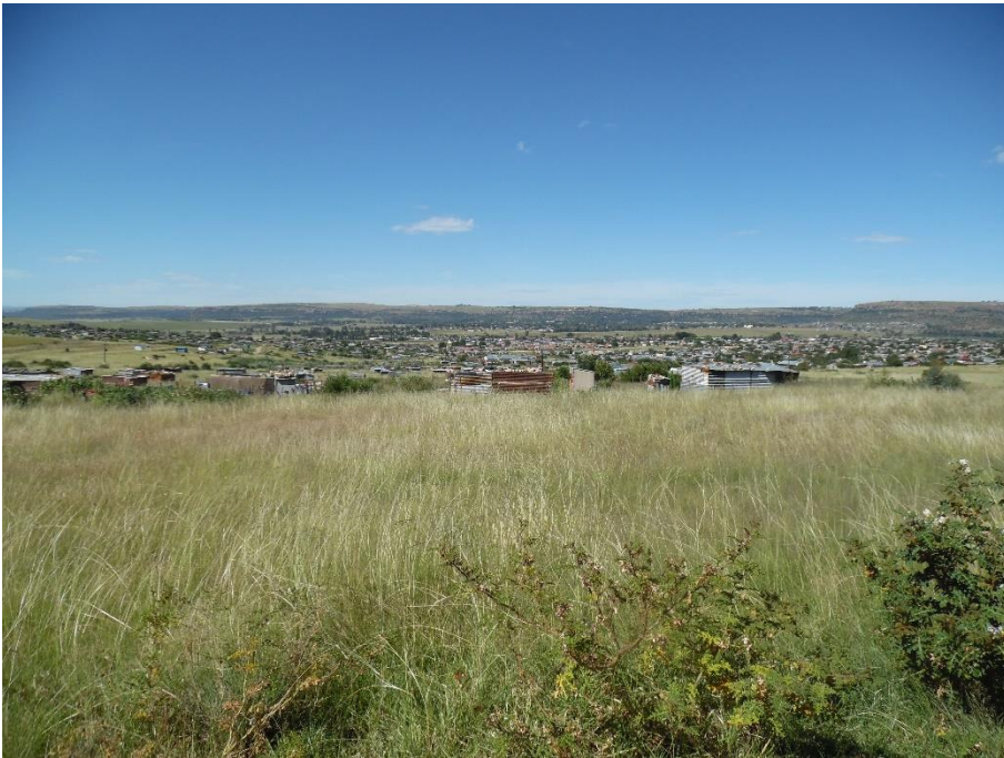
Photograph 6: Site characteristics (Study area 2)