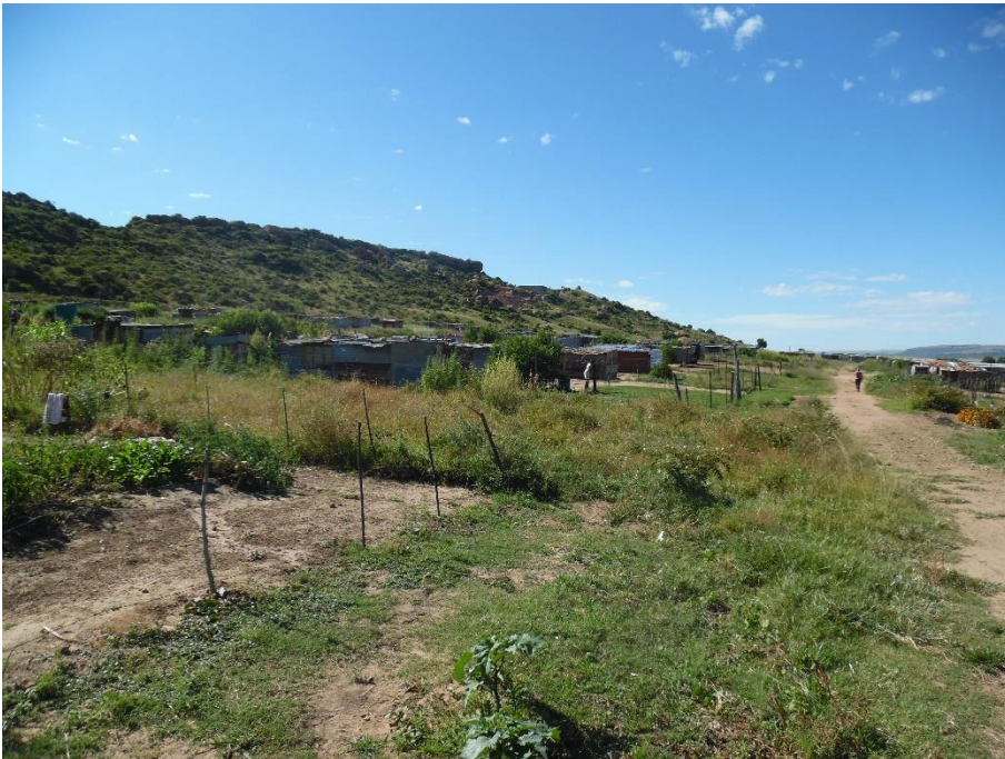
Photograph 2: Site characteristics (Study area 1)