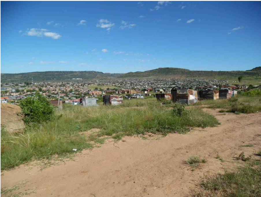
Photograph 4: Site characteristics (Study area 1)