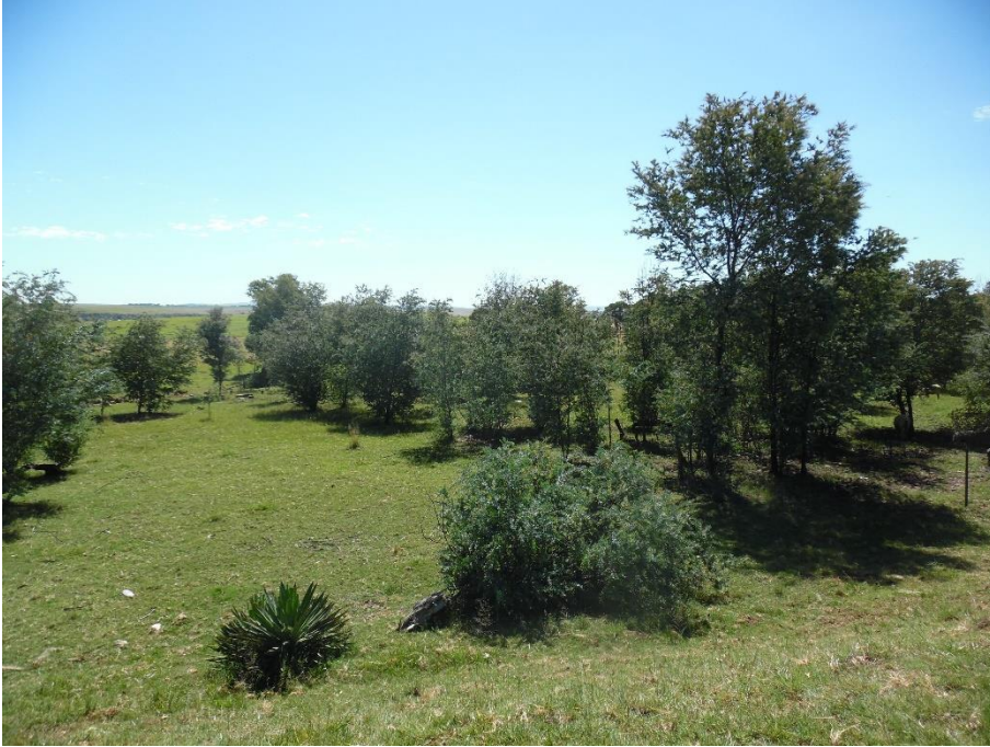
Photograph 11: Site characteristics (Study area 3)