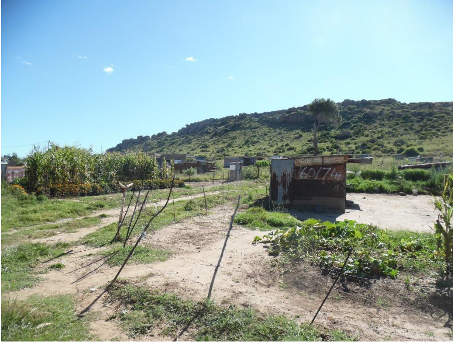
Photograph 1: Site characteristics (Study area 1)