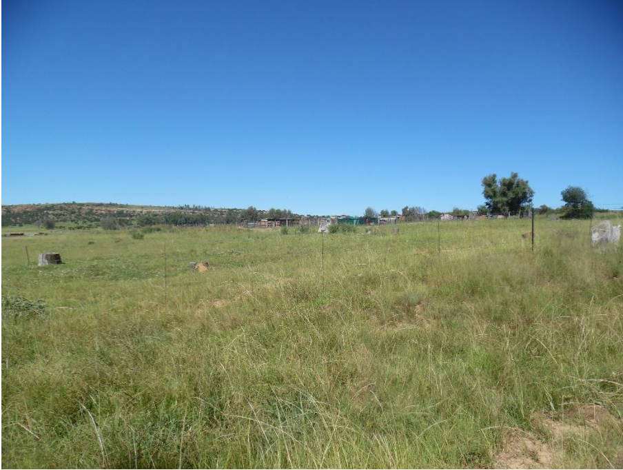
Photograph 9: Site characteristics (Study area 3)