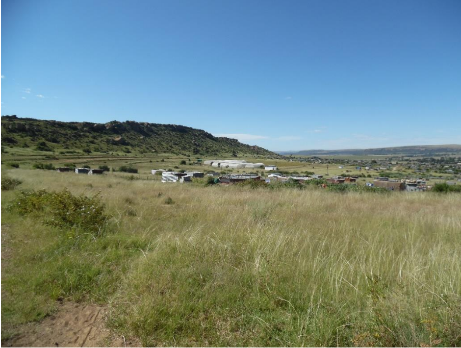
Photograph 7: Site characteristics (Study area 2)