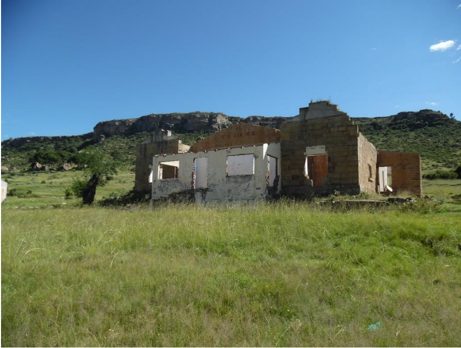
Photograph 17: Structure older than 60 years situated near study area 3: Will not be impacted on by proposed development

A structure older than 60 years is situated near study area 2. The municipal cemetery is located near study area 3.