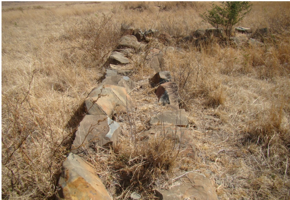
Fig. 8: The stone foundation of a cattle kraal. Most of the stones were carried away for building material by the local people. This feature is not within the study area.