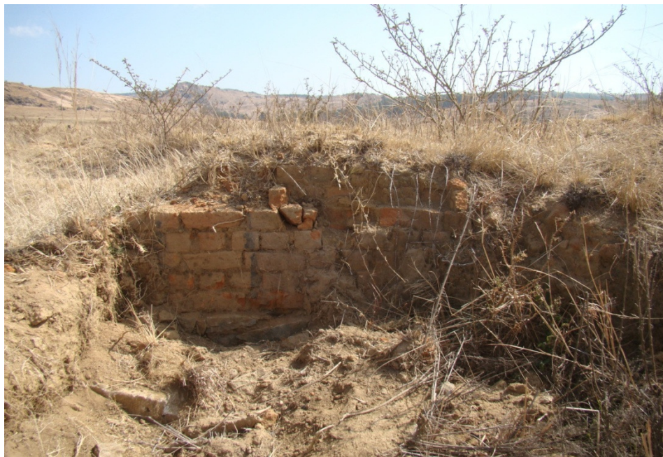
Fig. 10: The remains of a clay brick house. This feature is not within the study area.