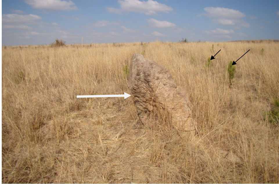
Fig. 9: One of the upright stones which were used as a fence post. This feature is not within the study area.