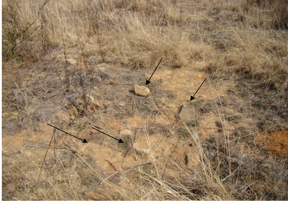
Fig. 5: The indistinct remains of a stone foundation which is not believed to have any significance.