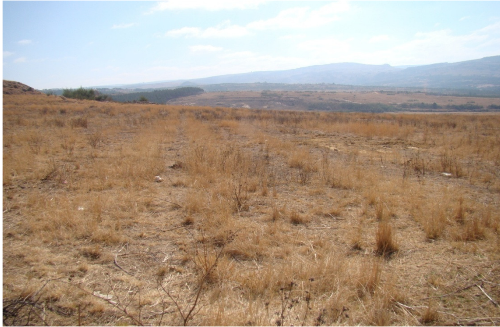
Fig. 1: General view of study area from south to north. Previous maize fields are still visible.