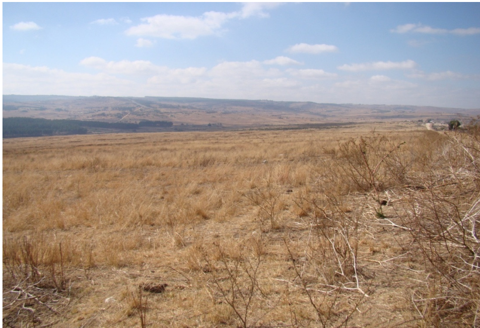
Fig. 2: General view of study area from west to east. Previous maize fields are still visible.