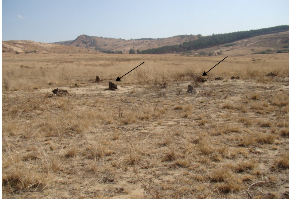
Fig. 3: General view of study area from east to west. Note the remains of old pine trees.