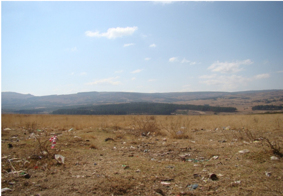
Fig. 4: Refuse is dumped along the residential area. The study area slopes towards the north east.