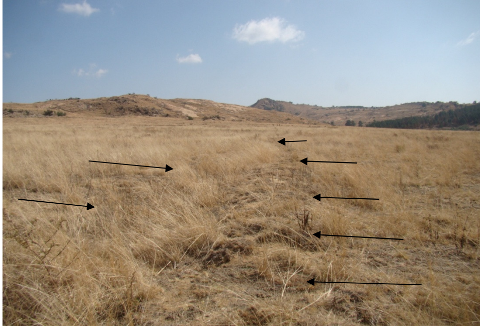
Fig. 7: A section of the earth canal which leads to the dam (Fig. 6), is in the study area.