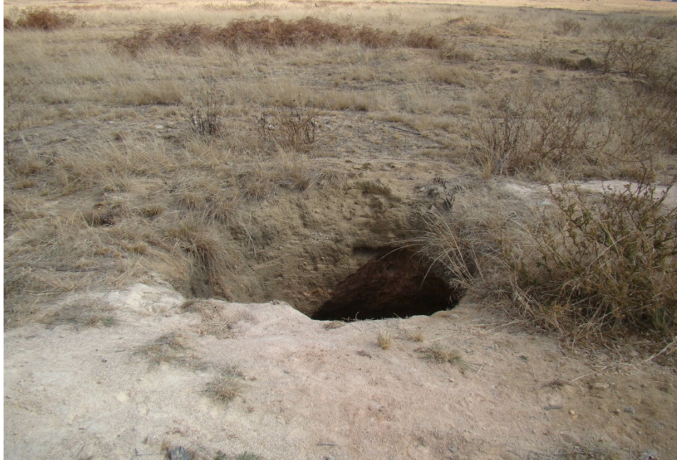
Fig. 11: Pits are dug on the property. The locals believe there is treasure buried at each feature.