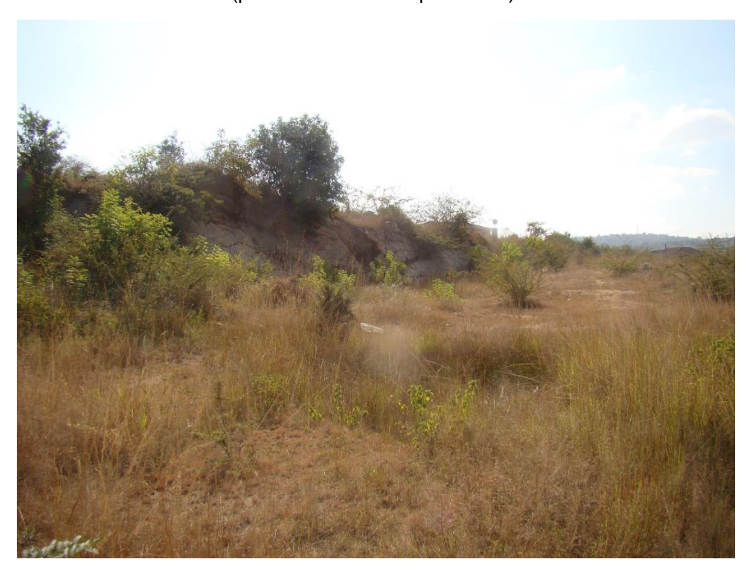
Fig. 6: The steep rocky ridge is clearly visible in this photograph.