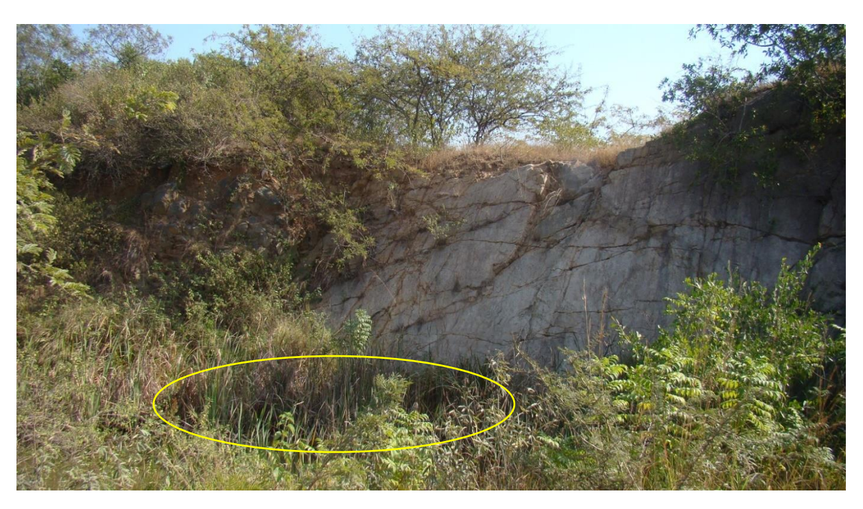
Fig. 7: Detail of the steep rocky ridge with a small dam at its foot (see oval).