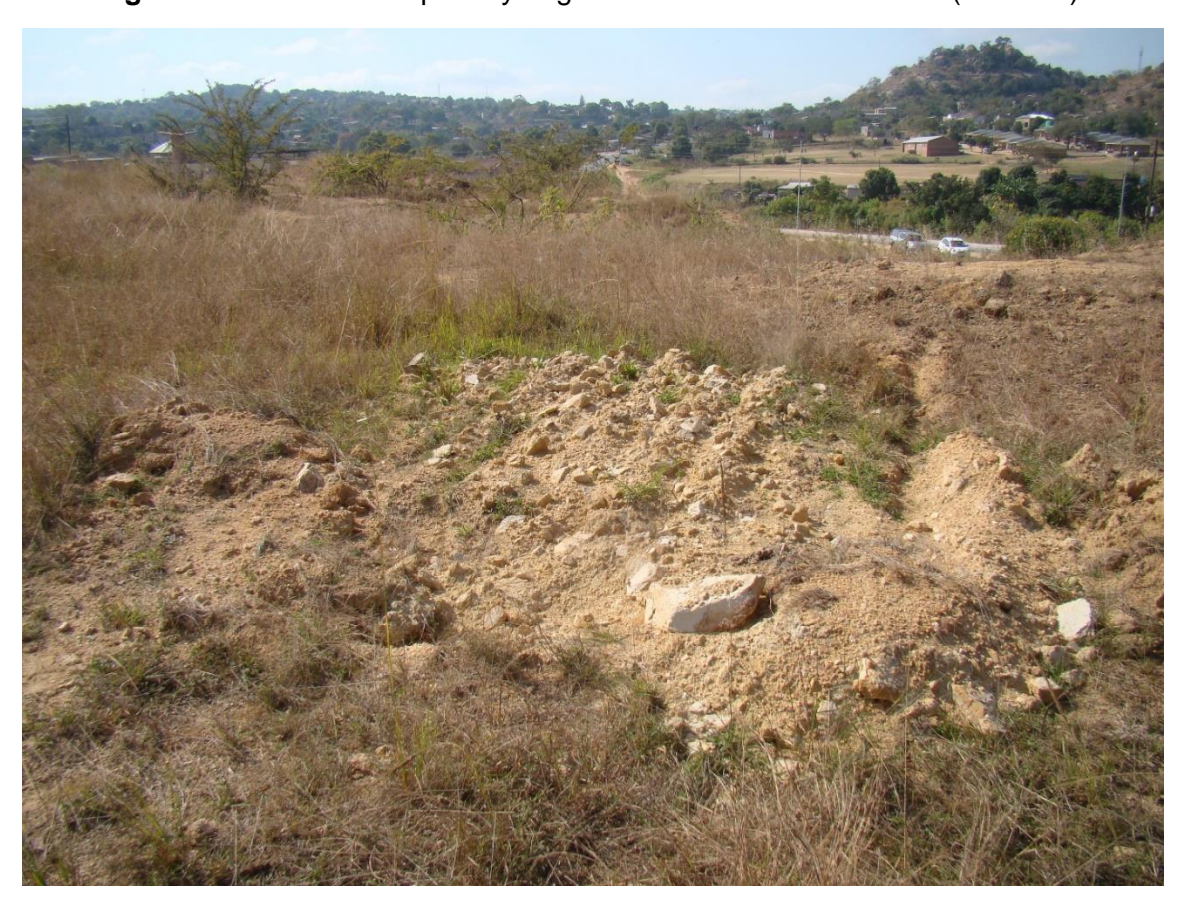
Fig. 8: Test pits for geotechnical investigation were scrutinized for any possible archaeological remains, but none were found.