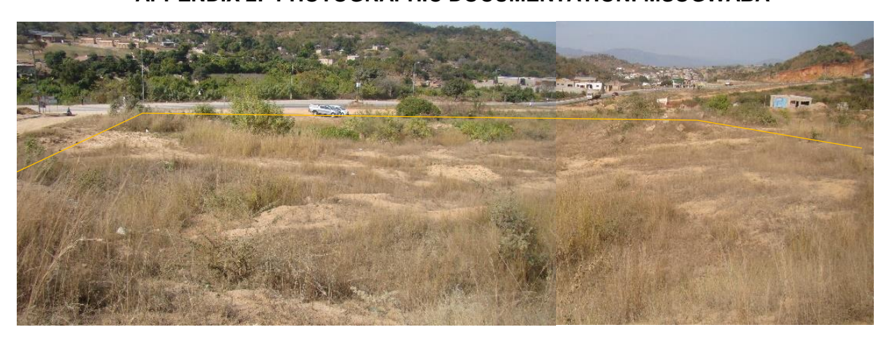
Fig. 1: Entire view of the Msogwaba study area facing east towards the tarred road (Photo taken from the western boundary, the rocky ridge). The study area is an extinct borrow pit, with rocky patches in between.