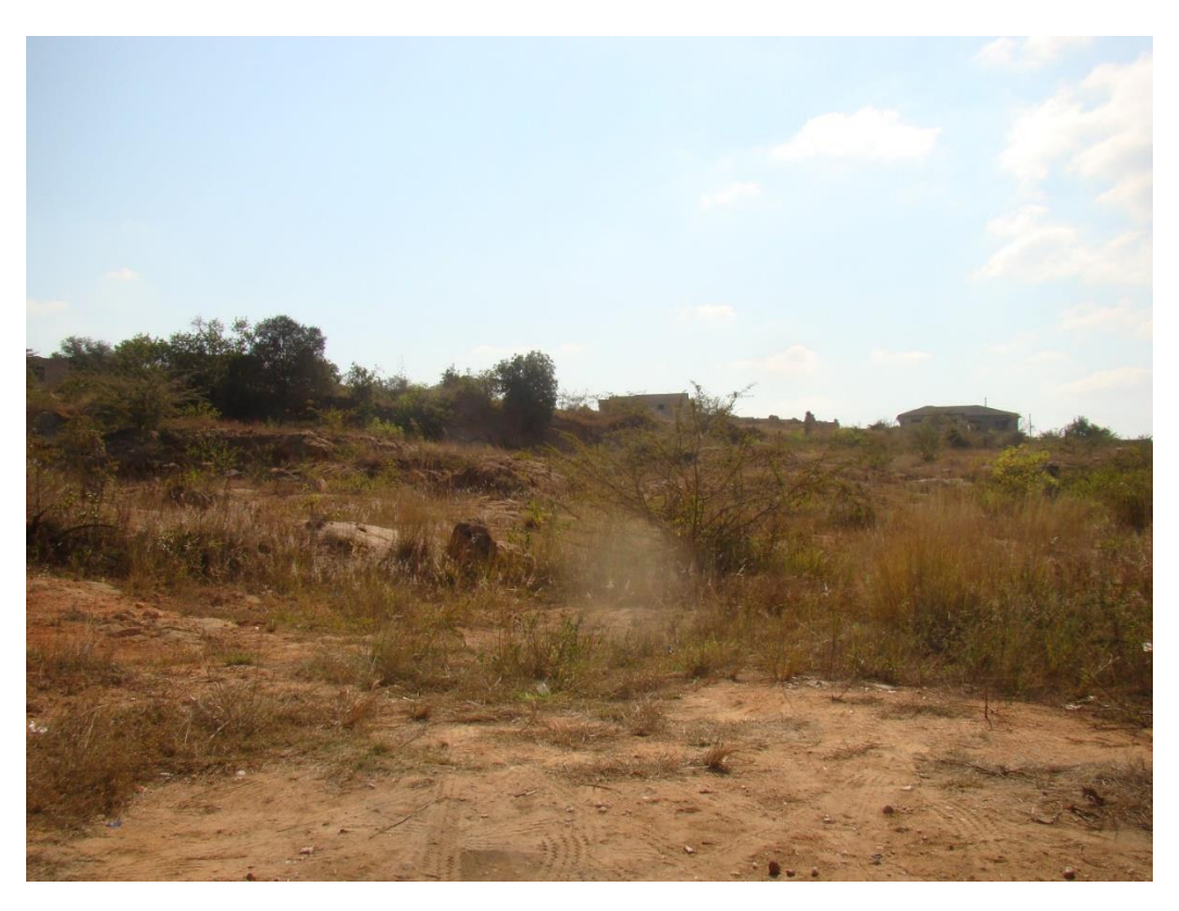
Fig. 5: A general view to the rocky ridge which forms the western boundary of the study area (points G to A on Map 7 in text).