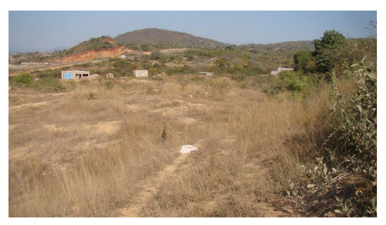
Fig. 3: A view to the south (Points D & E on Map 7, in text). The houses are outside of the study area.