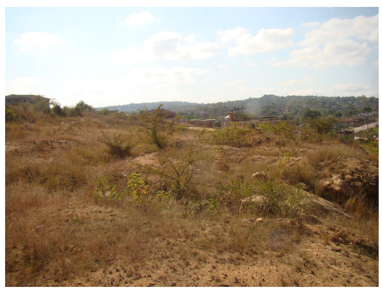
Fig. 2: A view to the north (Points A, B & C on Map 7 in text). The houses are outside of the study area.