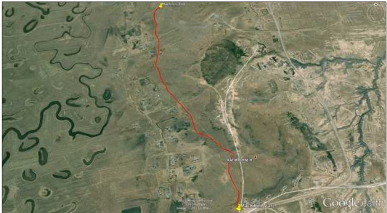
Figure 2. Aerial view of proposed upgrade