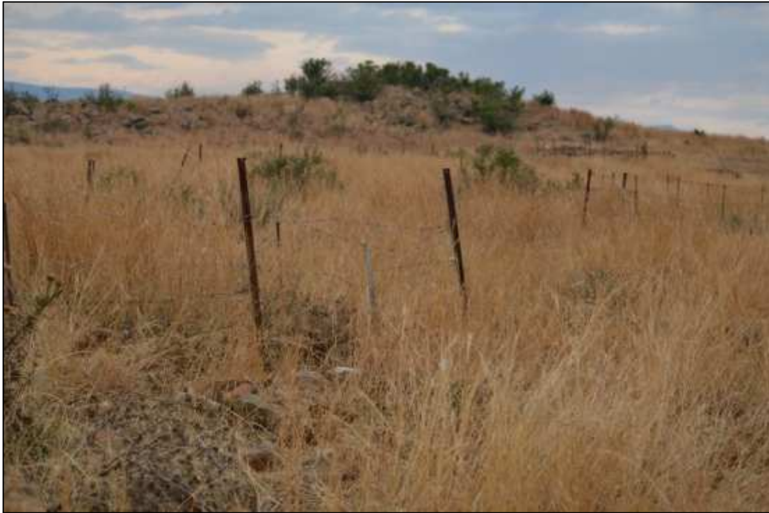
Figure 6. Graveyard close to road alignment

The construction of the existing road has resulted in damage to any possible previous sites of heritage significance. It is not anticipated that any further sites will be affected. The graveyard is easily identified on the slight rise to the north of the proposed alignment.