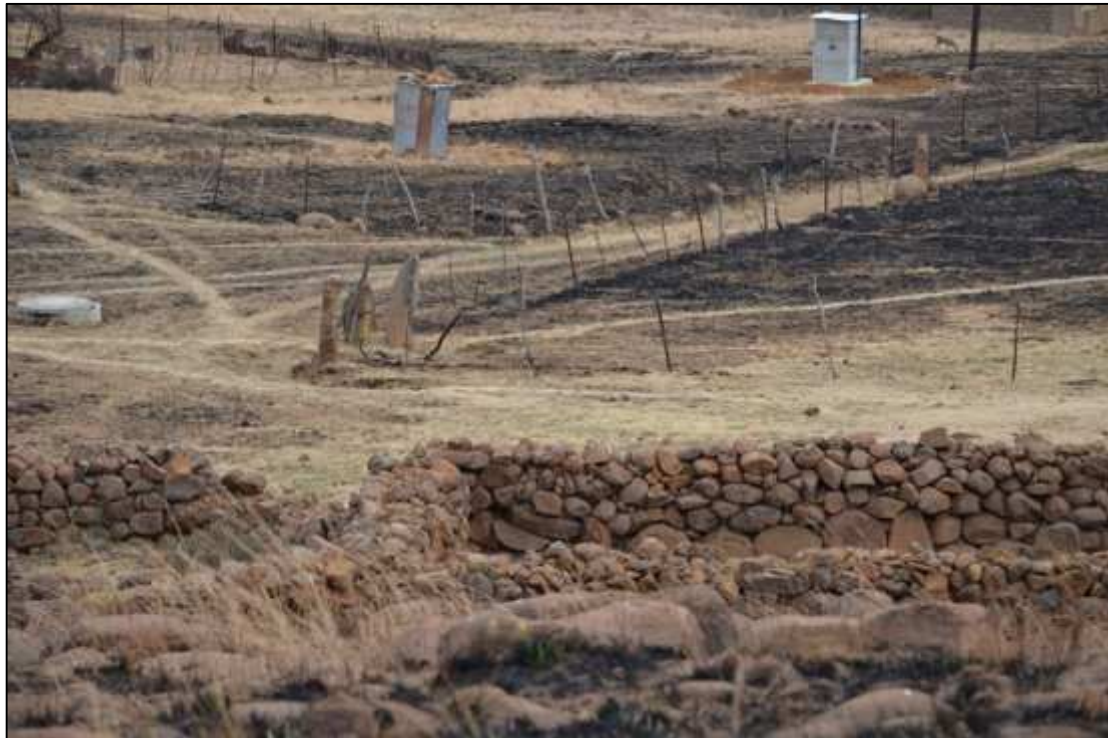
Figure 4. Recent stone walling close to road