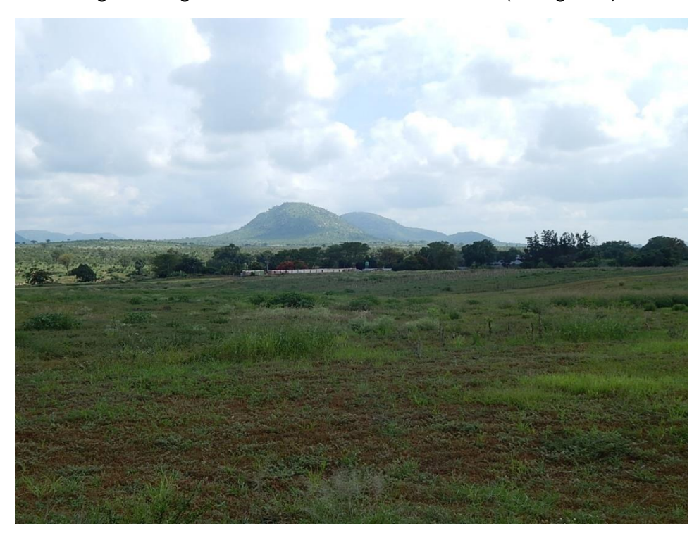
Fig. 16: A general view of the eastern section (facing north towards the Crocodile river and Kruger National Park).