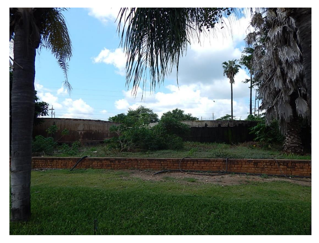
Fig. 19: Large water reservoirs are visible next to the farm residence.