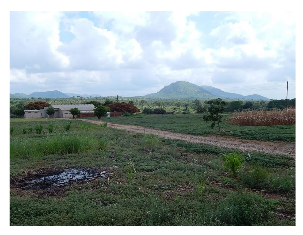
Fig. 24: View towards the north (NKP). Farm infrastructure is visible in the north together with workers accommodation.