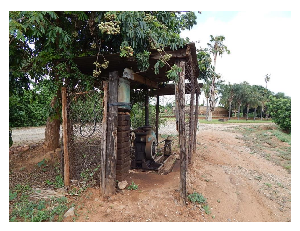
Fig. 21: Another pump for use on the farm.