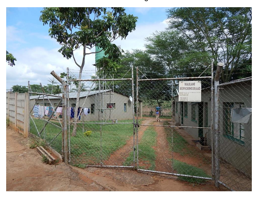
Fig. 30: A small section in the north-east still belongs to the Malelane Irrigation board, and is currently excluded from the study area.