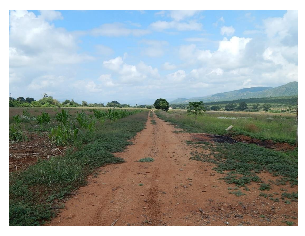
Fig. 12: Another view of the middle section facing west, the earth canal is to the right of the road.