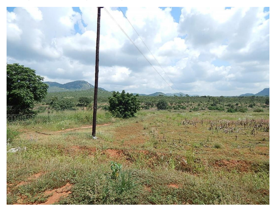
Fig. 1: The western boundary of the project area facing the Crocodile river (north). The cultivated lands and earth canal is visible in the foreground.