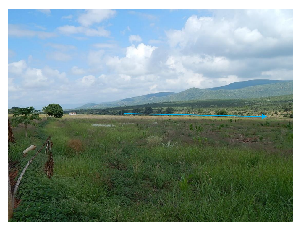
Fig. 7: The middle section in the east, facing north-west. The crocodile river is indicated by the blue line.