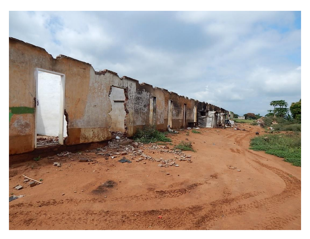
Fig. 27: Previous farm workers accommodation (compound) in the northern section, which is now derelict.