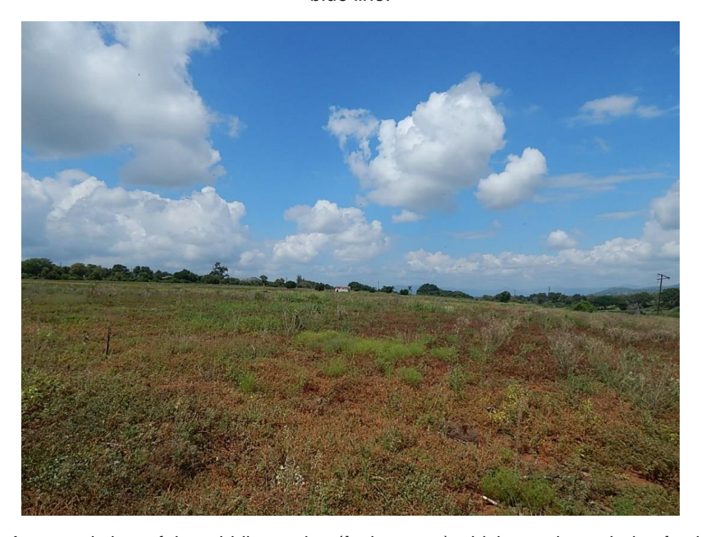
Fig. 8: A general view of the middle section (facing west) which consist entirely of cultivated lands.