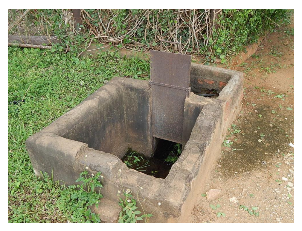
Fig. 23: A few small weirs are visible near the farm residence, to regulate water into the canals.