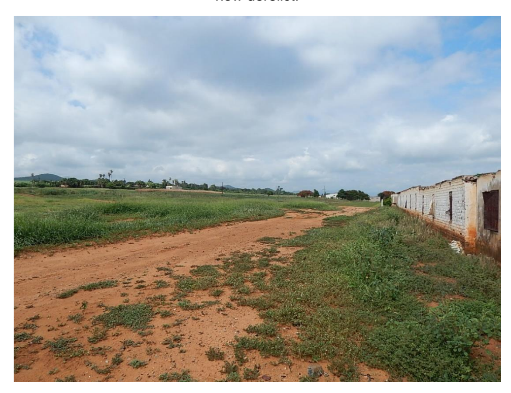
Fig. 28: The back of the farm workers accommodation in the eastern section of the study area (facing west).