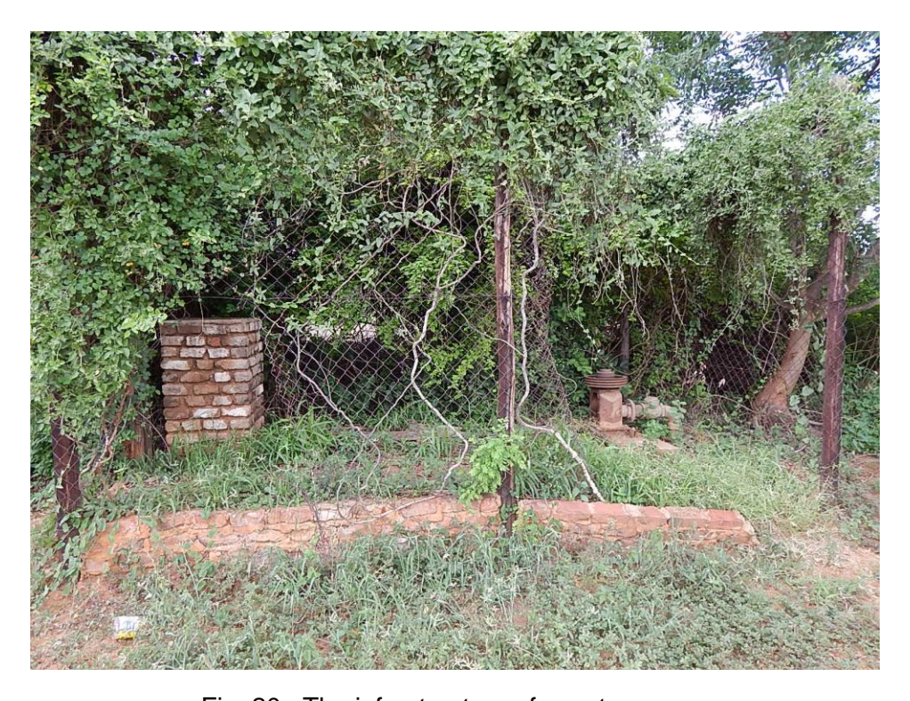
Fig. 20: The infrastructure of a water pump.