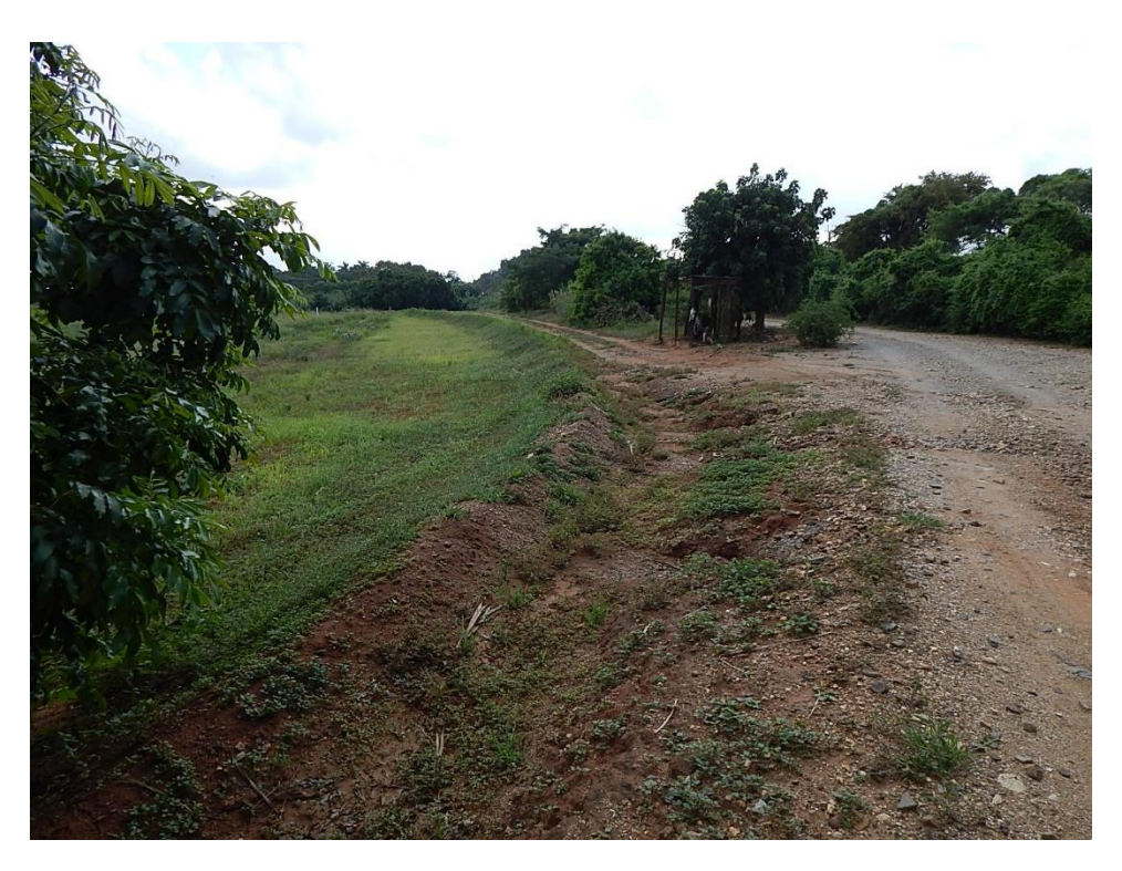
Fig. 22: The earth canal in the eastern section is visible next to the gravel road, facing east.