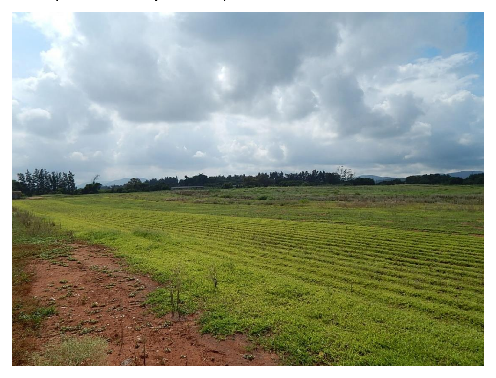
Fig. 15: A general view of the eastern section (facing east).