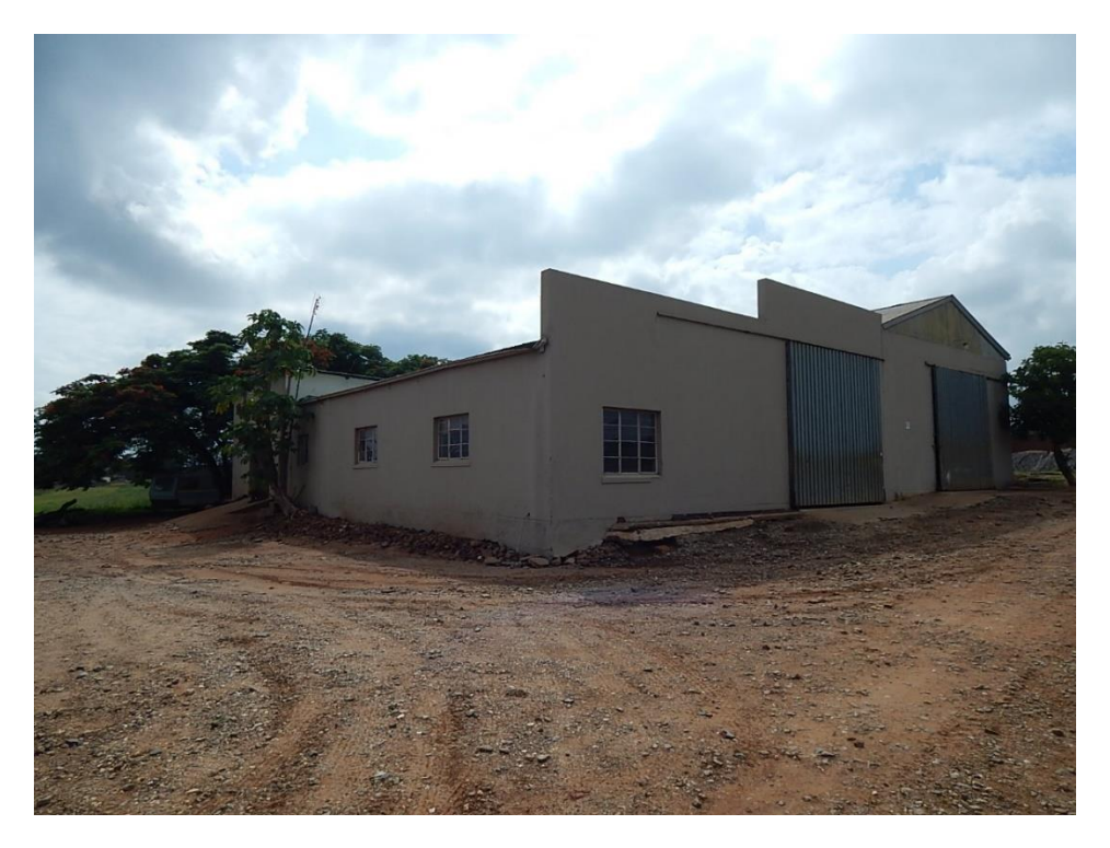
Fig. 25: The farm sheds in the north, and near the banks of the Crocodile river.