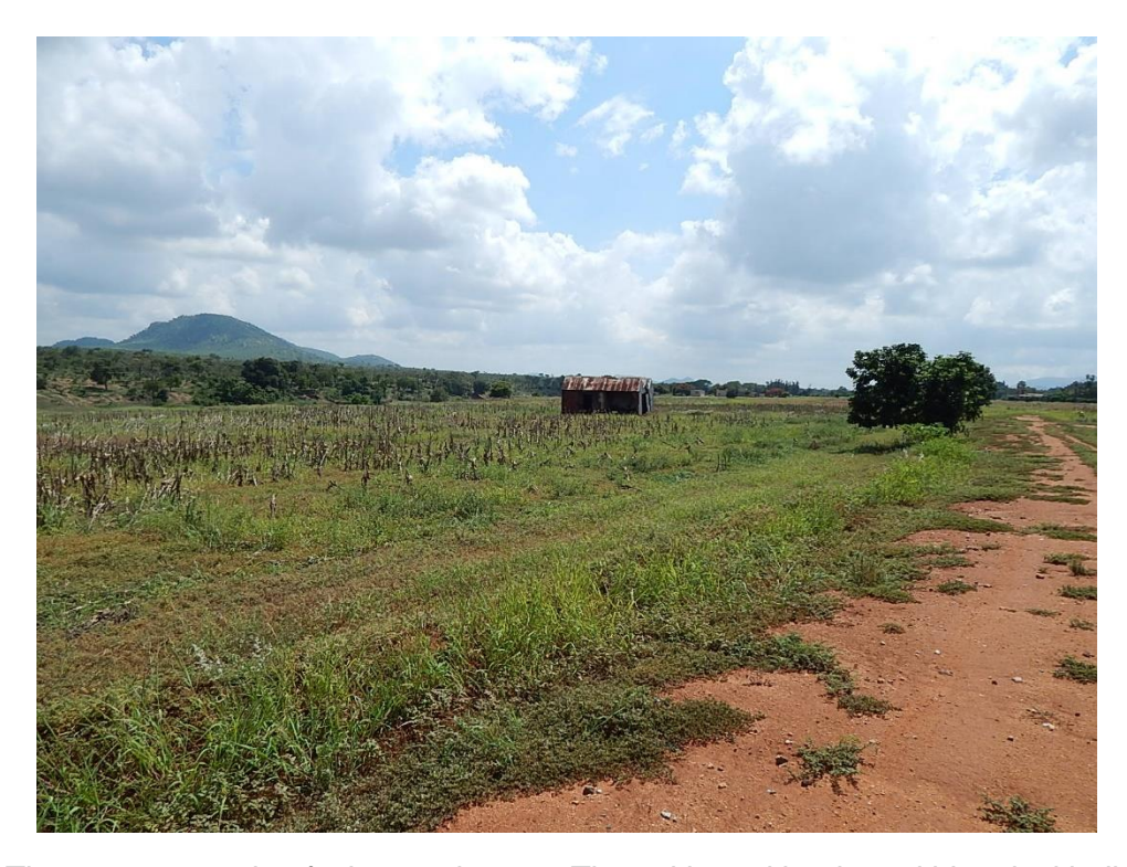
Fig. 4: The western section facing north east. The cultivated lands and historical building are visible.