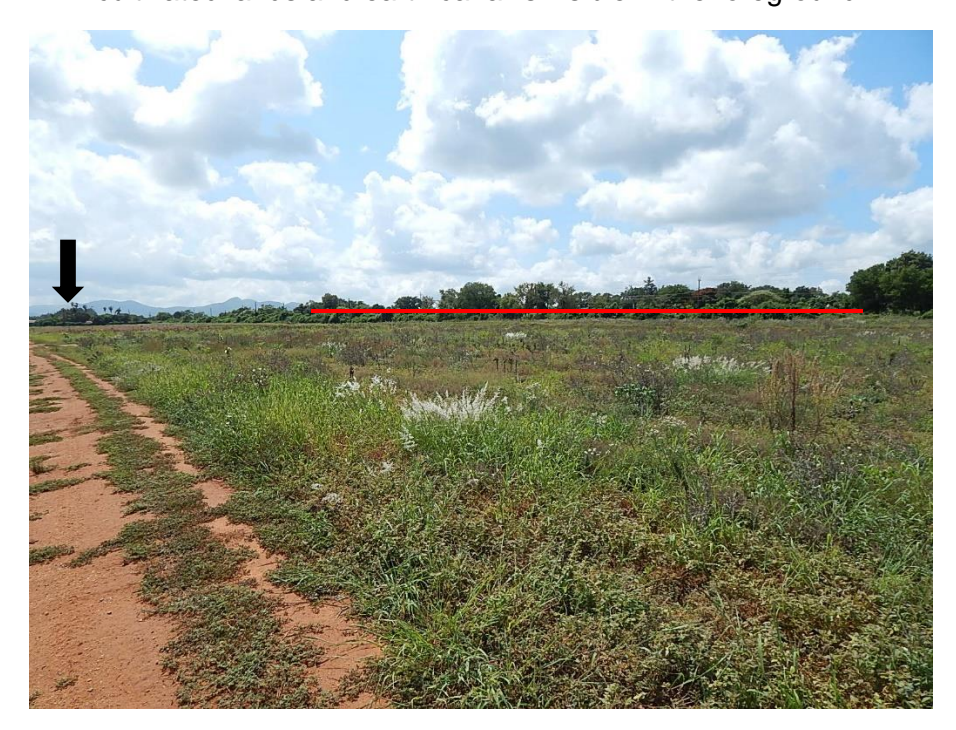
Fig. 2: The western section facing south-east of the railway line (red line), and farm residence (arrow). The (fallow) cultivated lands are visible in the foreground.