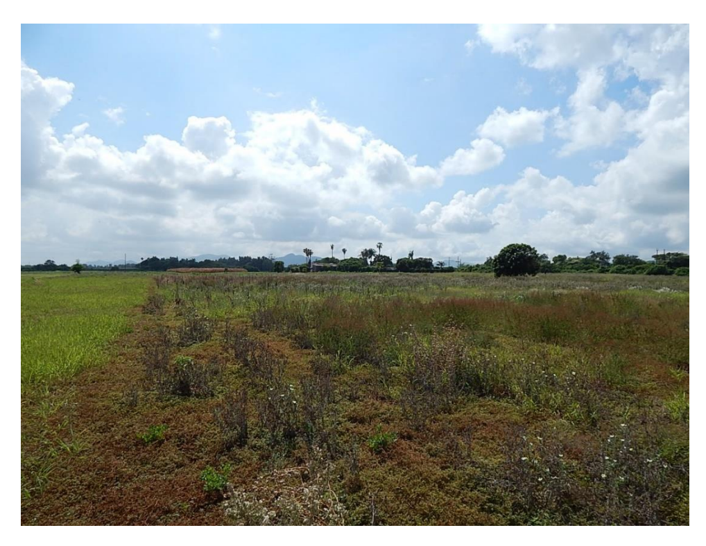
Fig. 10: A general view of the middle section (facing east), towards the farm residence.