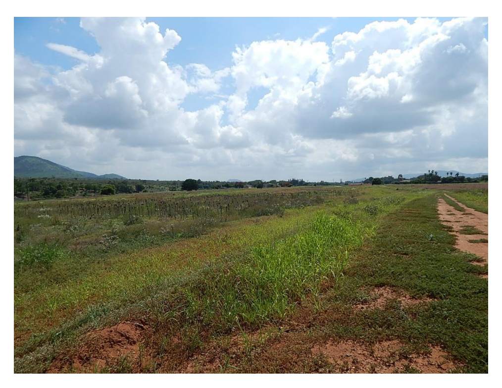
Fig. 11: The middle section, with the earth canal visible next to the road.