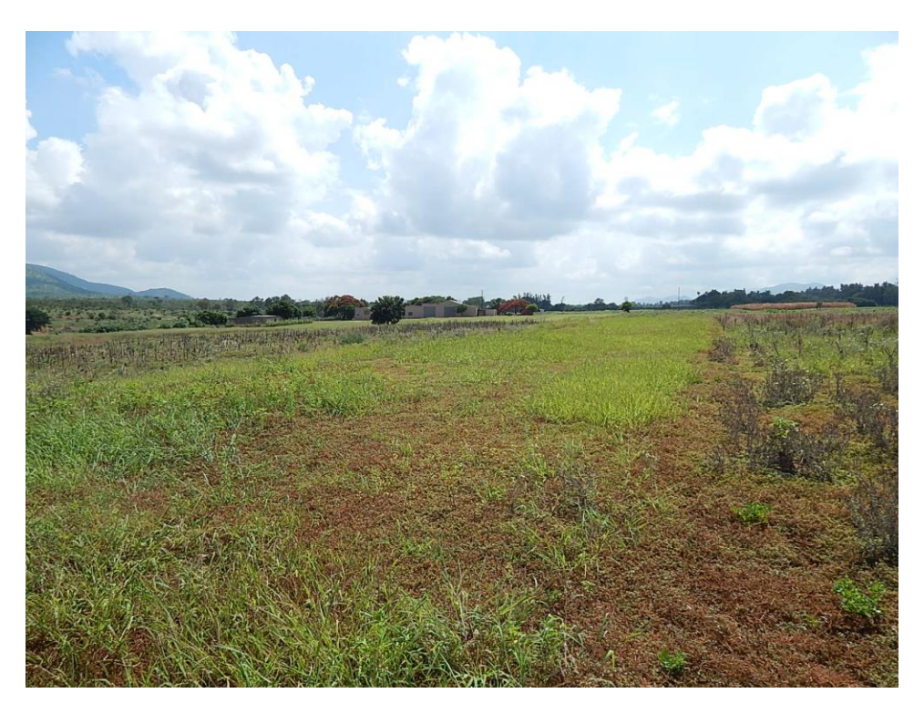
Fig. 9: A general view of the middle section (facing east), towards the sheds.