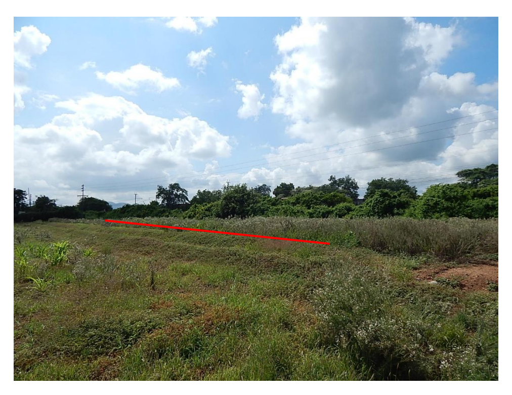
Fig. 13: The middle section facing south towards the railway line. An earth canal is visible (red line).