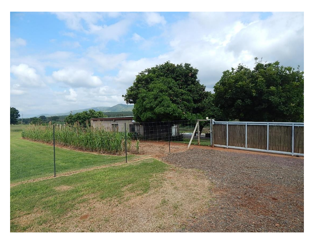
Fig. 26: Workers accommodation on the banks of the Crocodile River in the north.