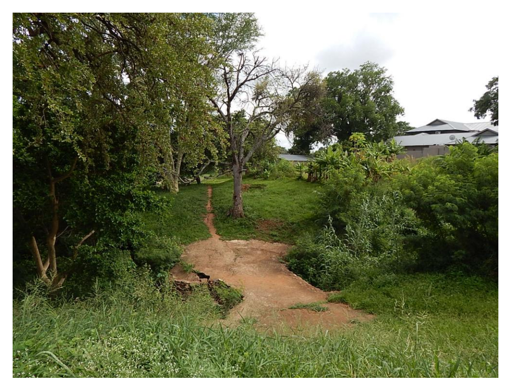
Fig. 29: The eastern section of the farm. A drainage line is visible in the foreground, with a concrete bridge to cross over to the other side. A Middle Stone Age implement was found within the drainage line.