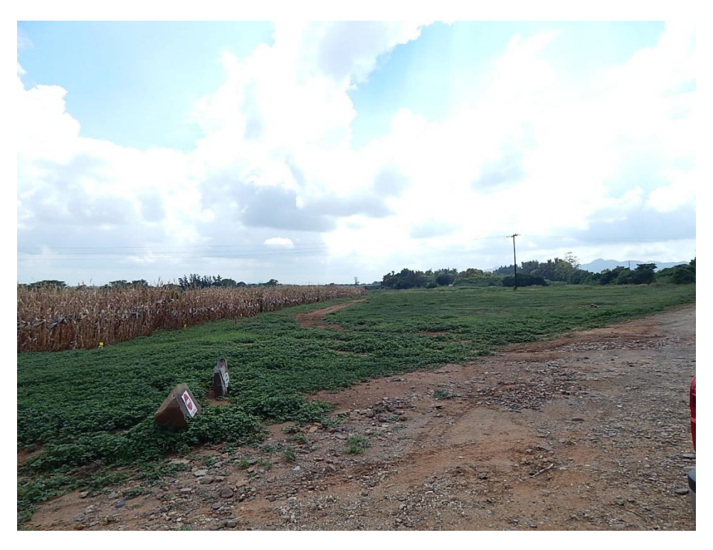
Fig. 17: A general view of the eastern section, in the south (facing east).