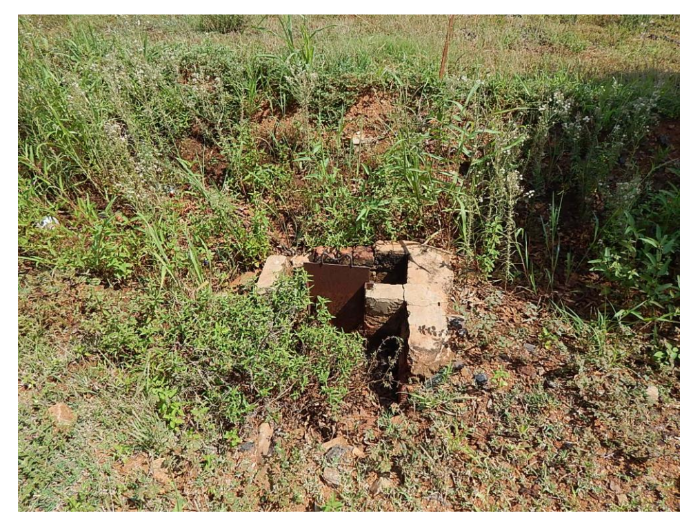
Fig. 14: Several sluices are visible within the earth canal to regulate water, on the study area.