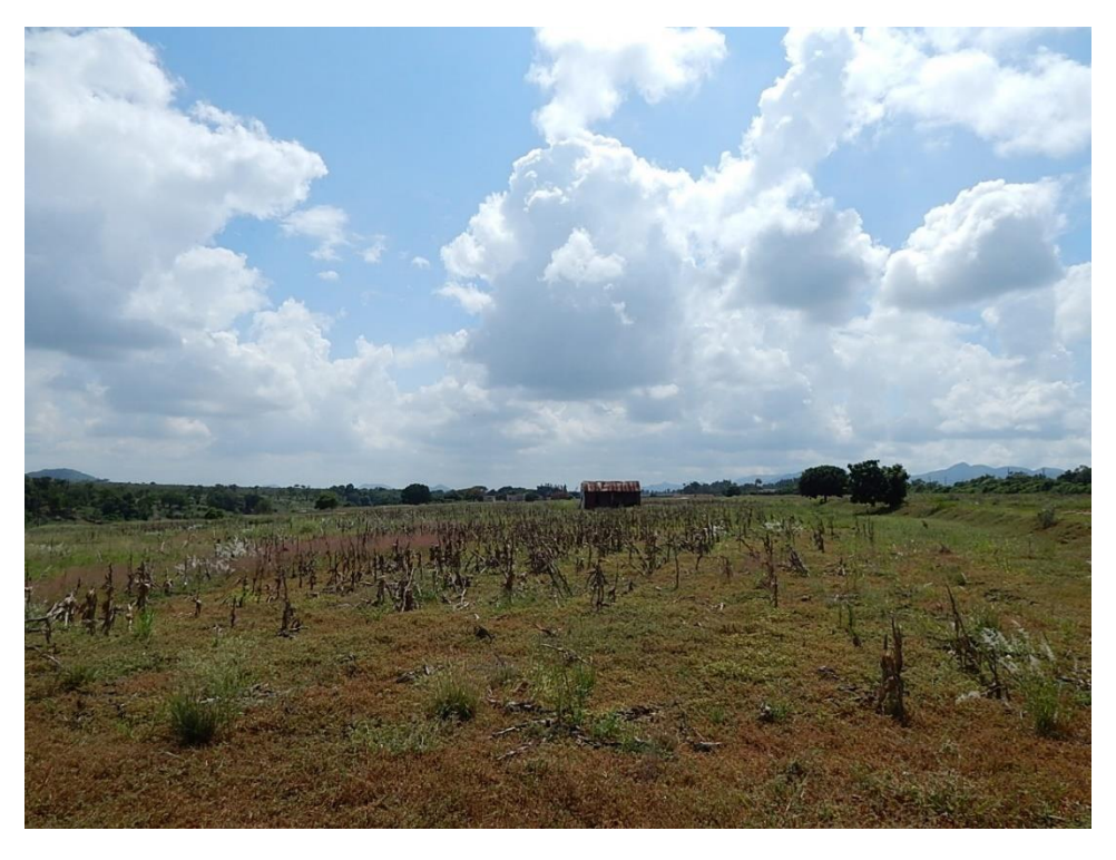
Fig. 3: The western section, facing east. The historical building is visible in a distance.