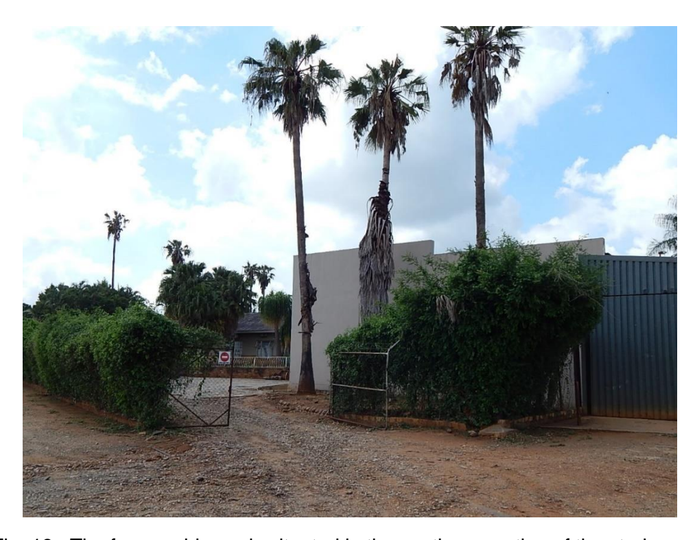
Fig. 18: The farm residence is situated in the southern section of the study area.