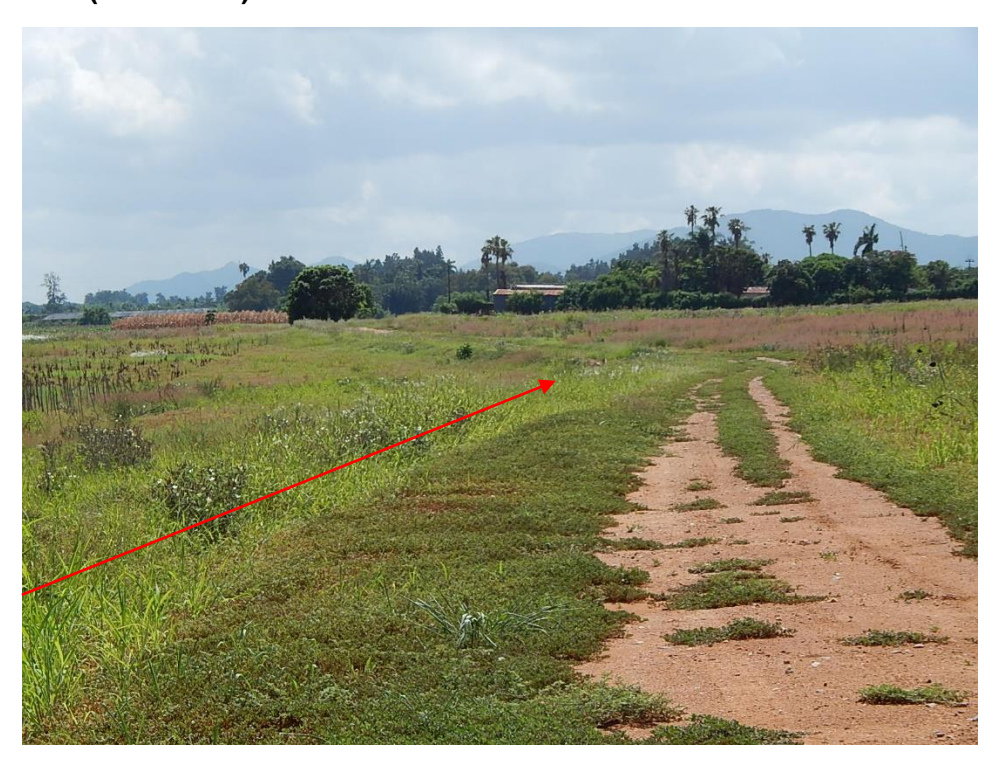
Fig. 6: The middle section in the west, facing east towards the farm residence. The canal follows the road contour and is visible to the left (red line).