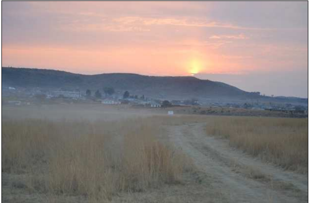
Figure 3. General landscape