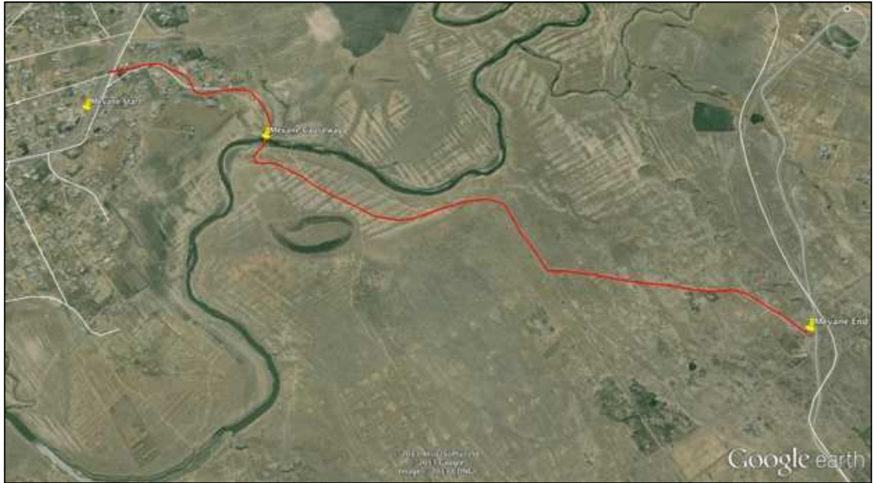
Figure 2. Aerial view of study area