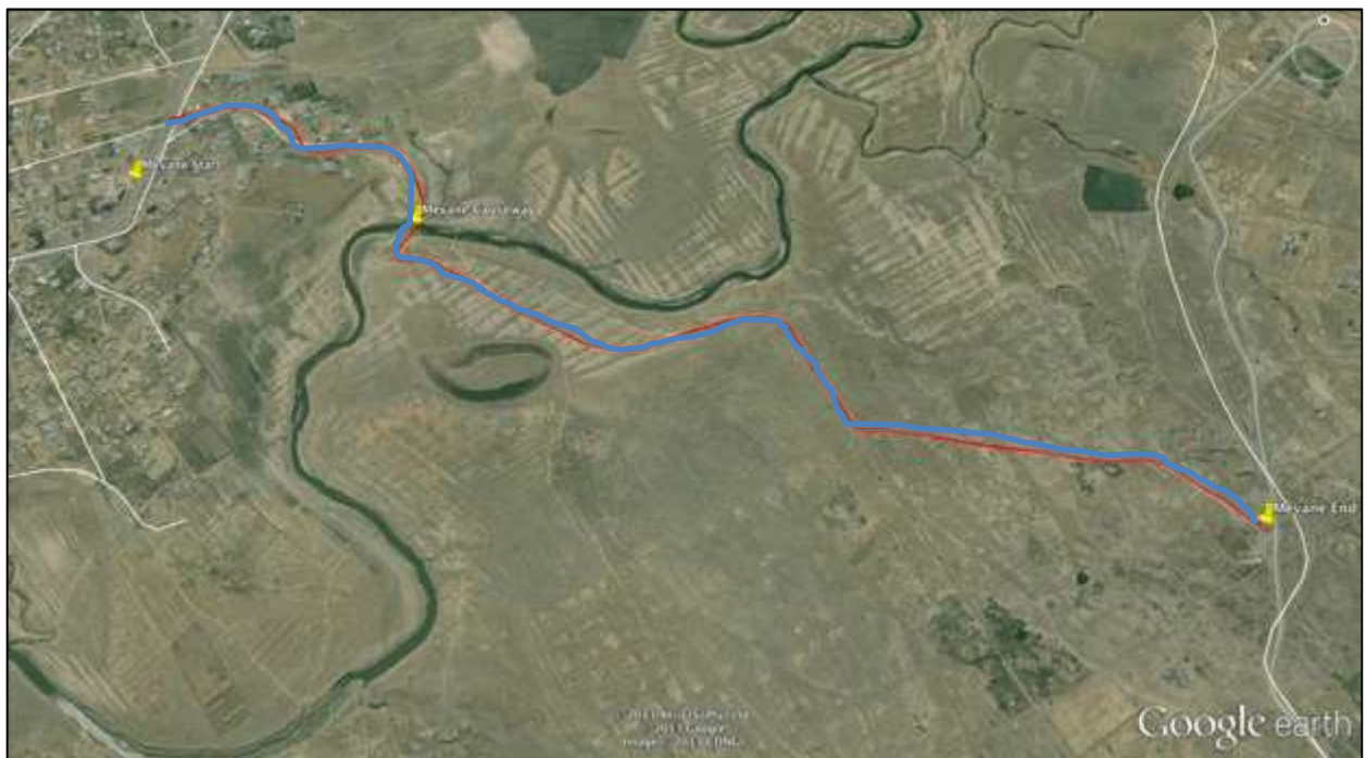
Figure 4. GPS track path

Fieldwork for this study was performed on the 6 th of July 2013. The area was found to be accessible by vehicle (4x4 was needed in places, especially the site for the proposed causeway). Areas of possible significance were investigated on foot. The survey was tracked using GPS and a track file in GPX format is available on request.