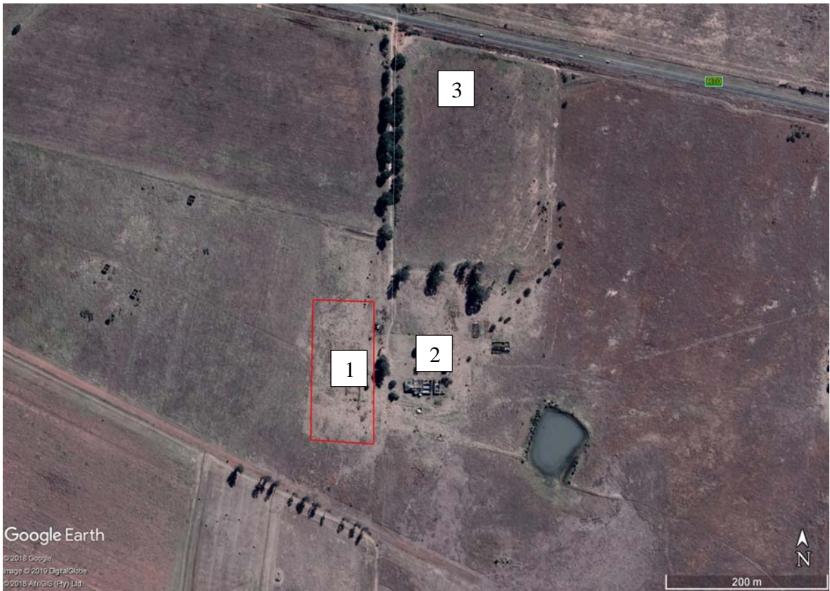
Figure 3: Photograph positions