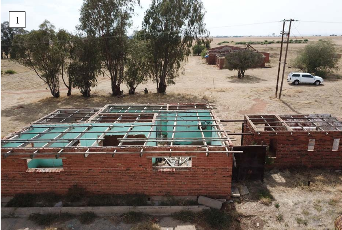
Photograph 1: Structures situated on the site earmarked for development (structures are not older than 60 years)