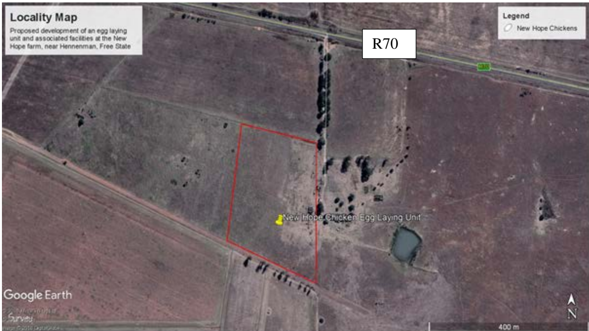
Figure 2: Aerial image of site earmarked for development