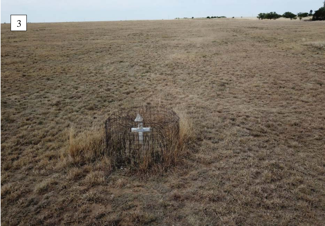
Photograph 3: Memorial situated in the greater study area (will not be impacted on by the proposed development)