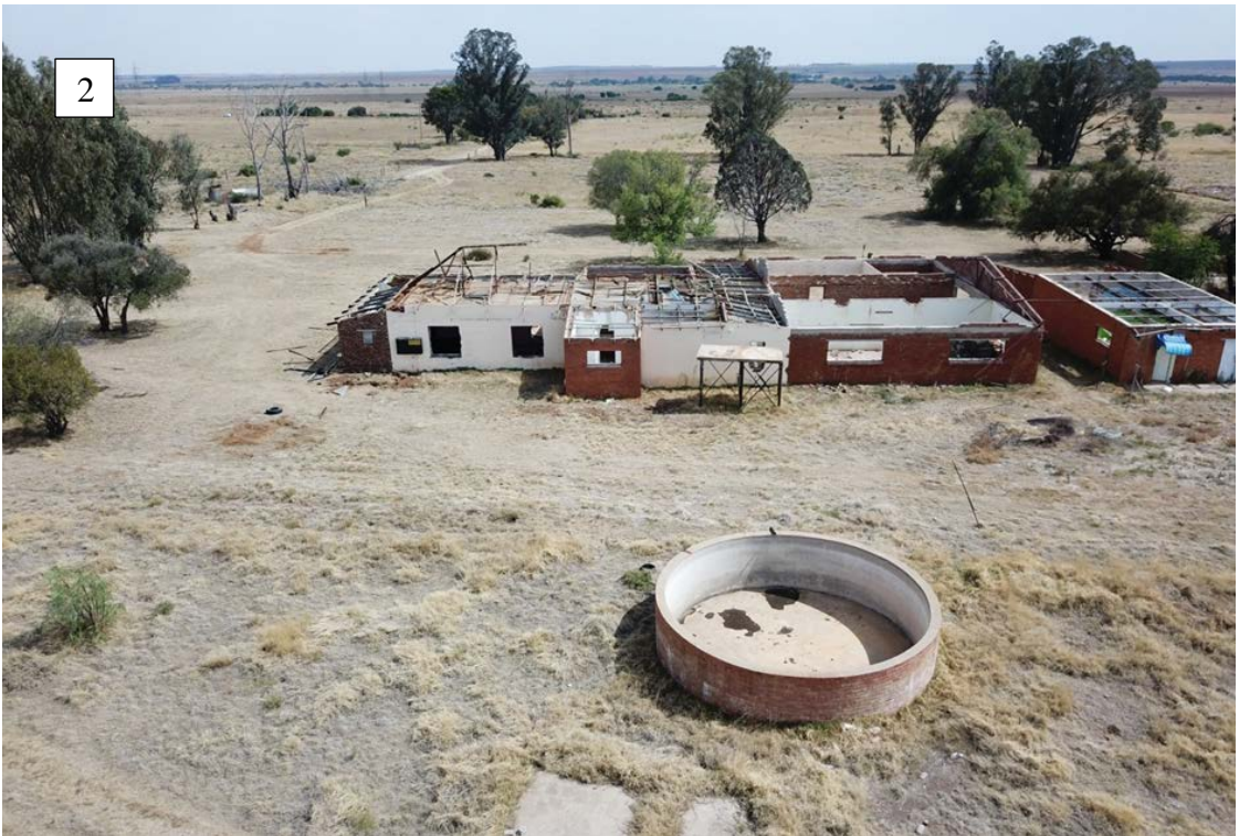
Photograph 2: Structures situated near the site earmarked for development (structures are not older than 60 years)