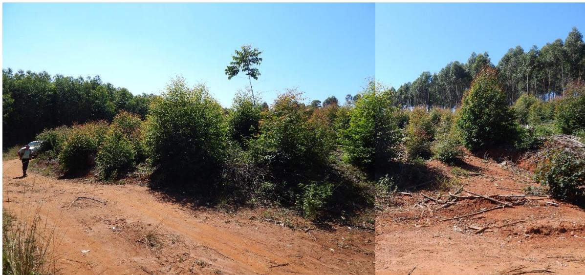
Fig. 4: A general view of the area where Dam 2 will be located. The area is still part of the timber plantation, with young trees.