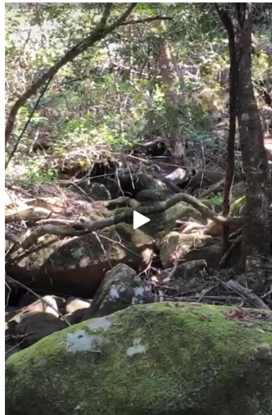
Fig. 8 & 9: Weir 1 where it will be constructed at the bottom of the valley, at the confluence of three drainage lines. The drainage lines are currently dry.