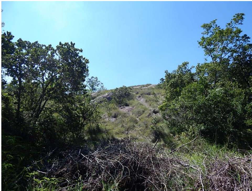
Fig. 11: The rocky outcrop to the left of the area where Weir 2 will be constructed.