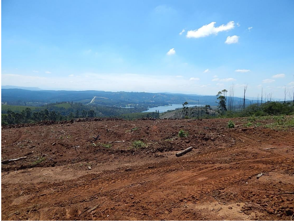
Fig. 3: Another view of the area where Dam 1 will be located. The Dagama Dam is visible in the north.