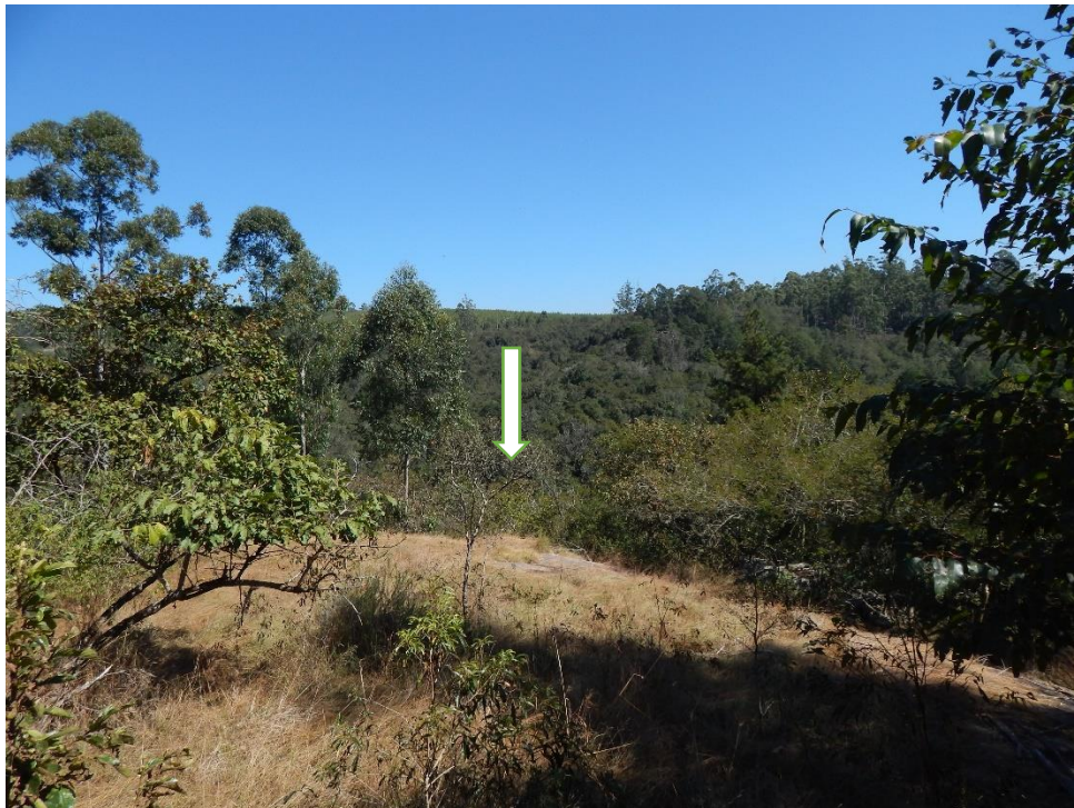
Fig. 6: Weir 1 will be located in the drainage line between the two hills. The arrow indicates the area.