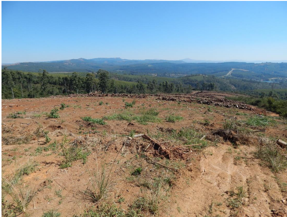
Fig. 2: The area for Dam 1 was previously a timber plantation which has been cleared of vegetation. The view faces north.