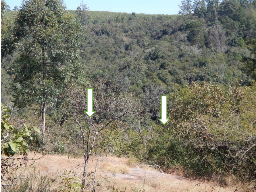
Fig. 7: A closer view of the area where Weir 1 will be located (see arrows).