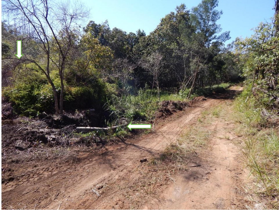
Fig. 10: Weir 2 will be constructed from the low outcrop to the left (see arrow), to incorporate the stream which flows under the gravel road (see arrow).