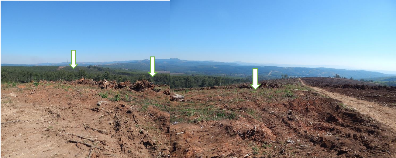
Fig. 1: A panoramic view of the study area. The arrows indicate roughly where the three dams will be located. The Weirs will be constructed in the valley below.