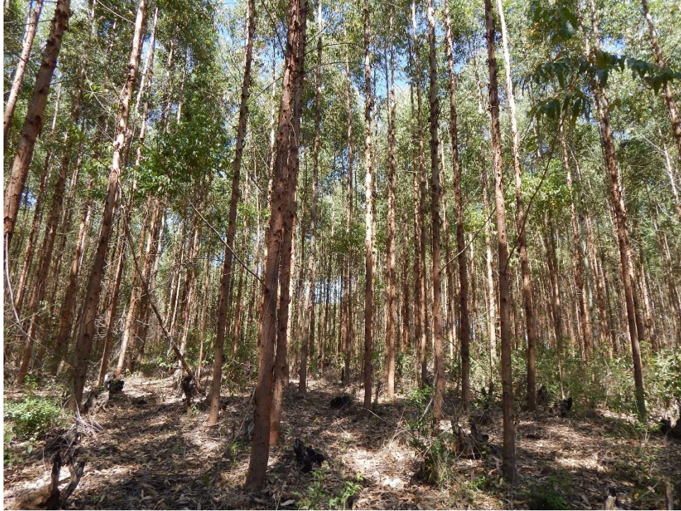
Fig. 5: A general view of the location for Dam 3. The area is entirely within the timber plantation.