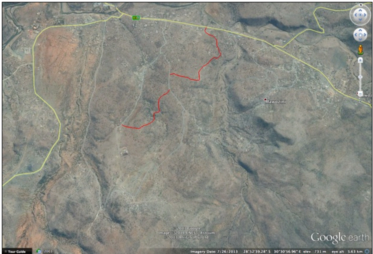
Figure 2. Aerial view of proposed upgrade