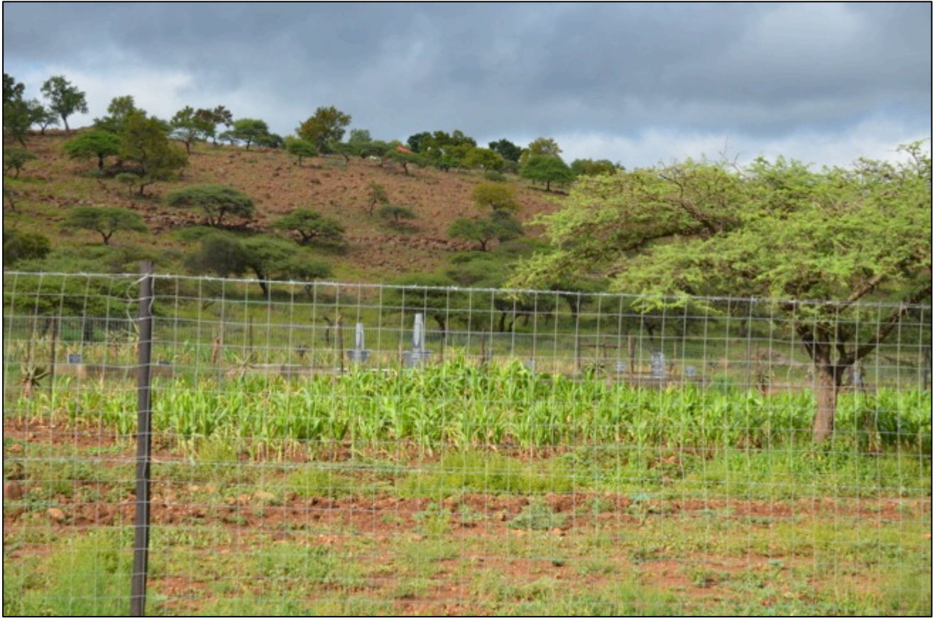
Figure 5. Graveyard at Site 1