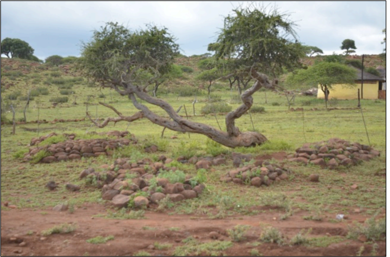
Figure 7. Seven graves at Site 3