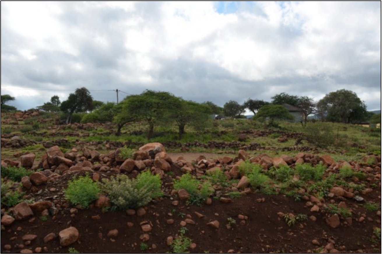
Figure 6. Stone walled kraal structures