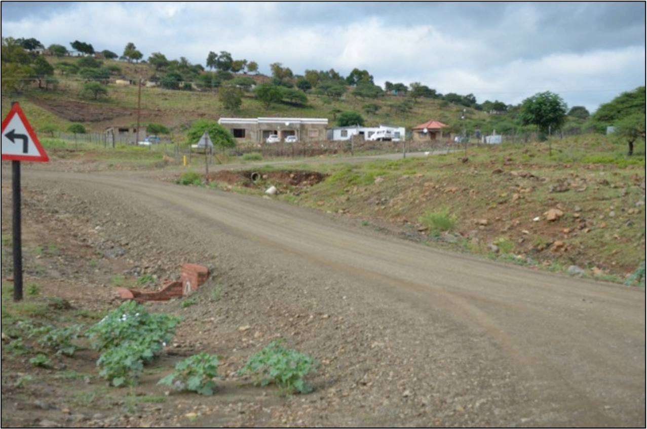
Figure 4. Start of road