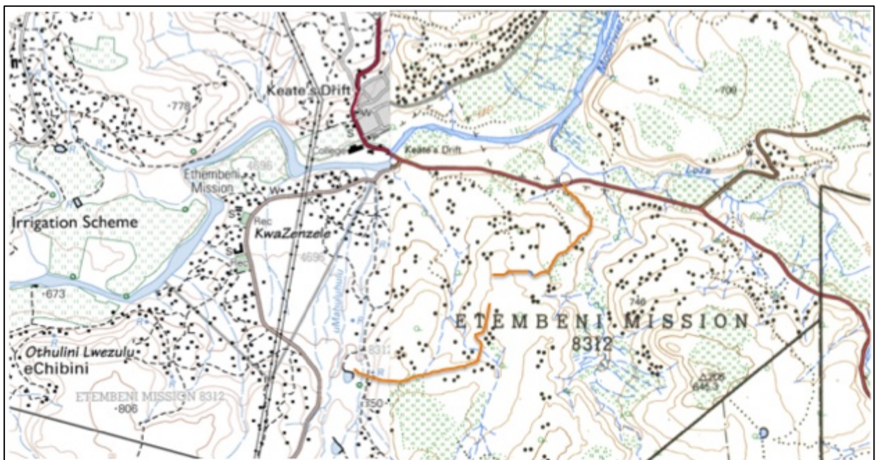
Figure 3. GPS track path for the study ostensibly followed the road alignment

Fieldwork for this study was performed on the 6 th of February 2014. The area was found to be accessible by vehicle. Areas of possible significance were investigated on foot (such as the graves). The survey was tracked using GPS and a track file in GPX format is available on request.