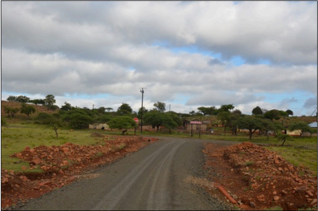
Figure 8. End of upgrade