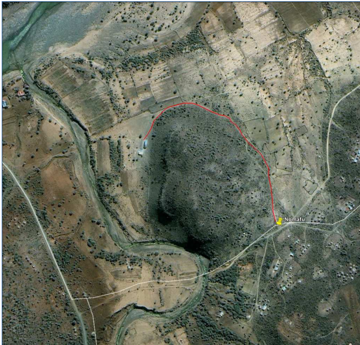
Figure 1. Aerial view of proposed upgrade