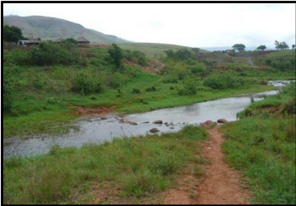
Figure 3. Present crossing at the Sikwebezi River