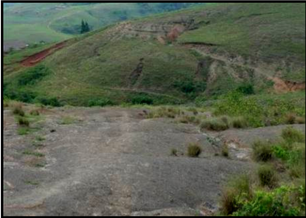
Figure 2. Google aerial photograph showing the road adjacent to the proposed Isdudana Causeway.