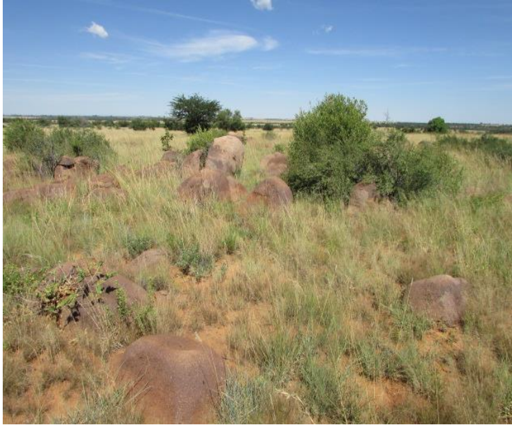
Fig.9: Some rocky outcrops and boulders on the hills. We checked these for the presence of possible engravings but none were found.