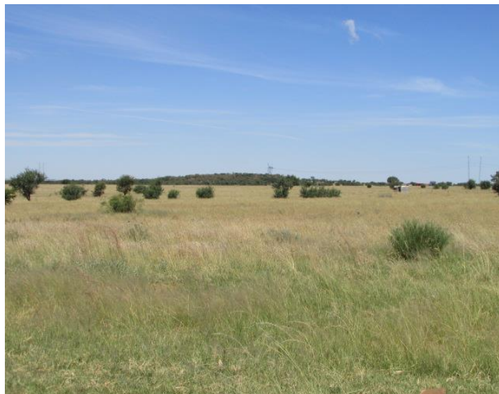
Fig.6: Another view showing the low hills to the South and south-east of the study area.