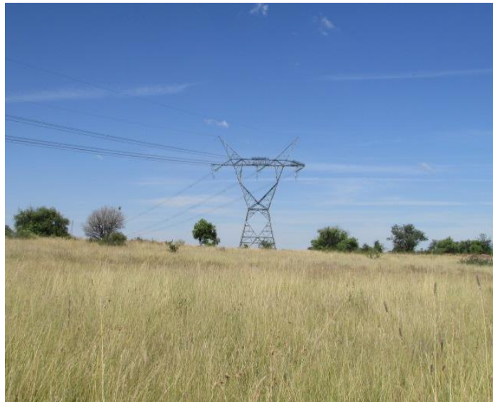
Fig.10: An Eskom powerline crosses the hill section. This would also have had an impact on the area already.