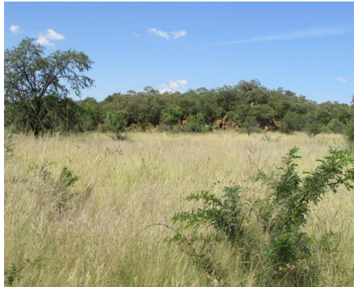
Fig.8: On top of the low hills to the south and south-east.