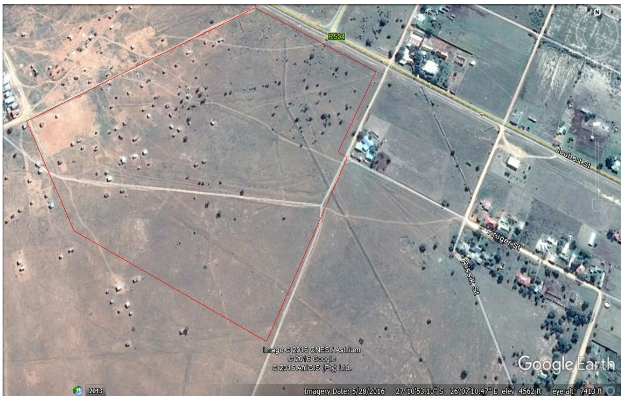
Fig.2: Closer view of study area in red polygon (Google Earth 2016 – Image date 5/28/2016).