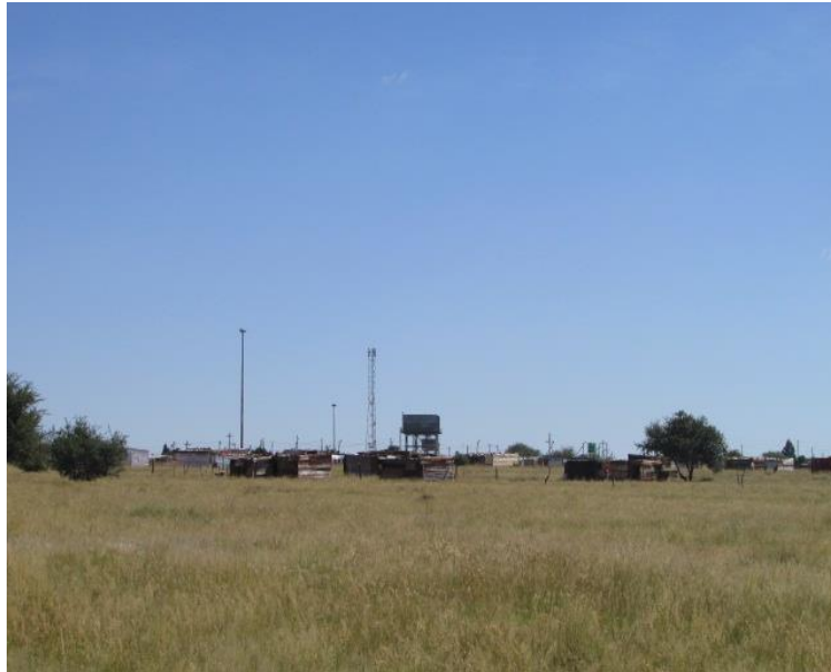
Fig.5: Another view showing some of the shacks in the study area.