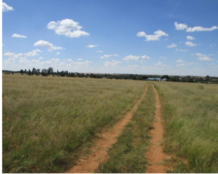
Fig.7: Another view showing the open and flat nature of the study area.