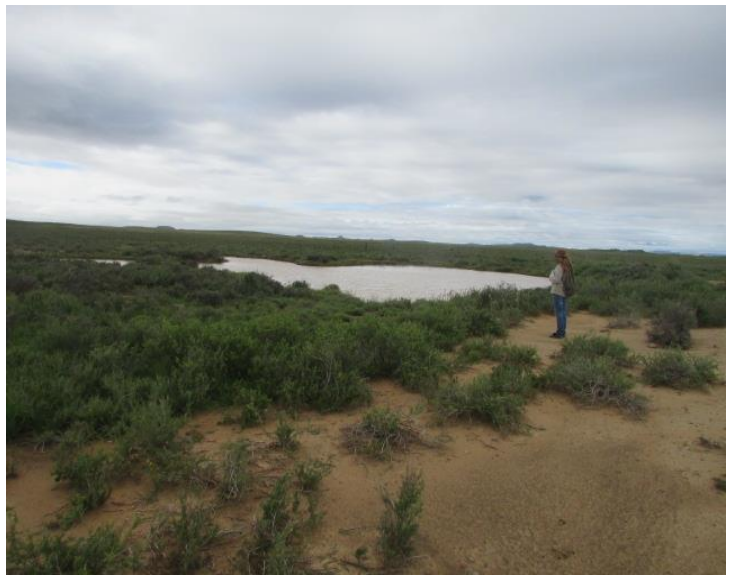
Fig.7: Recent rains have filled pans and streams in the area accentuating the wetlands present here.