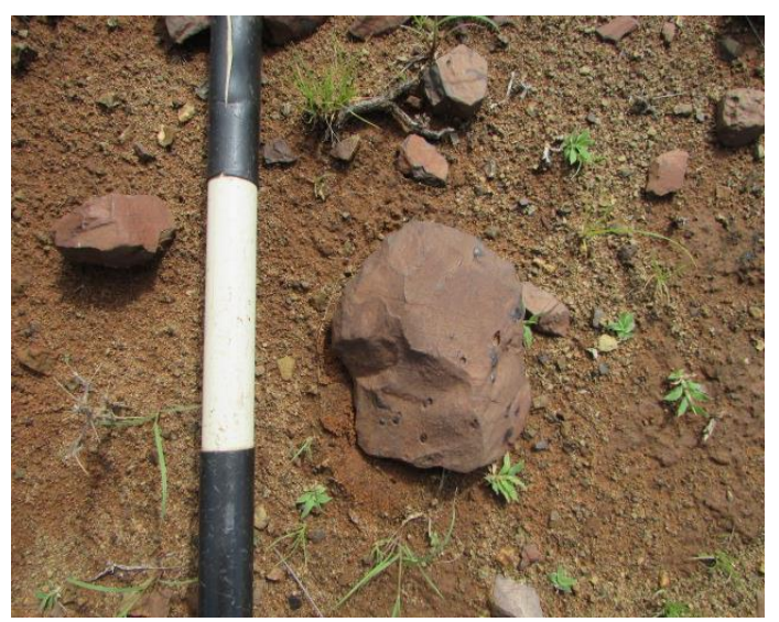
Fig.30: More tools from Site 23.