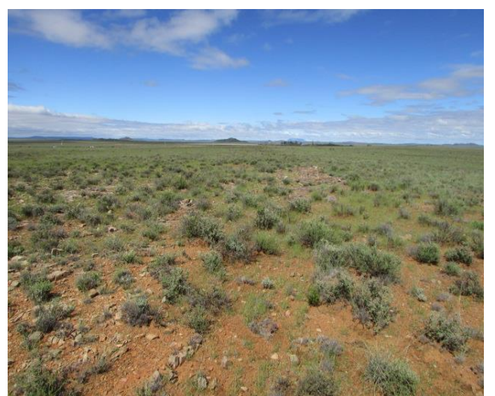
Fig.27: A view of a section of Site 23.