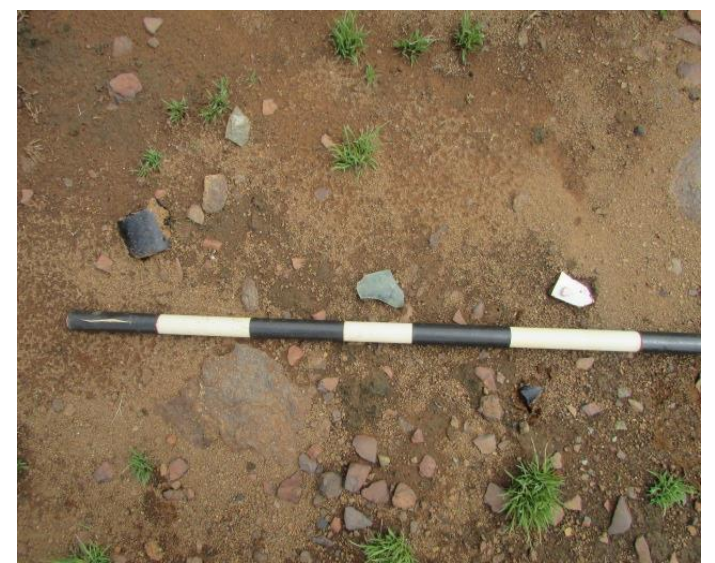
Fig.17: Late 19<sup>th</sup> century glass and porcelain at Site 10.