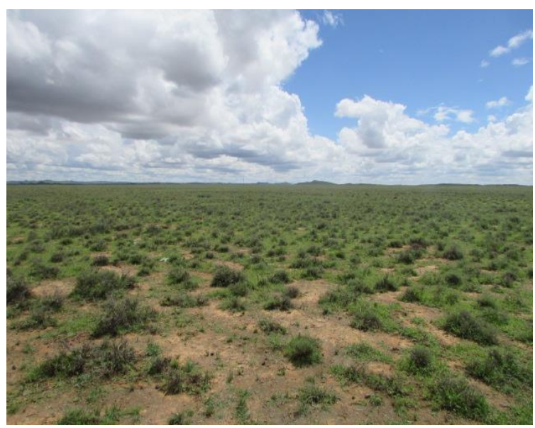
Fig.4: A general view of the Area 3 location.