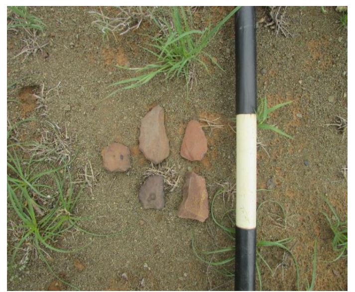
Fig.13: Stone tools found at Site 3.