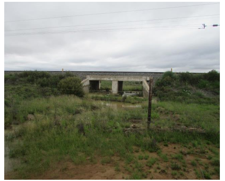
Fig.8: A view of the De Aar-Hanover railwayline.