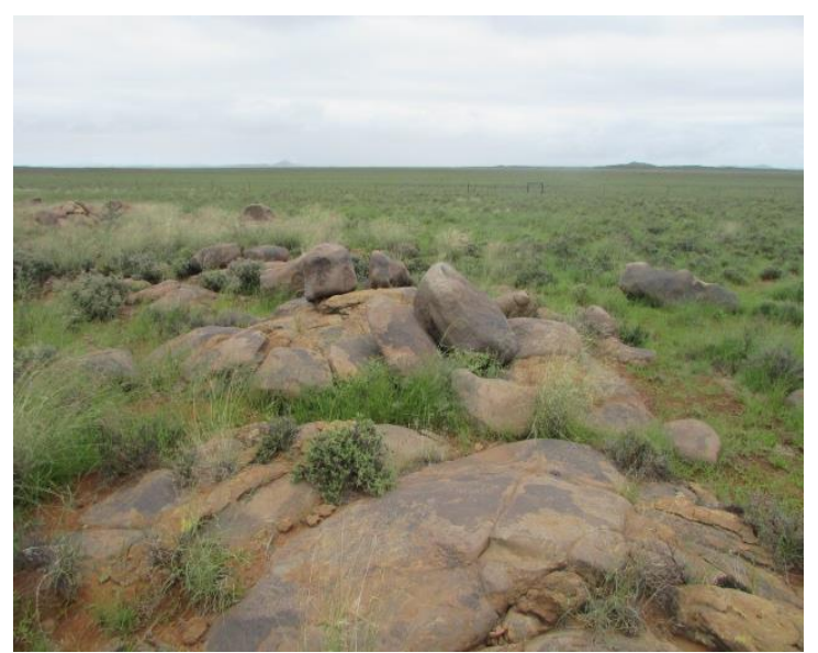
Fig.15: Site 6 location.