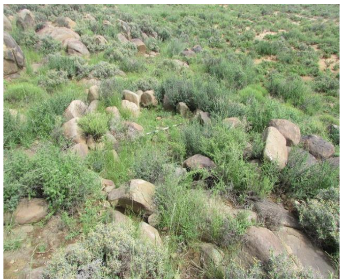
Fig.16: Circular enclosure at Site 10. This is likely an Anglo-Boer War Redoubt.