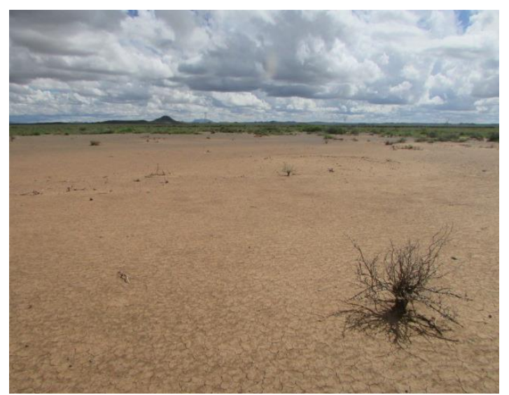
Fig.10: Open areas and wetland sections/dry pans are located throughout the larger area.