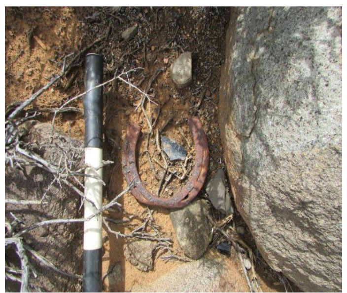
Fig.33: Horseshoe found at Site 24.