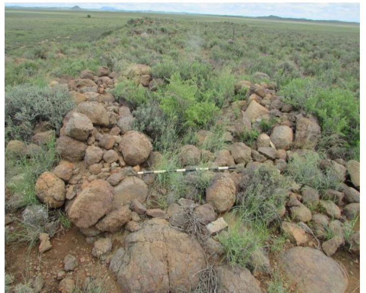
Fig.19: Site 14 stone enclosure. Possible Anglo-Boer War redoubt.