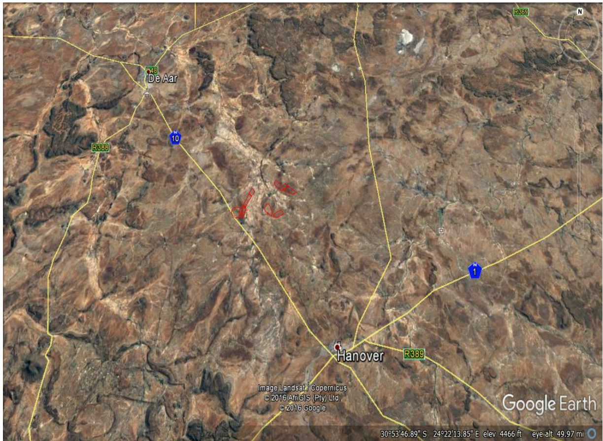
Fig.1: General location of study area. The areas in red are the 3 proposed PV Plant locations.

open, with some rocky ridges/outcrops and low hills surrounding and on the outer boundaries. Visibility was fairly good during the assessment. Recent rains also accentuated the presence of wetlands and streams in the study area, with some sections inaccessible at the time of the assessment. In general the area has not been disturbed by modern developments, except for the railway line that is situated on the northeast of the study area and west of and bordering Area 2 and east of Areas 1 & 3. Existing 400Kv Eskom Powerline corridors cuts through the areas and have had some impact, with the largest other type of impact being agricultural activities (sheep/cattle; grazing and limited crop growing and ploughing). Farmsteads and related infrastructure are also present, but these will not be directly impacted by the proposed development actions.