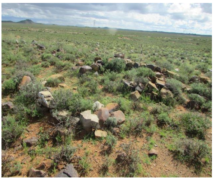
Fig.22: Site 19 stone enclosure/redoubt.