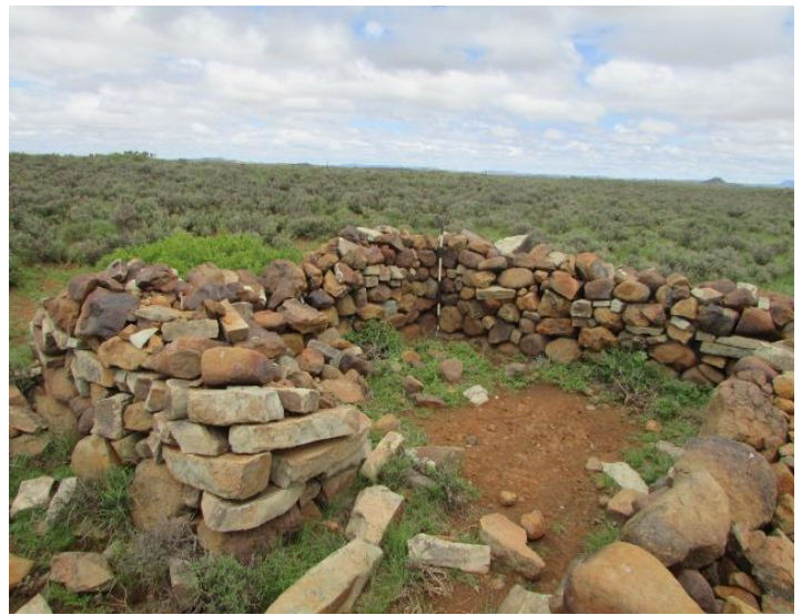
Fig.18: Site 13 stone kraal.