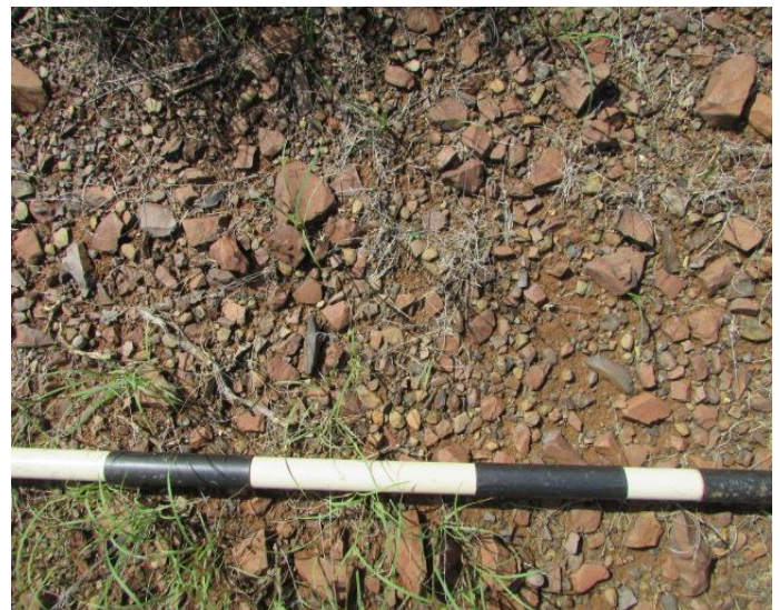
Fig.31: A dense scatter of Stone Age material on Site 23.