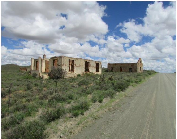
Fig.37: Ruins of old farmstead near Burgerville Site 35.