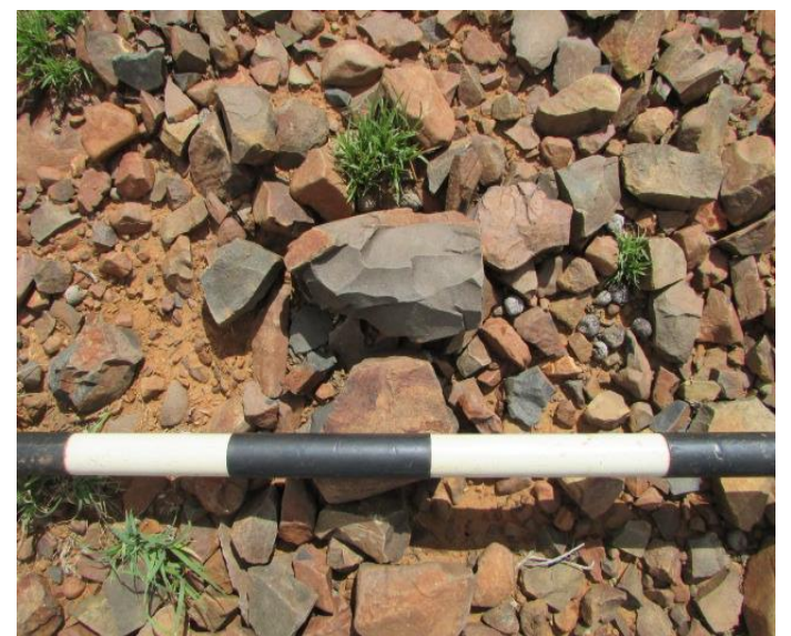
Fig.29: Site 23 contains dense scatters of Stone tools that include cores and flakes.