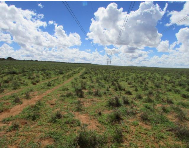
Fig.11: View of one of the ESKOM powerline corridors close to the Area 1 proposed substation.