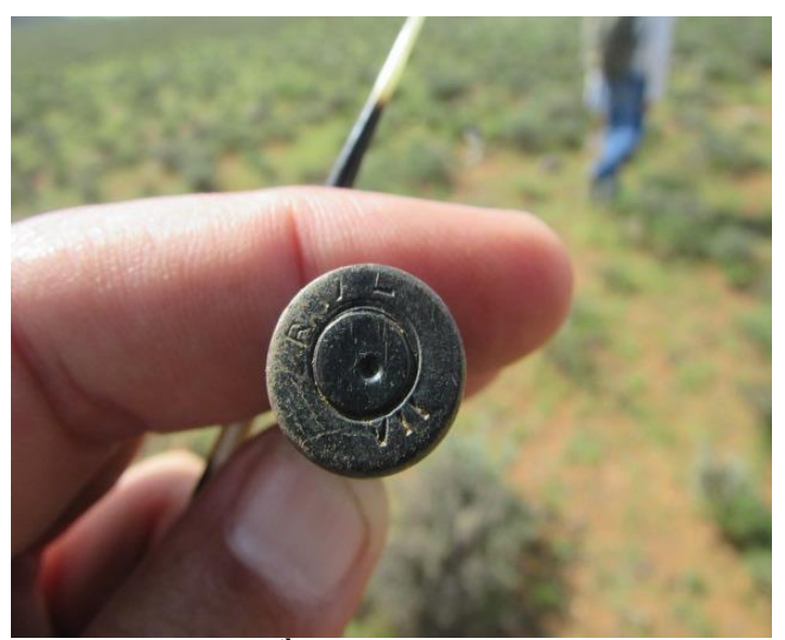
Fig.23: A late 19<sup>th</sup> century British .303 cartridge at Site 19.