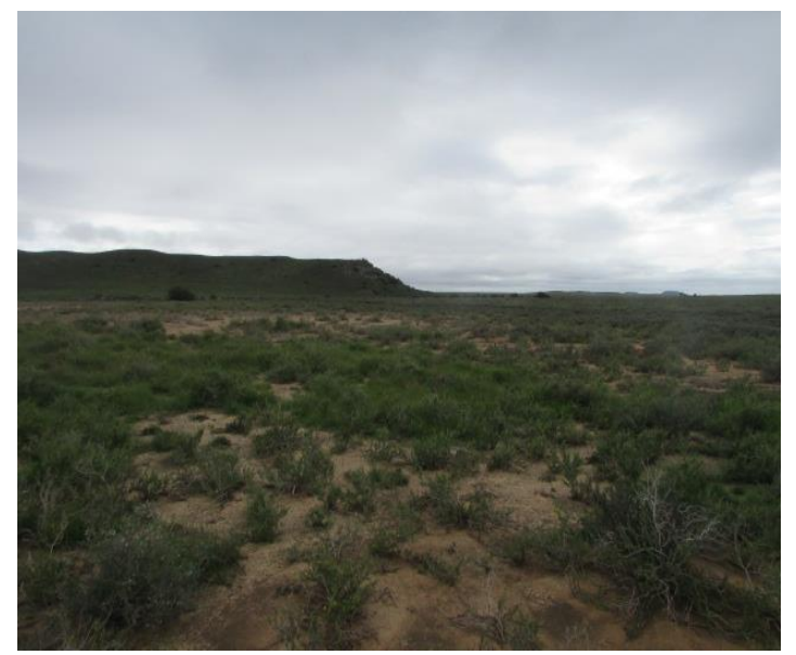
Fig.6: Some rocky ridges and low hills are also located in sections of the study area.