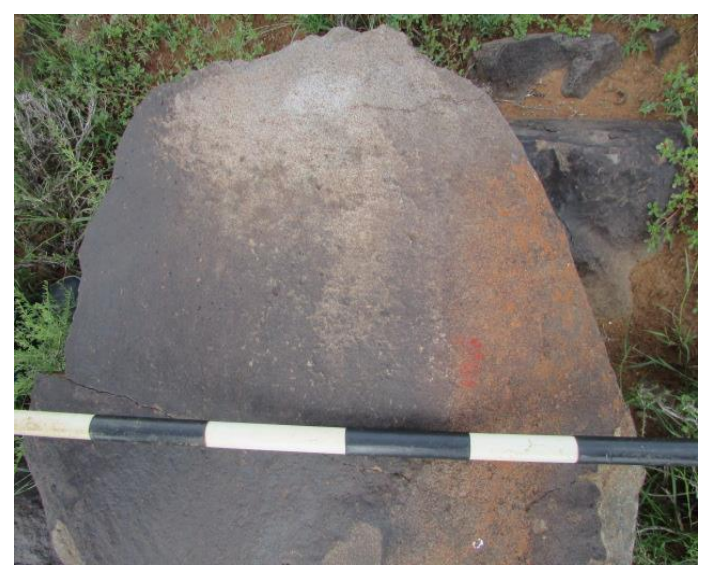
Fig.25: A number of stones close to these Stone-packed enclosures have evidence of being hammered and used.