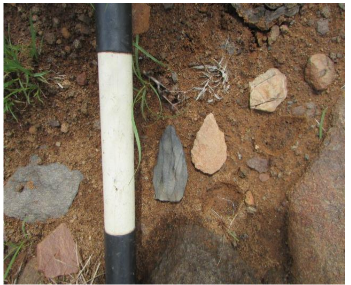
Fig.34: Stone tools at Site 27.