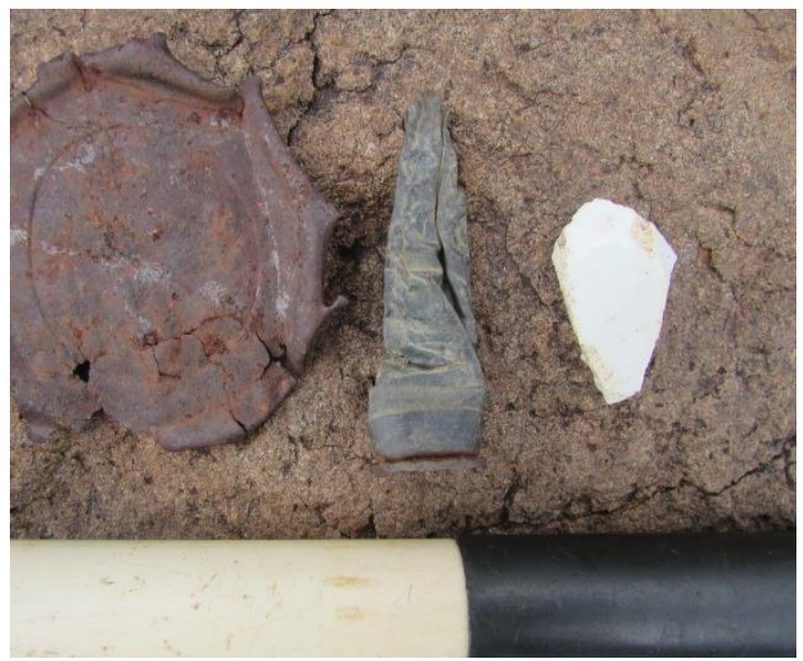
Fig.20: Food tin, spent Martini-Henry cartridge & porcelain from Site 14.