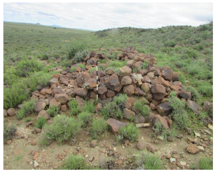
Fig.21: A rectangular enclosure at Site 14.