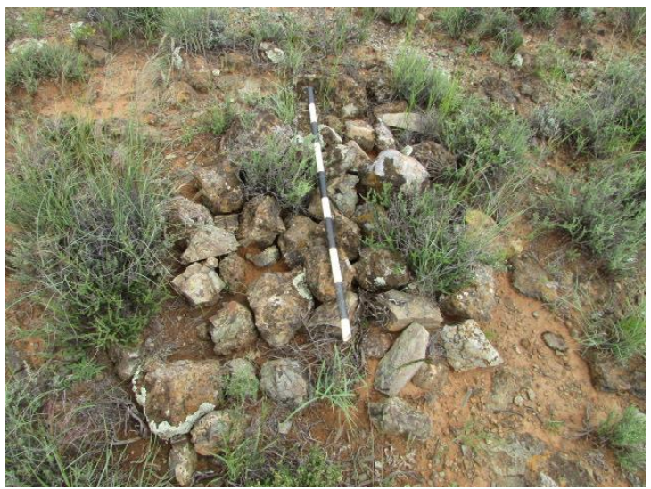
Fig.35: Possible grave at Site 31.