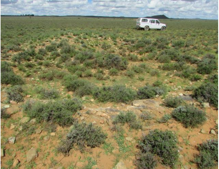
Fig.38: One of three circular "excavations" on Site 36. These are most likely dried-up dams/water holes.