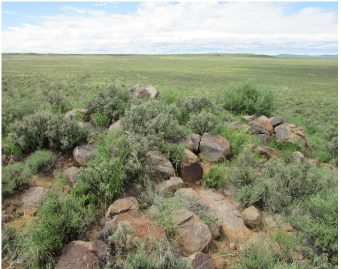
Fig.32: Site 24 Stone-packed feature.