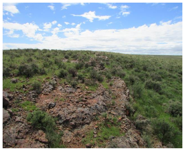
Fig.28: Another section of Site 23.