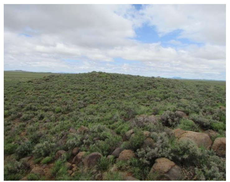
Fig.9: Another of the rocky ridges in the area.