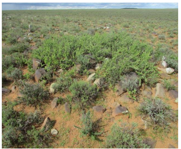
Fig.24: Another stone-packed enclosure at Site 20.