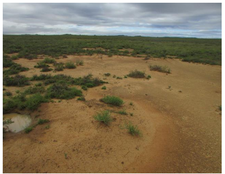
Fig.5: A view of a section of the larger area showing some open eroded areas.