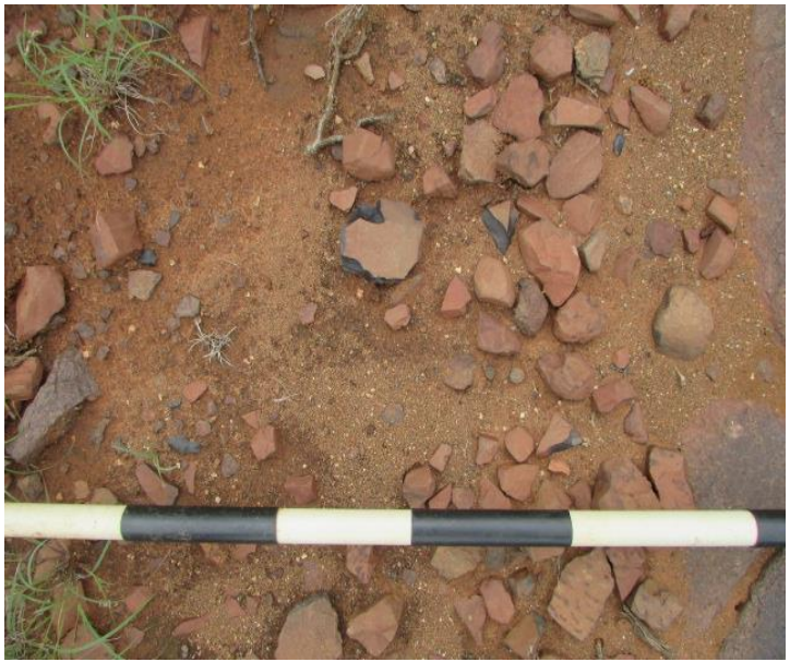
Fig.14: A denser scatter of Stone tools at Site 6.