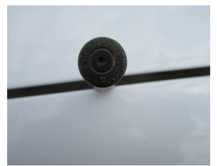
Fig.36: Spent British .303 cartridge at Site 34 dating to the Anglo-Boer War period.