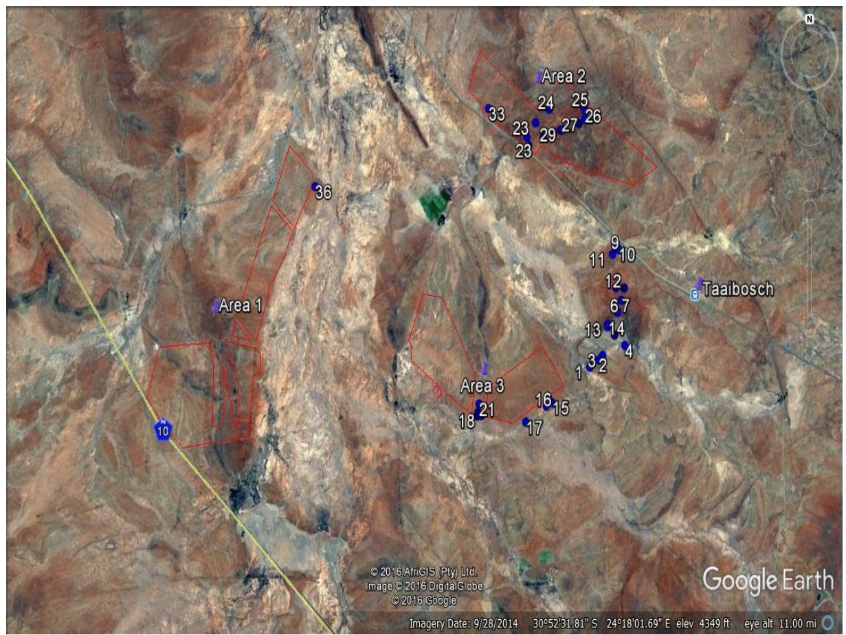
Fig.12: Distribution of sites found during February 2017. The whitish-grey areas indicate waterlogged/wetland sections and most of these were inaccessible during the survey (Google Earth 2016).

identified then an expert should be called in to investigate and recommend on the best way forward.