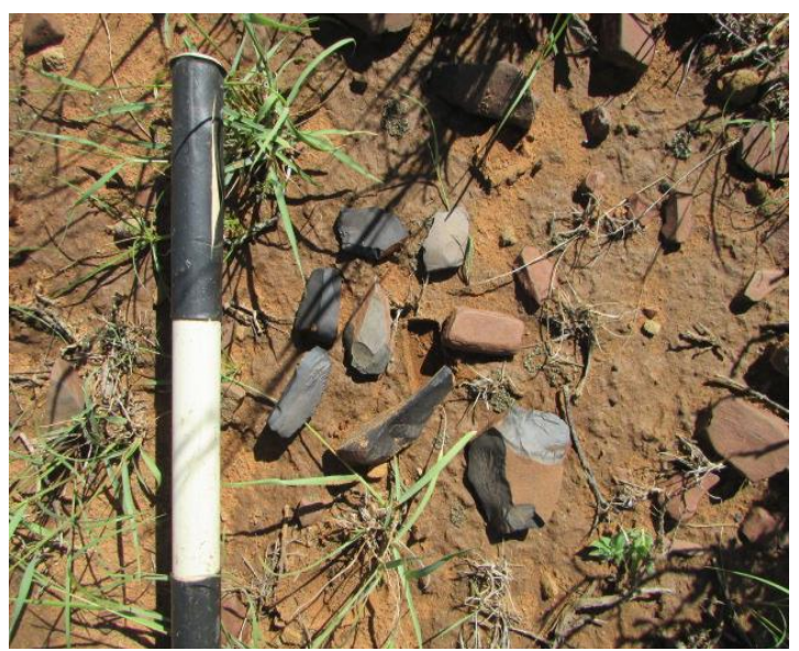
Fig.26: A scatter of Stone tools at Site 22.