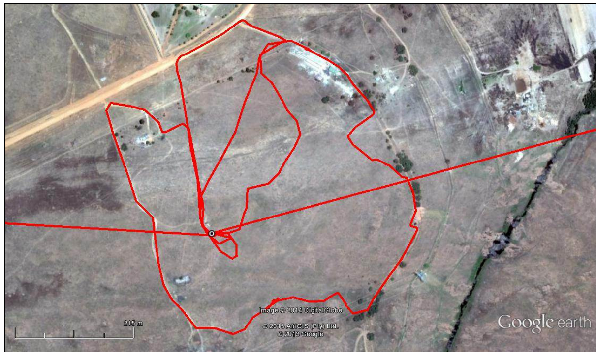
Figure 5 GPS track of the surveyed area. North reference is to the top.