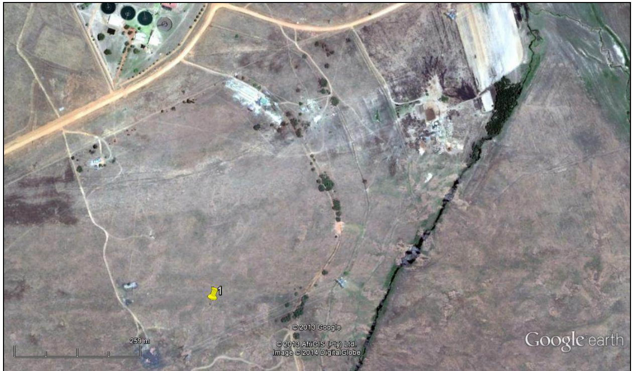
Figure 13 Location of the site identified during the survey.