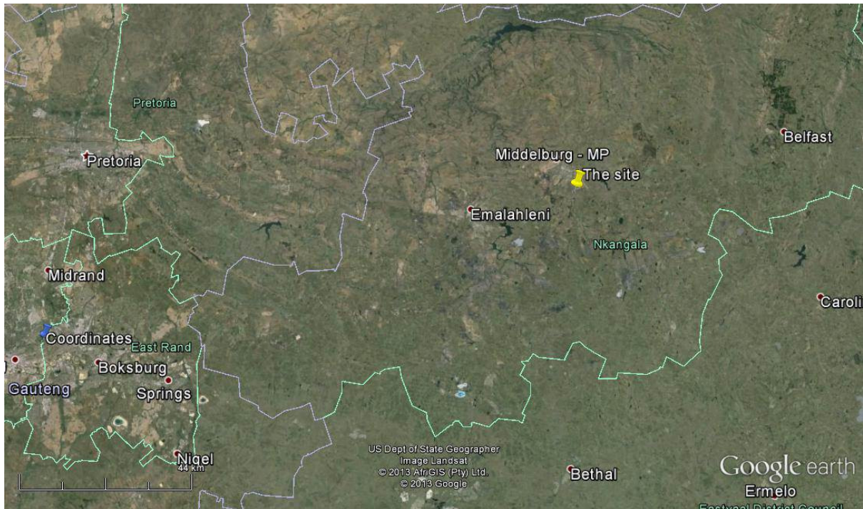
Figure 1 Location of the surveyed site in the Mpumalanga Province. North reference is to the top of the map.

The client indicated the area to be surveyed. The field survey was confined to this area.