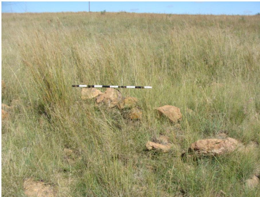
Figure 12 Stone walled remains of a recent workers dwelling.

The site is regarded as having a low cultural significance. It is not very unique and most likely younger than 60 years. The field rating thereof is General Protection, Grade C (IVC). It should be included in the heritage register, but this report is seen as ample mitigation.