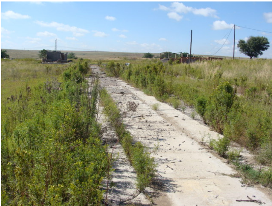
Figure 9 Some of the remains of the lintel plant in the surveyed area.