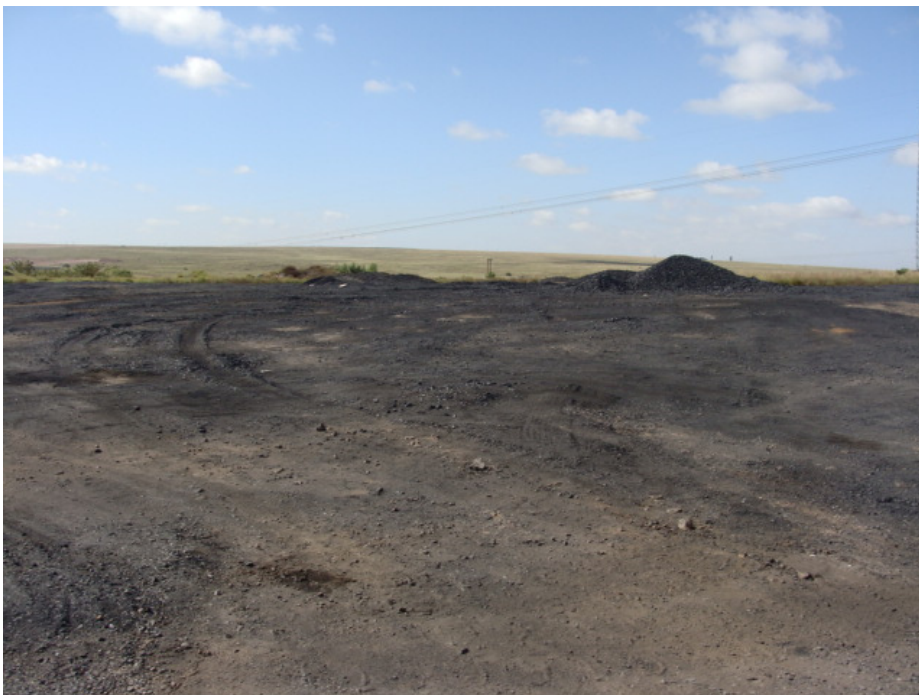
Figure 7 View of the area that was used as a coal stockpile.