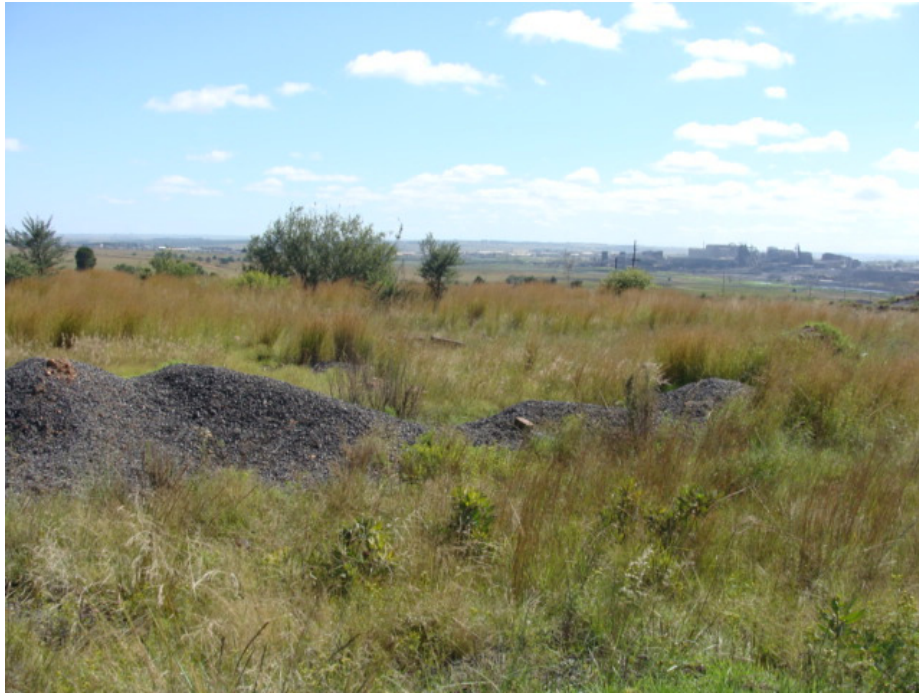
Figure 6 General view of the surveyed area. Note the disturbance and pioneer plant species.