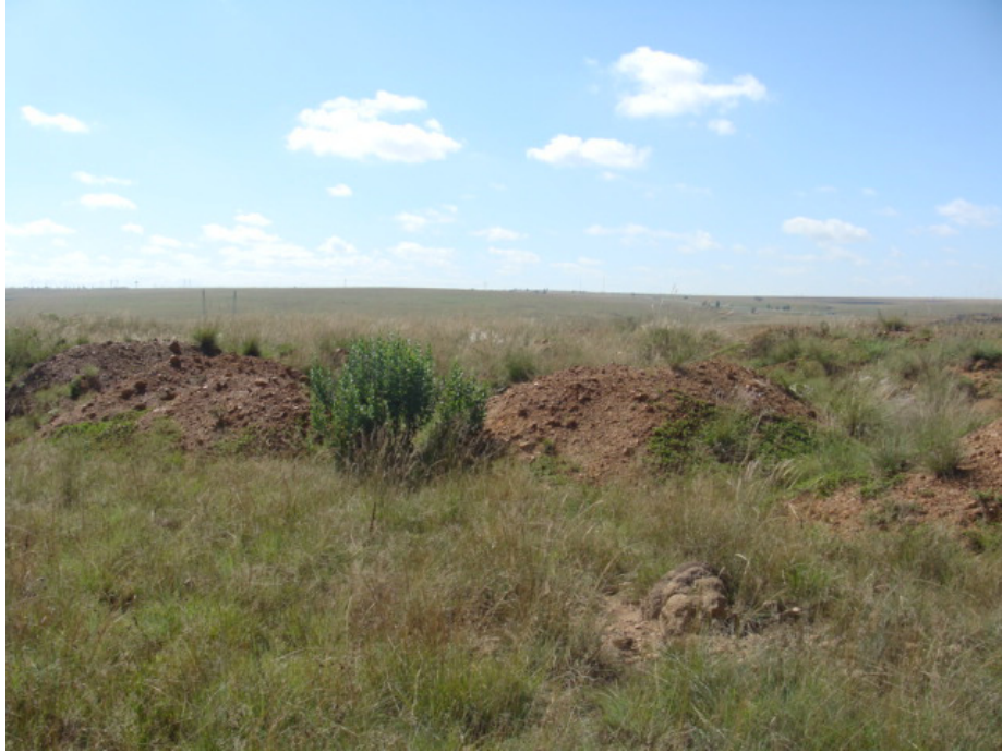
Figure 8 Further signs of disturbance in the surveyed area.