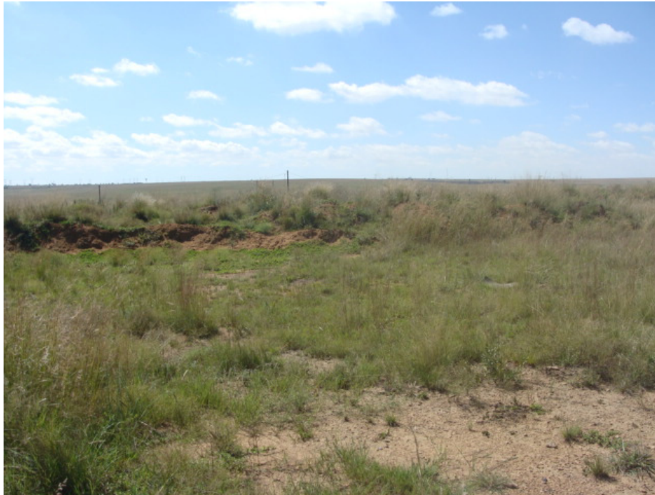
Figure 10 Soil stockpiling in the surveyed area.